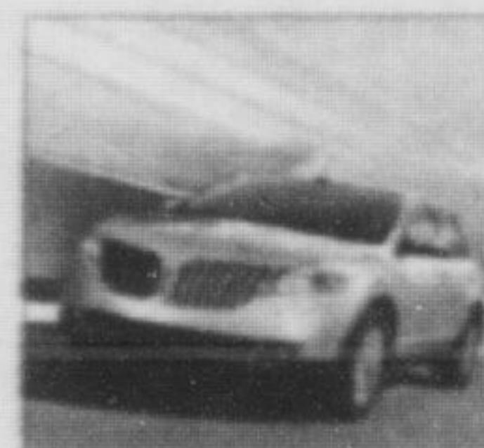
INTELLIGENT ALL-WHEEL DRIVE