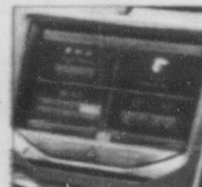
MYLINCOLN TOUCH SM WITH 8" LCD TOUCH SCREEN SM