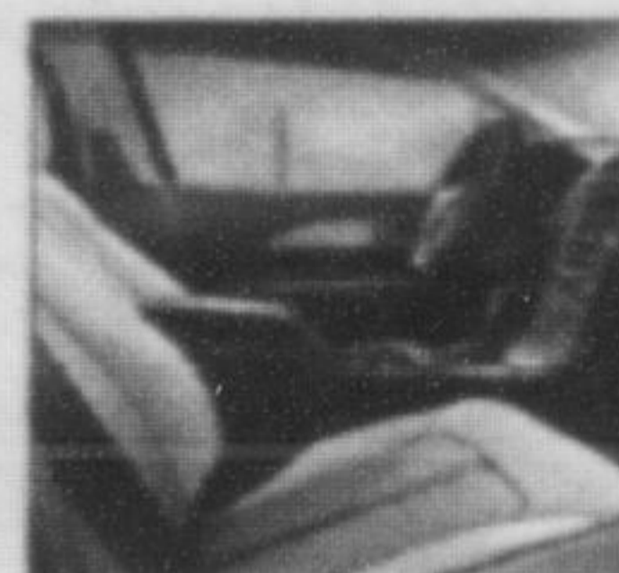
LEATHER HEATED/COOLED FRONT SEATS AND HEATED REAR SEATS