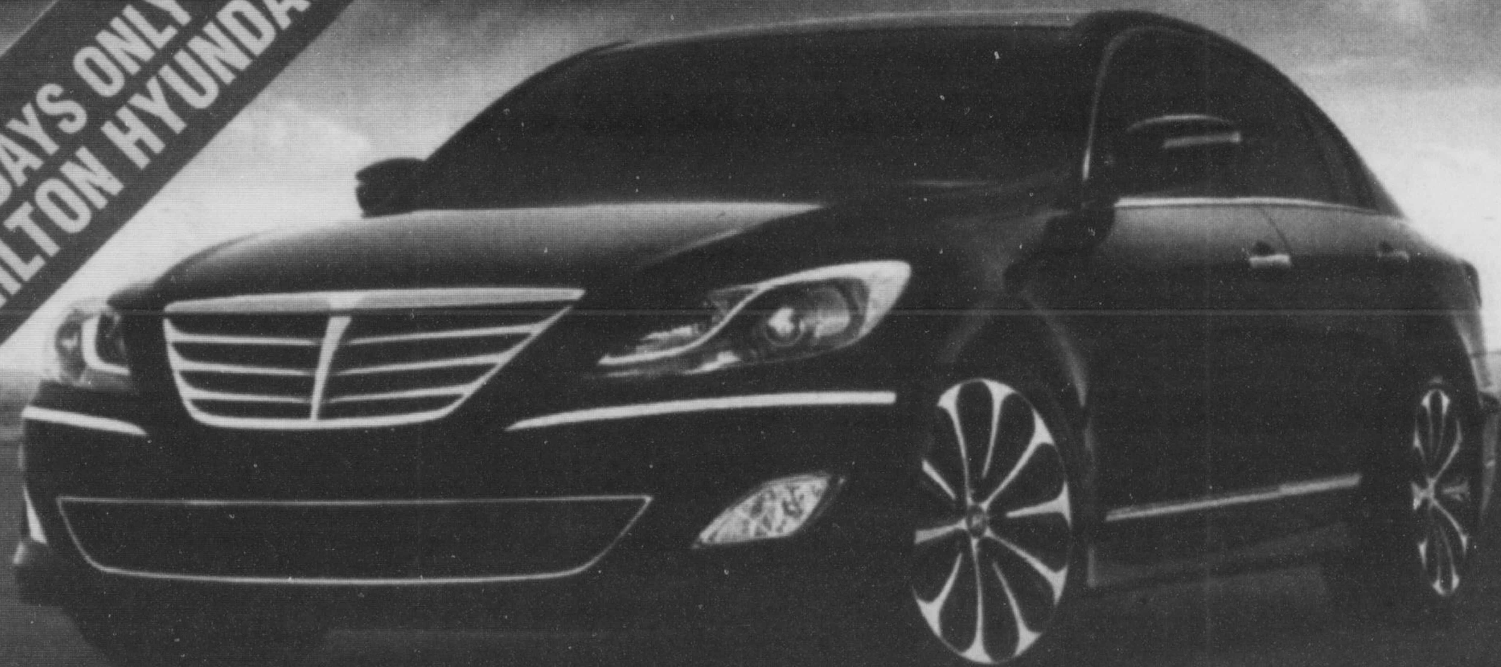
Genesis 5.0L GDI R-Spec Model Shown

HIGHEST RANKED MIDSIZE PREMIUM CAR IN INITIAL QUALITY BY J.D. POWER.