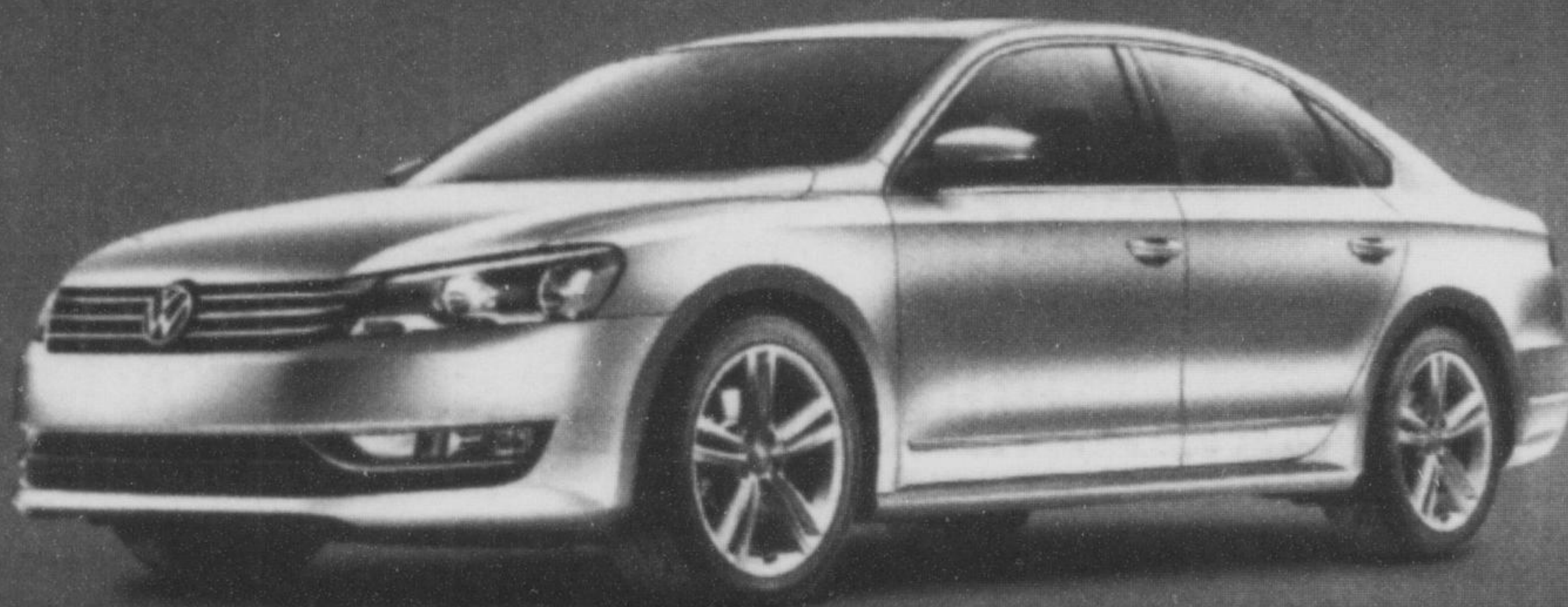
2013 Passat 3.6L