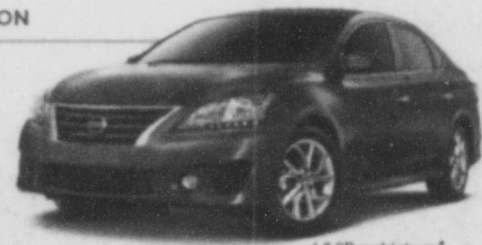
1.8 SR model shown*

FINANCE FROM $88 AT 0% APR FOR 84 MONTHS* PER MONTH $0 DOWN FREIGHT AND FEES INCLUDED • STARTING FROM $15,949*