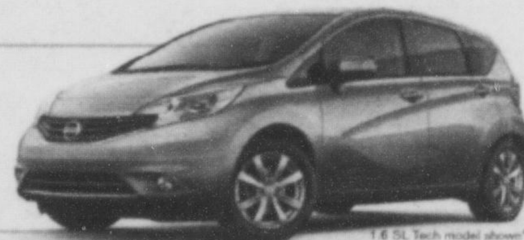
1.6 SL Tech model shown*

FINANCE FROM $78 AT 0.9% APR FOR 84 MONTHS* FREIGHT AND FEES INCLUDED $0 DOWN • STARTING FROM $13,699*