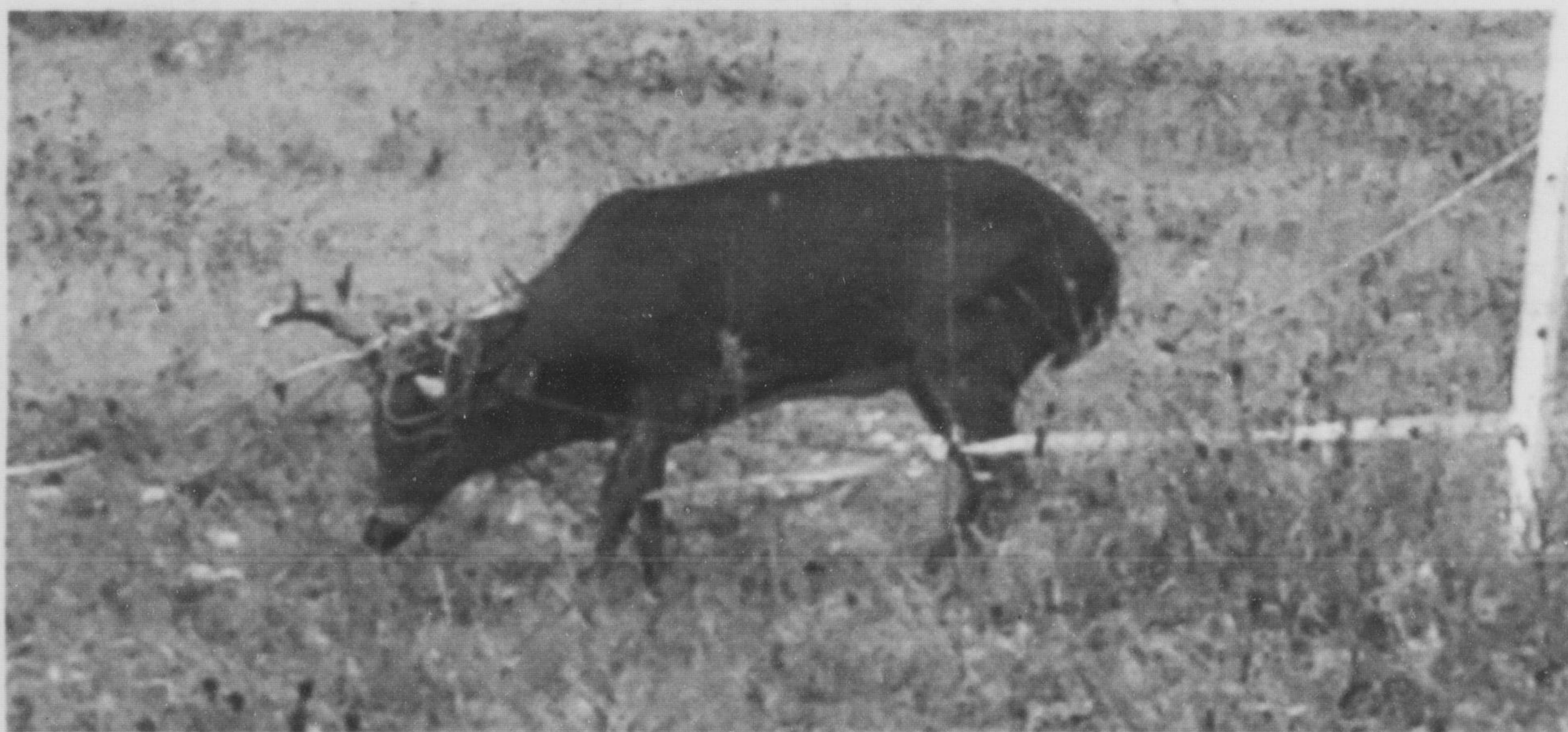
A deer stuck in a fence was discovered by Campbellville farmers Saturday. The Oakville and Milton Humane Society responded and helped free the frightened animal.