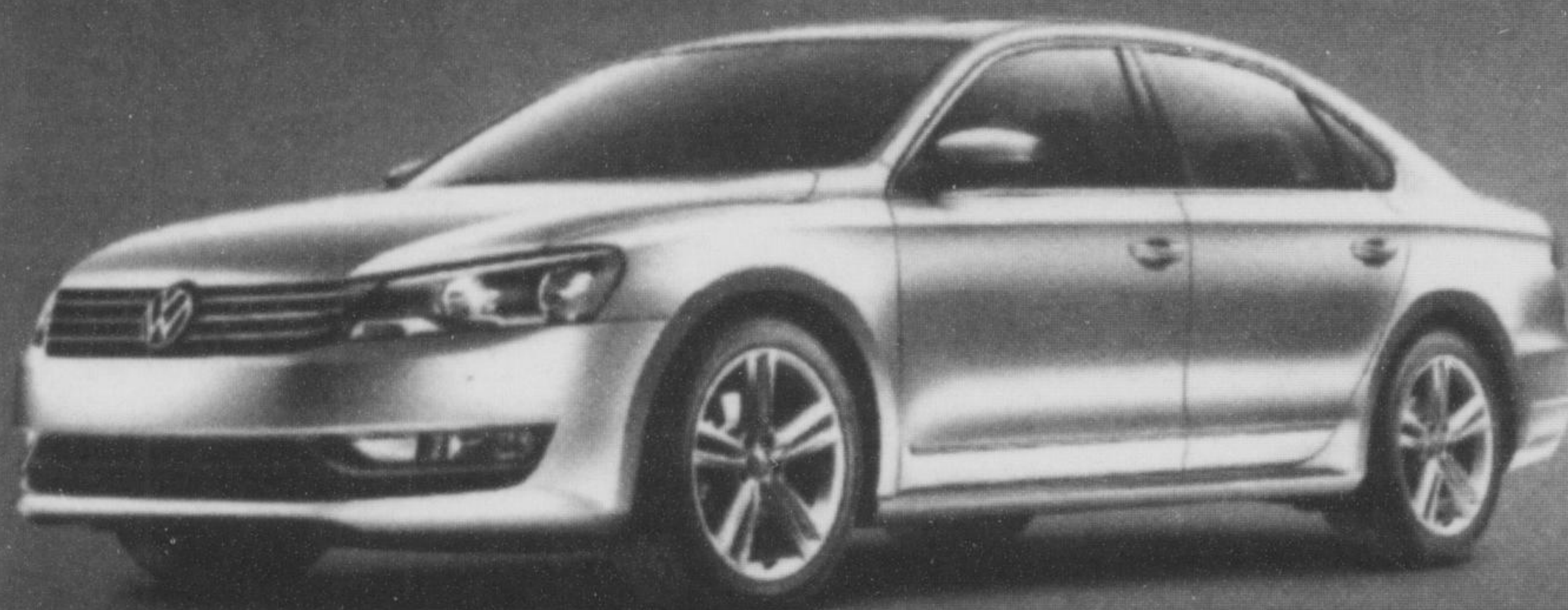
2013 Passat 3.6L