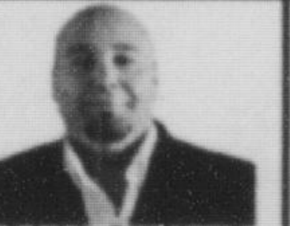
Fabrizio Pacchione* www.fabuloushomes.com