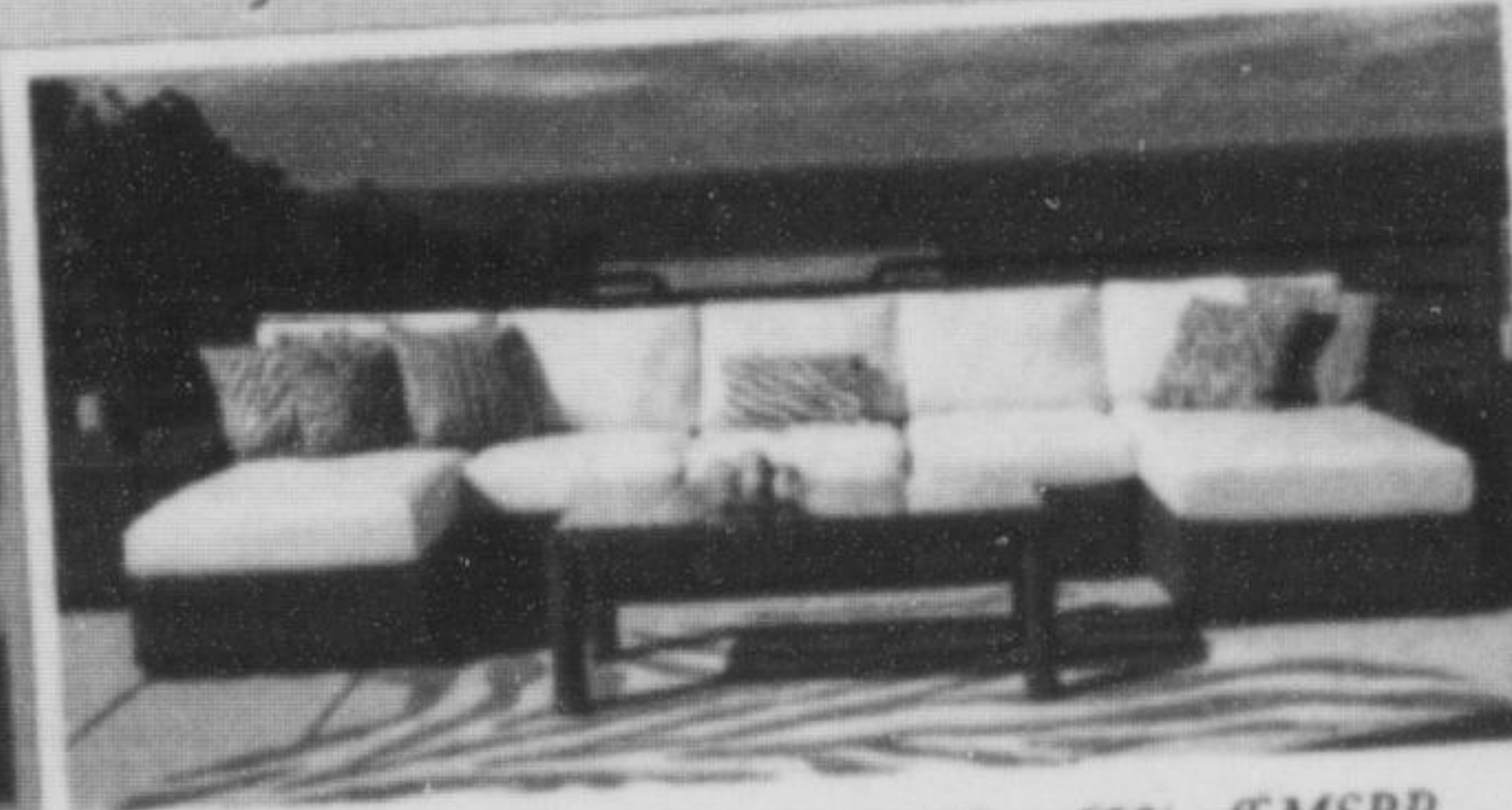
Lloyd Flanders Contempo Now 60% off MSRP