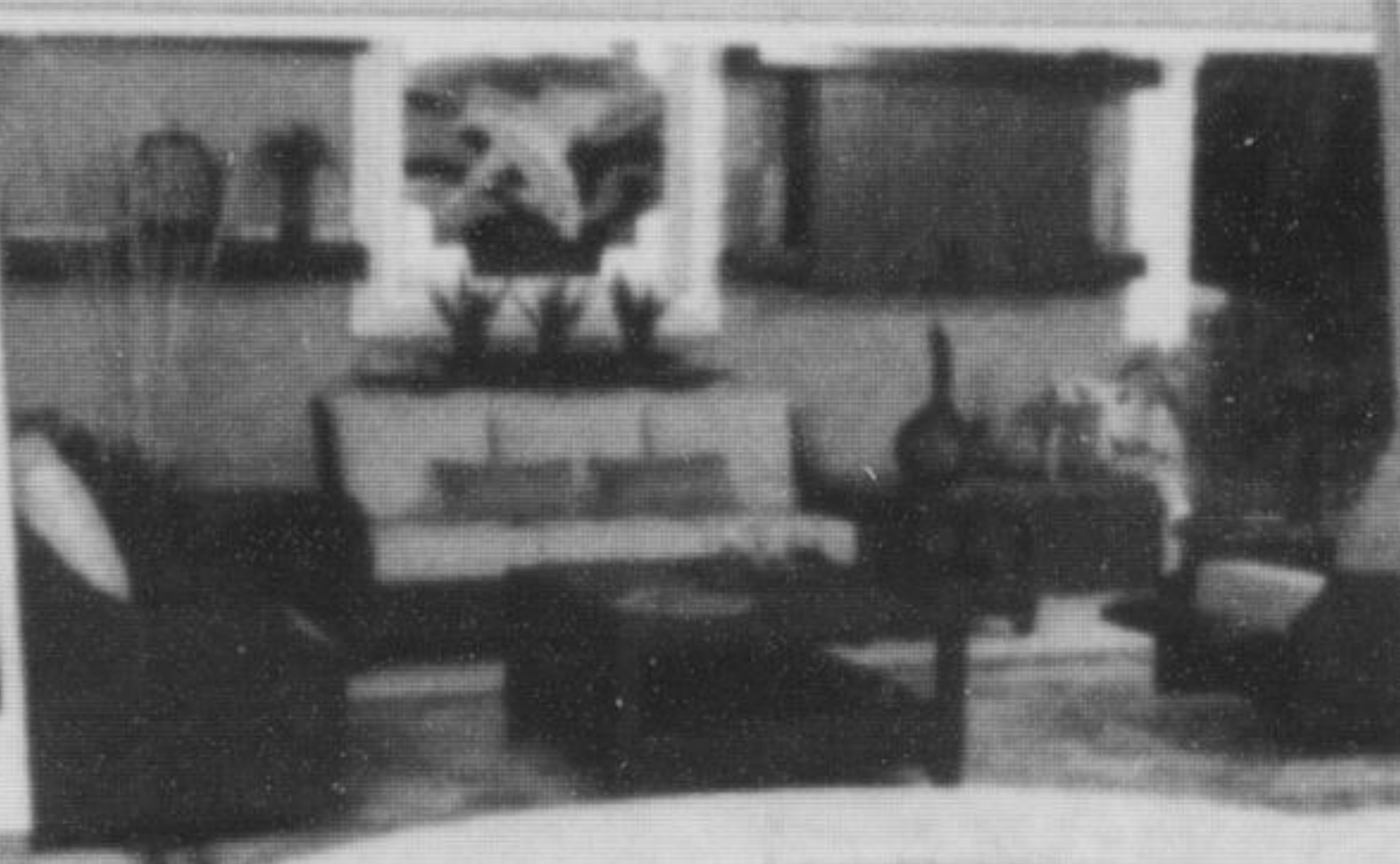
Ebel Veronne Now 50% off MSRP