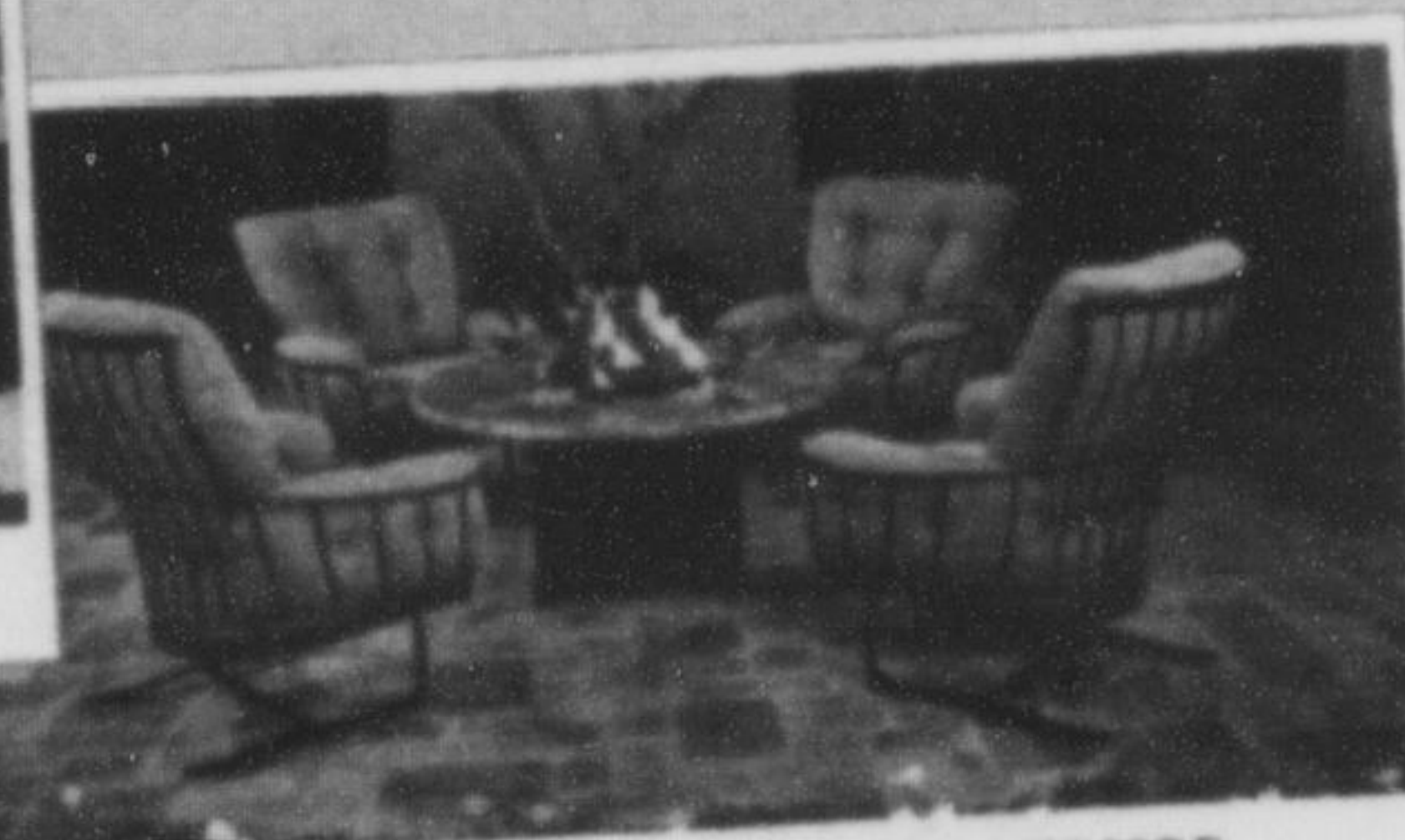
O. W. Lee Montera Now 50% off MSRP

*See in store for 75% off savings offers. †Savings from MSRP