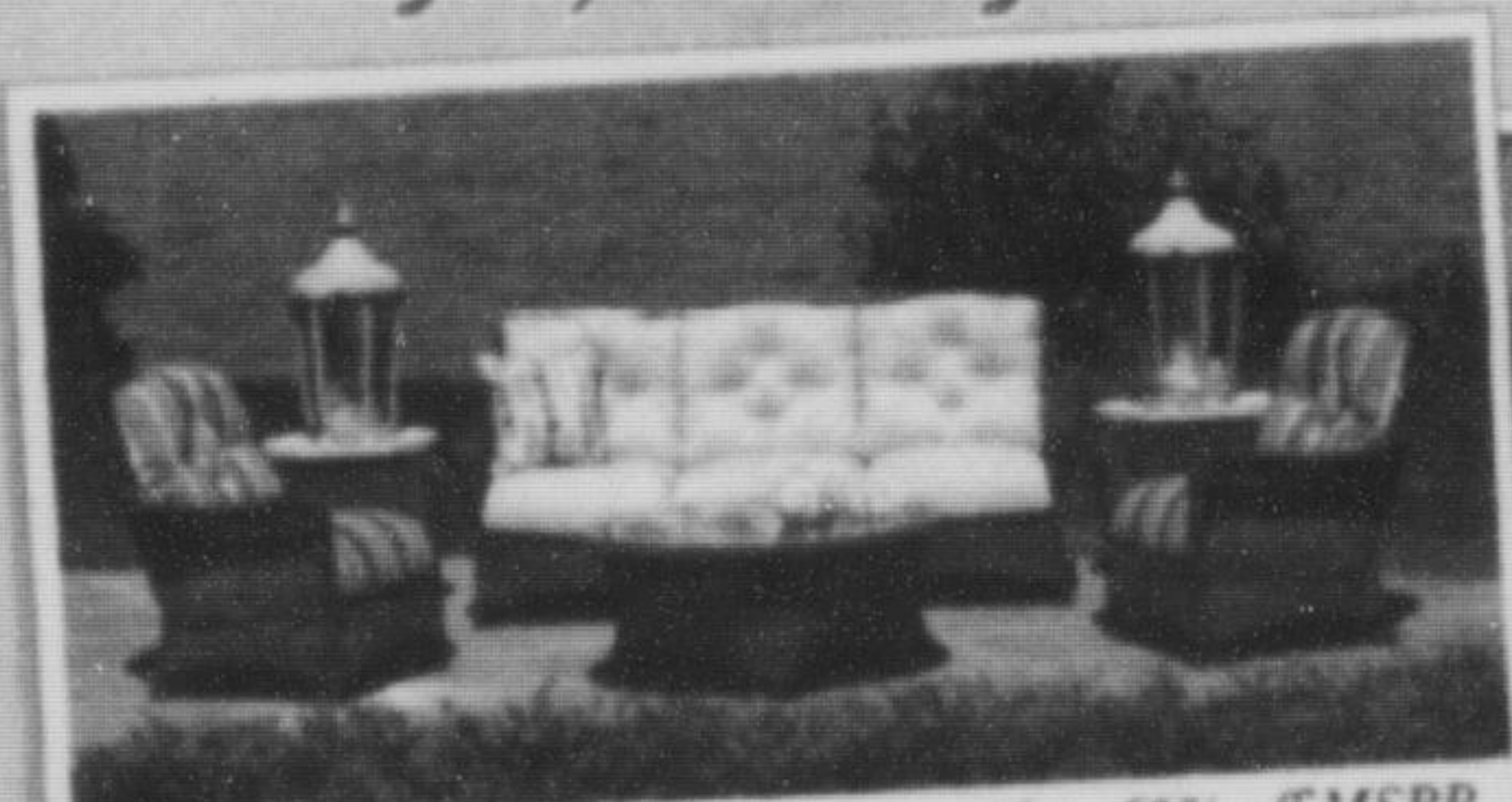
Lloyd Flanders Grand Traverse Now 60% off MSRP