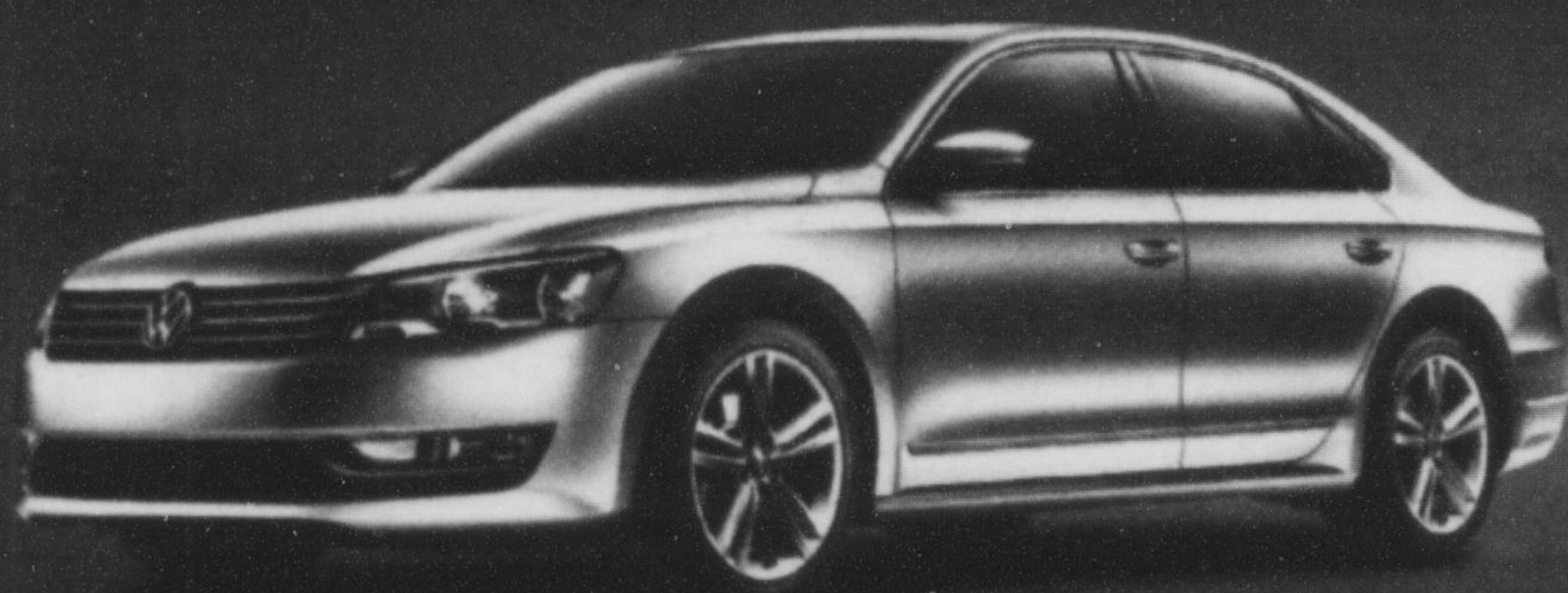
2013 Passat 3.6L

SEE OUR ONLINE EDITION AT www.insidehalton.com