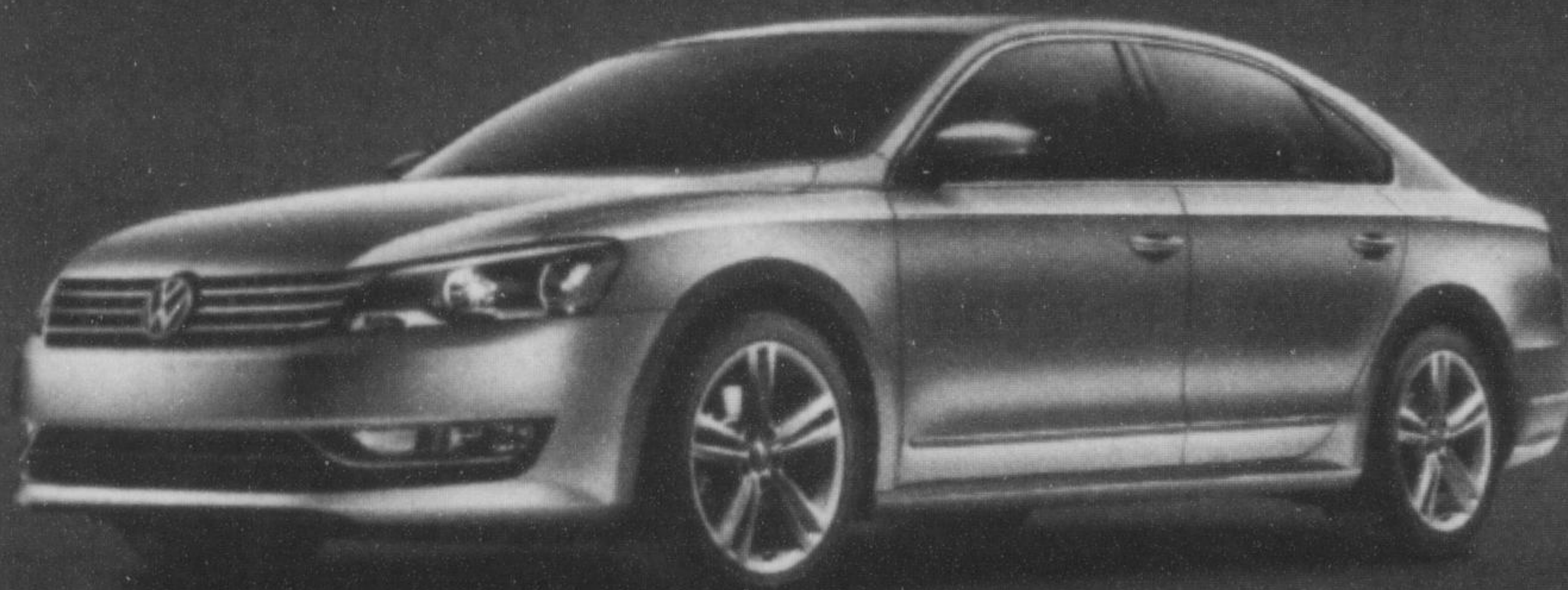
2013 Passat 3.6L

Please contact us, as soon as possible, if you have any accessibility needs at Halton Region events or meetings.