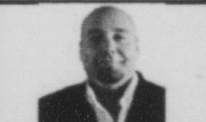
Fabrizio Pacchione* www.fabuloushomes.ca