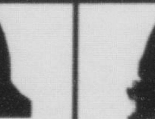
Lynda Luna* www.LyndaLuna.com