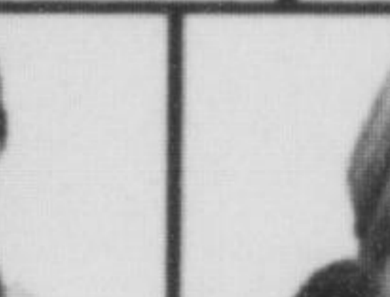
Emilia Taurasi* www.emiliataurasi.com