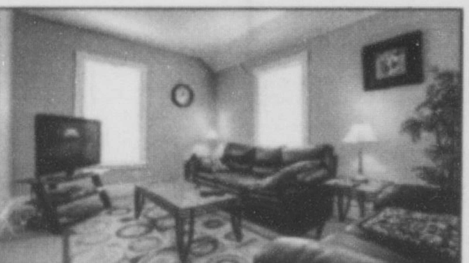
LIVE/WORK IN CAMPBELLVILLE - $575,000

Charming multi use duplex, ideal for live-in work space (retail/office) in the village of Campbellville. Just south of the 401 on Main St. in a high traffic area with an abundance of parking. Currently used as hair salon on the main level with 2nd level 2 bedroom residence/apartment ($1000/mth). Completely updated with newer roof, windows, electrical, plumbing systems. Great location/flexible zoning.