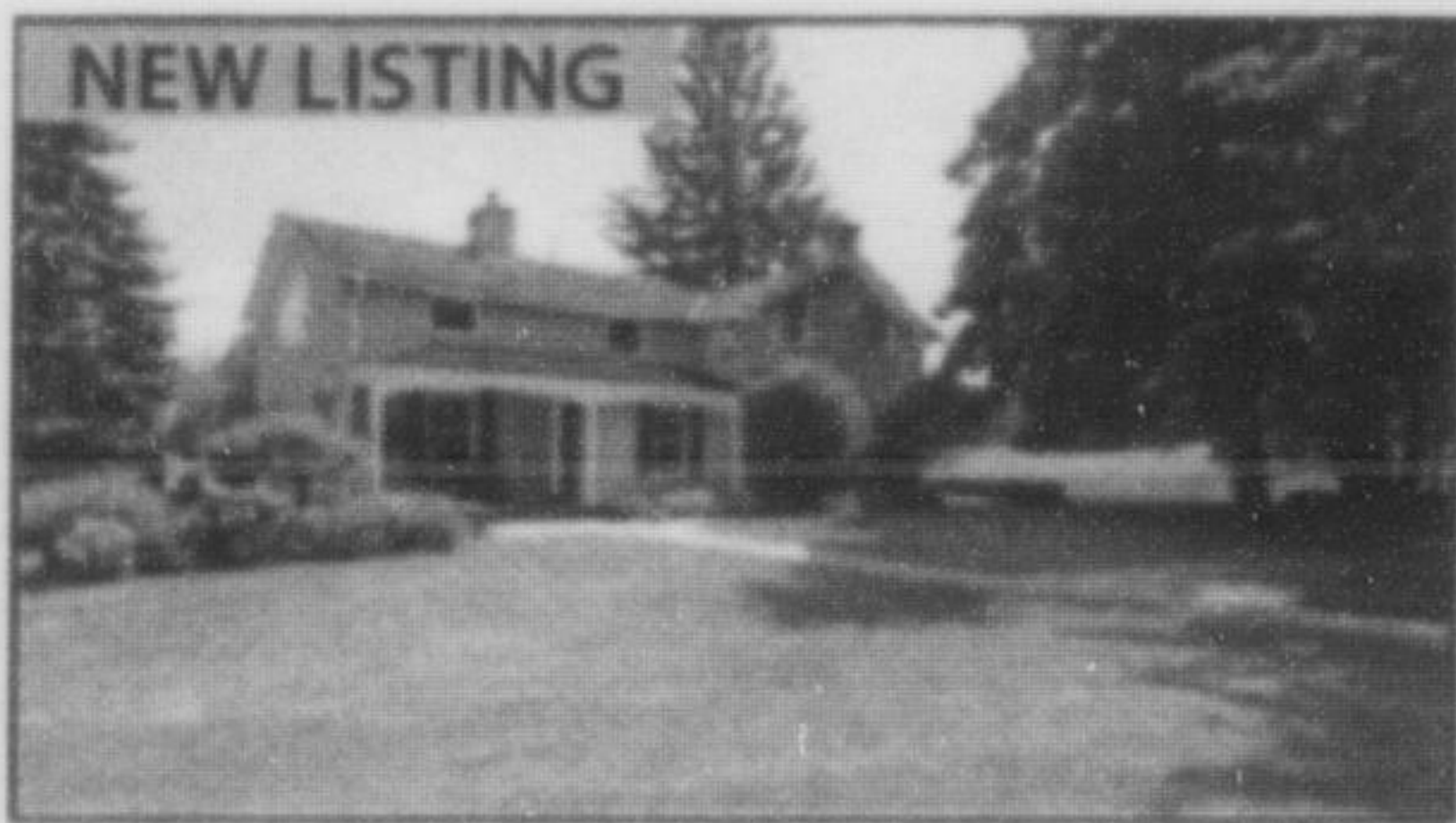
LUXURY LIVING MEETS FINE RESTORATION - $2,299,000

Gorgeous c1850's home rebuilt stone by stone in 2008. Enjoy yesterday's charm with all of today's conveniences. Over 4700 sq ft of living space. Large principal rooms, custom kitchen with high end appliances, geothermal heating/cooling system, hardwood floors, two fireplaces. Master bedroom with ensuite plus private terrace overlooking 97 scenic acres. Just north of the 401 near Campbellville.