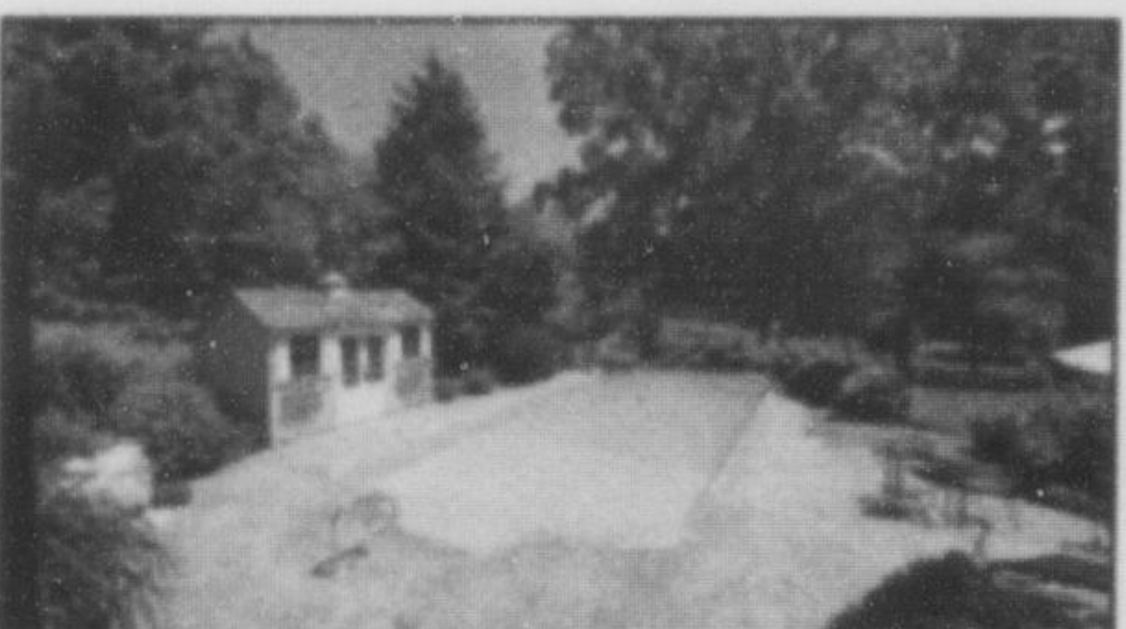
NEW LISTING 95 ACRE ESTATE - $1,899,000

Breathtaking 95 acre private estate. Beautifully restored 1840's stone main house replete w/ hand hewn beams & large lofted principal rms. Long, private driveway winds through an arch of trees & landscaped rolling grounds. Pool, tennis court & horse jumping pit/track. Second house for groundskeeper w/2 bedrooms, kitchen, bath.