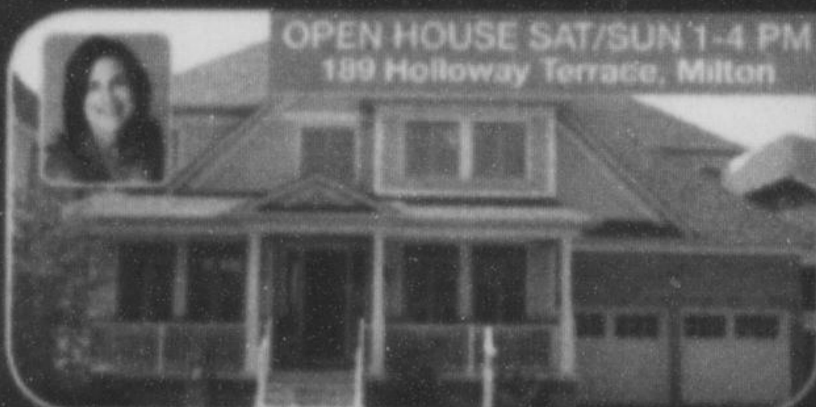
OPEN HOUSE SAT/SUN 1-4 PM 189 Holloway Terrace, Milton

905-337-7001 www.RealtyExecutives1st.com