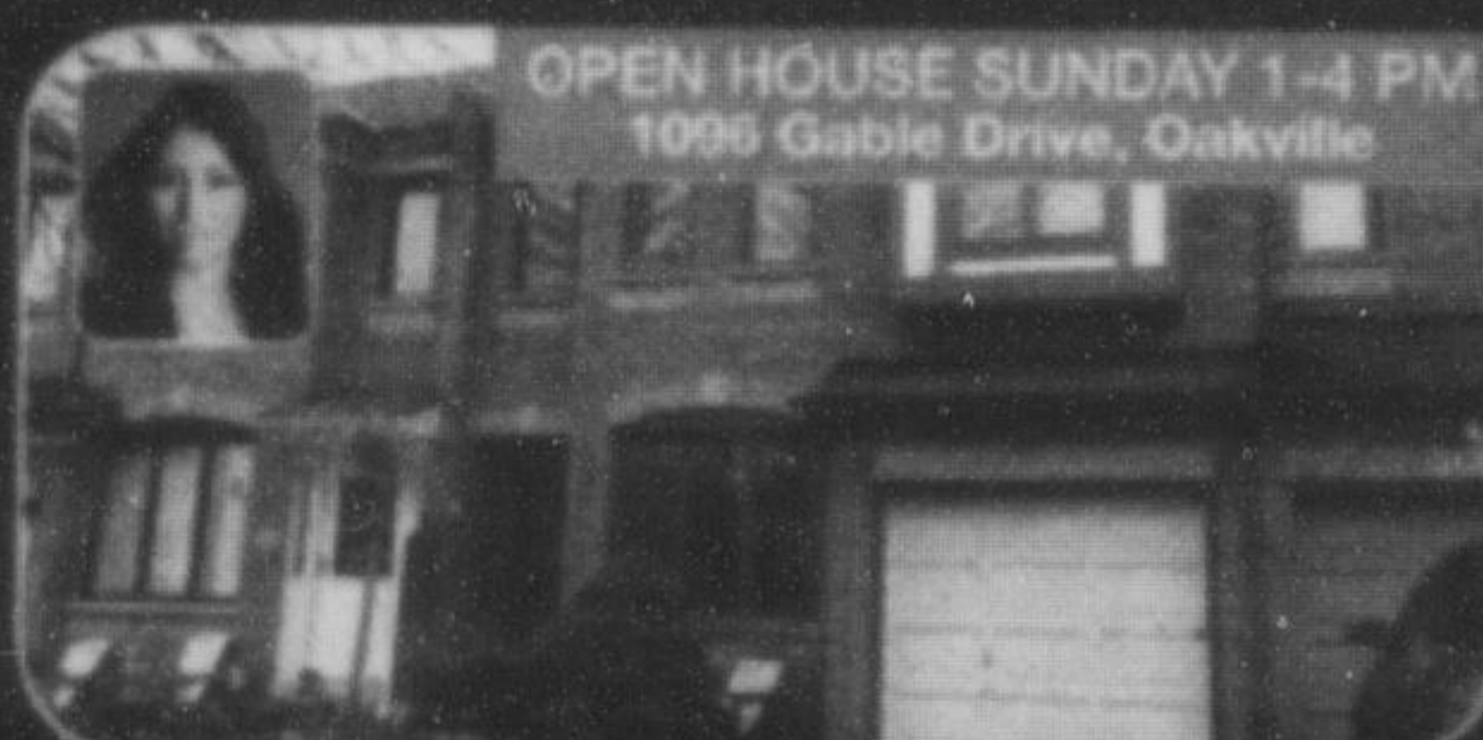
OPEN HOUSE SUNDAY 1-4 PM 1096 Gable Drive, Oakville