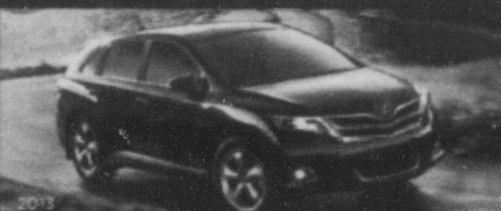
2013 VENZA FWD Also available in 4WD.

TAKE ADVANTAGE OF 0% LEASE FOR UP TO 60 MONTHS ON SELECT 2013 COROLLA AND 2013 MATRIX**