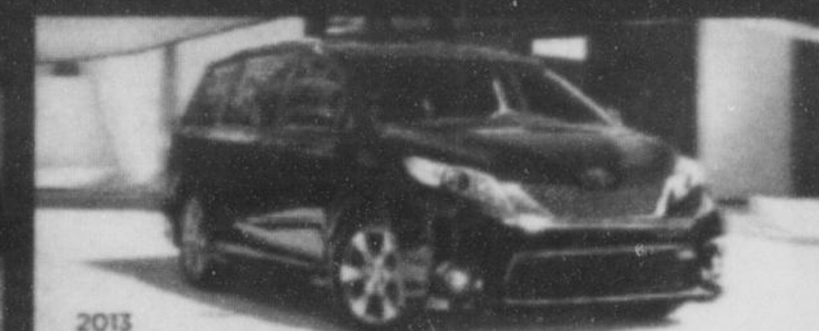
2013 SIENNA 7-PASSENGER V6 Sienna SE model shown. All-in price $39,029**

ALL-IN PRICE $30,964* Includes freight and fees. HST extra.