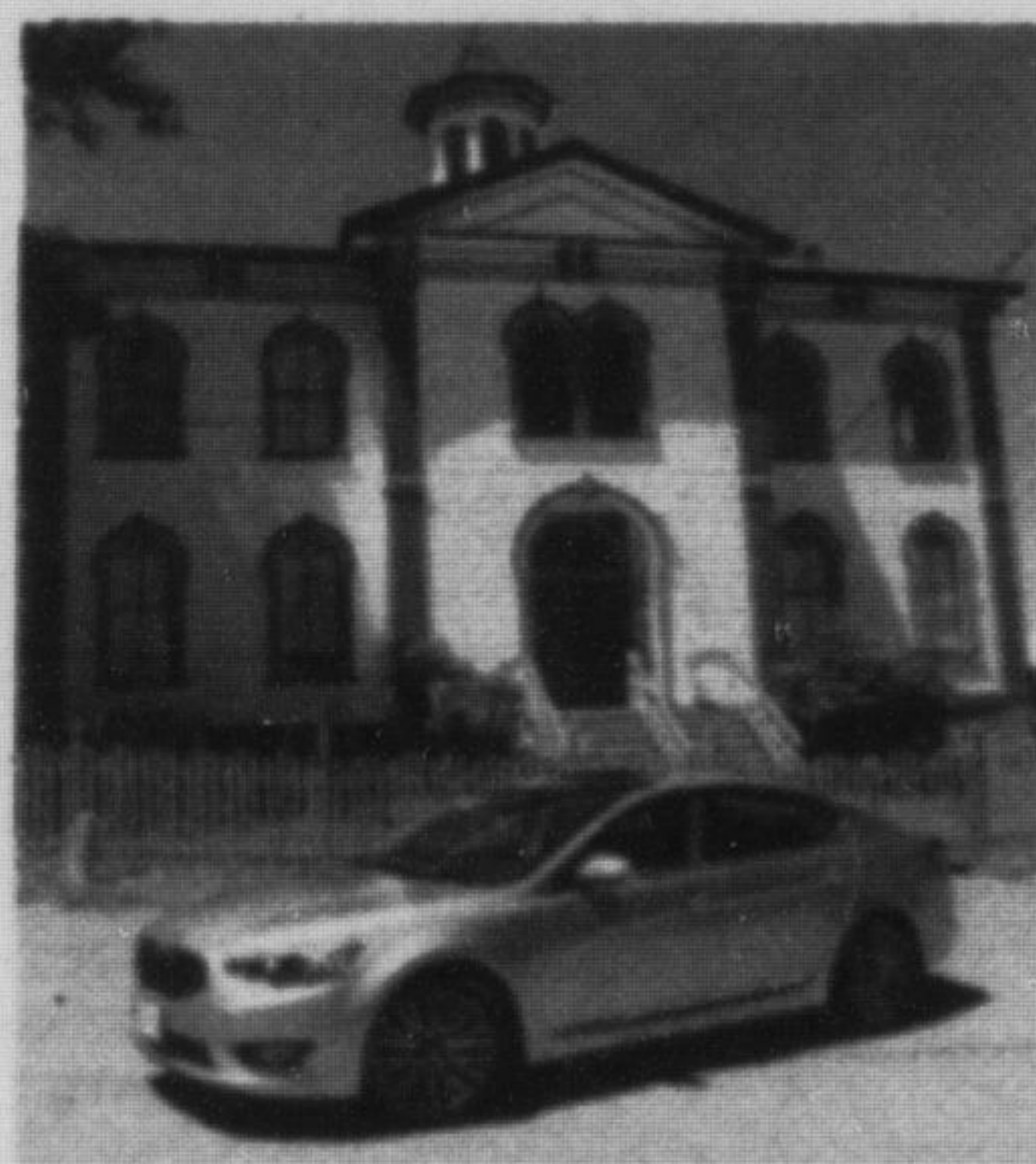
Striking a pose in front of the house that was the setting for Alfred Hitchcock's landmark thriller, The Birds , the 2014 Cadenza is Kia's first foray into the full-size near luxury sedan market.