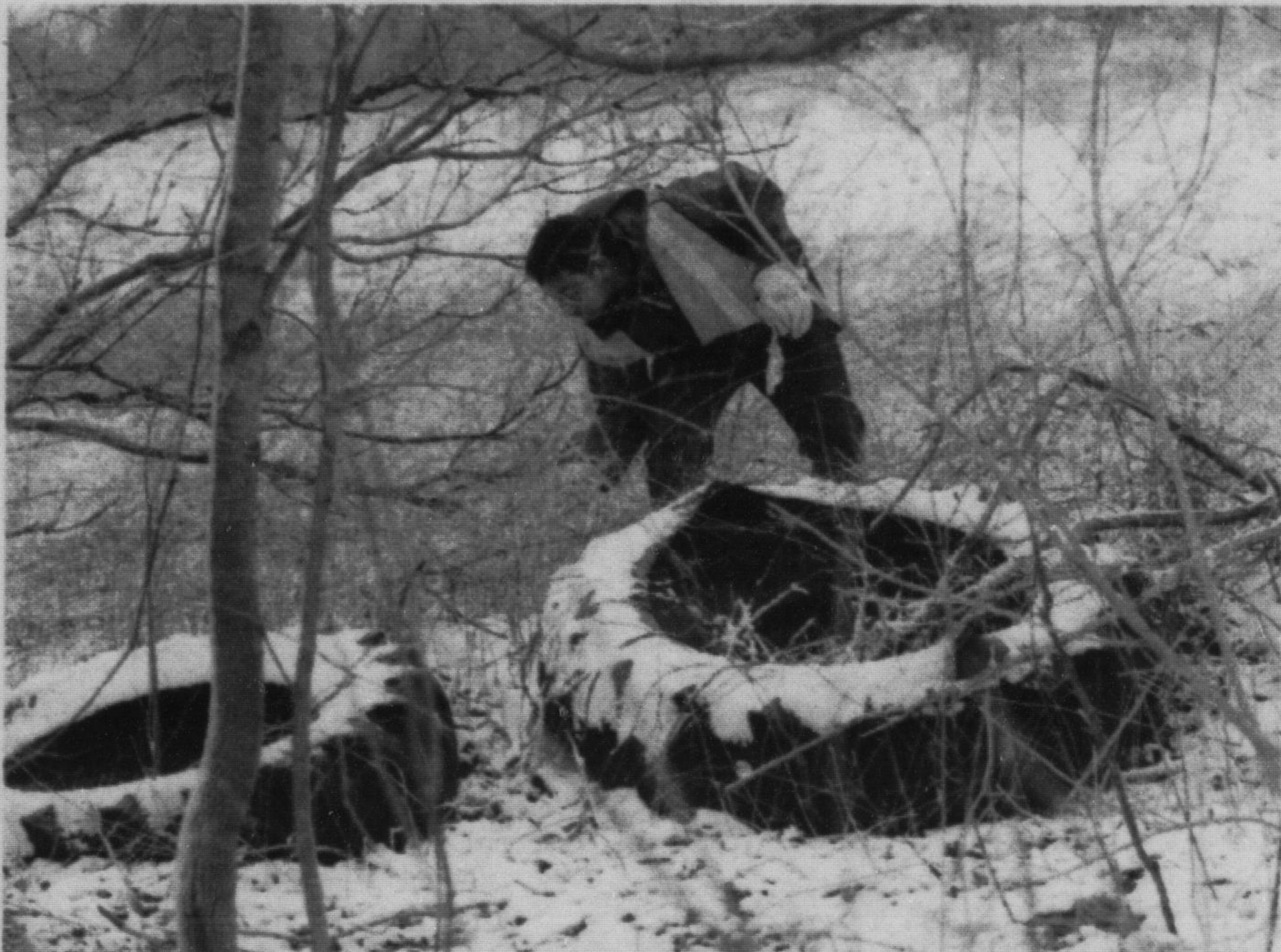
Sarim Nadeem was one of many volunteers who came out to clean up the rural area last month. Spring clean ups are becoming more and more important, as rural dumping continues to increase.