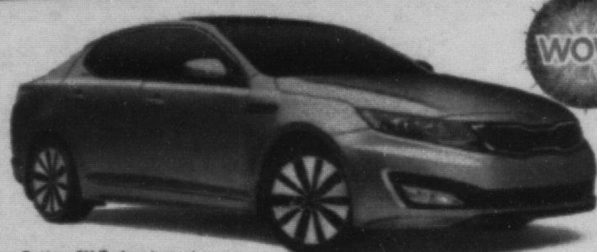
Optima SX Turbo shown*

6 FREE OIL CHANGES ON ANY BRAND NEW KIA PURCHASE