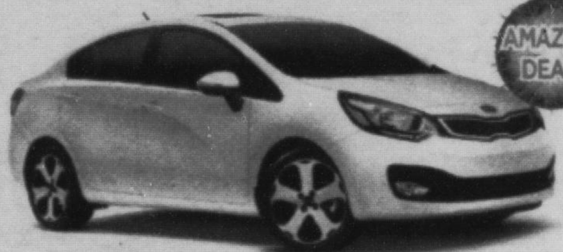
Rio4 SX with Navigation shown*

Offer includes delivery, destination, fees, $4,000 CASH SAVINGS* and $500 CLEAROUT BONUS* . Offer based on 2013 Optima LX MT with a purchase price of $23,983.