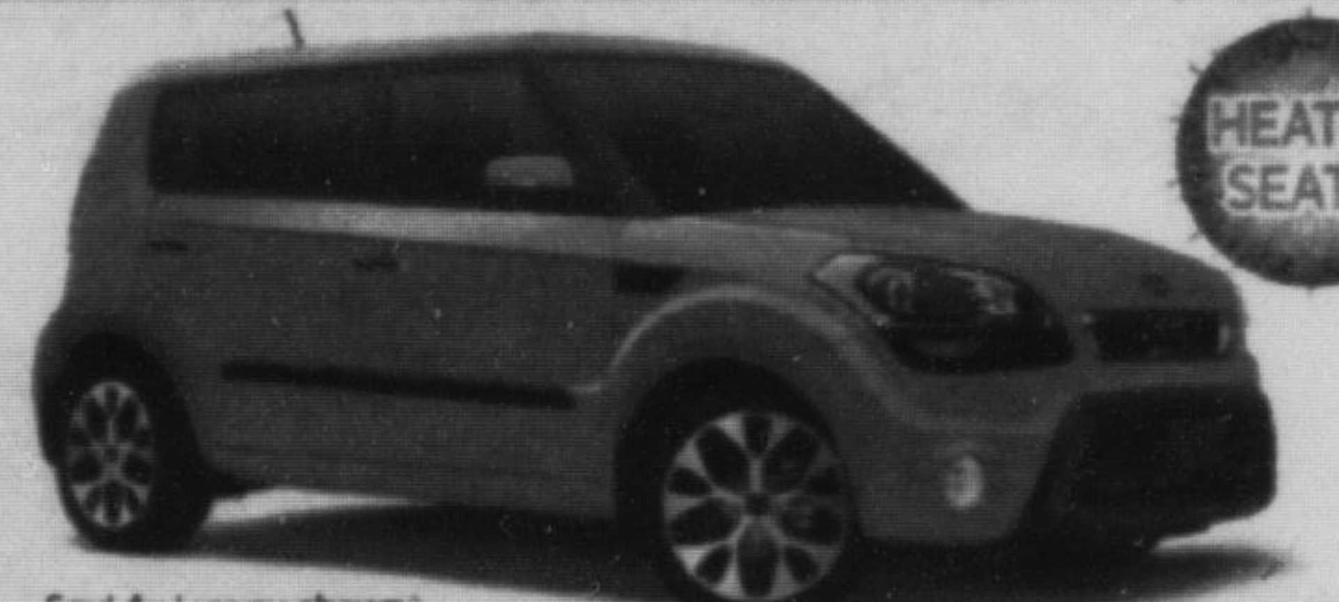
Soul 4u Luxury shown*

bi-weekly for 60 months, amortized over 84 months with $0 DOWN PAYMENT . Offer includes delivery, destination, fees, $900 *6 BI-WEEKLY PAYMENTS ON USE* SAVINGS* and $500 CLEAROUT BONUS* . Offer based on 2013 Rio 4-door LX MT with a purchase price of $15,783.