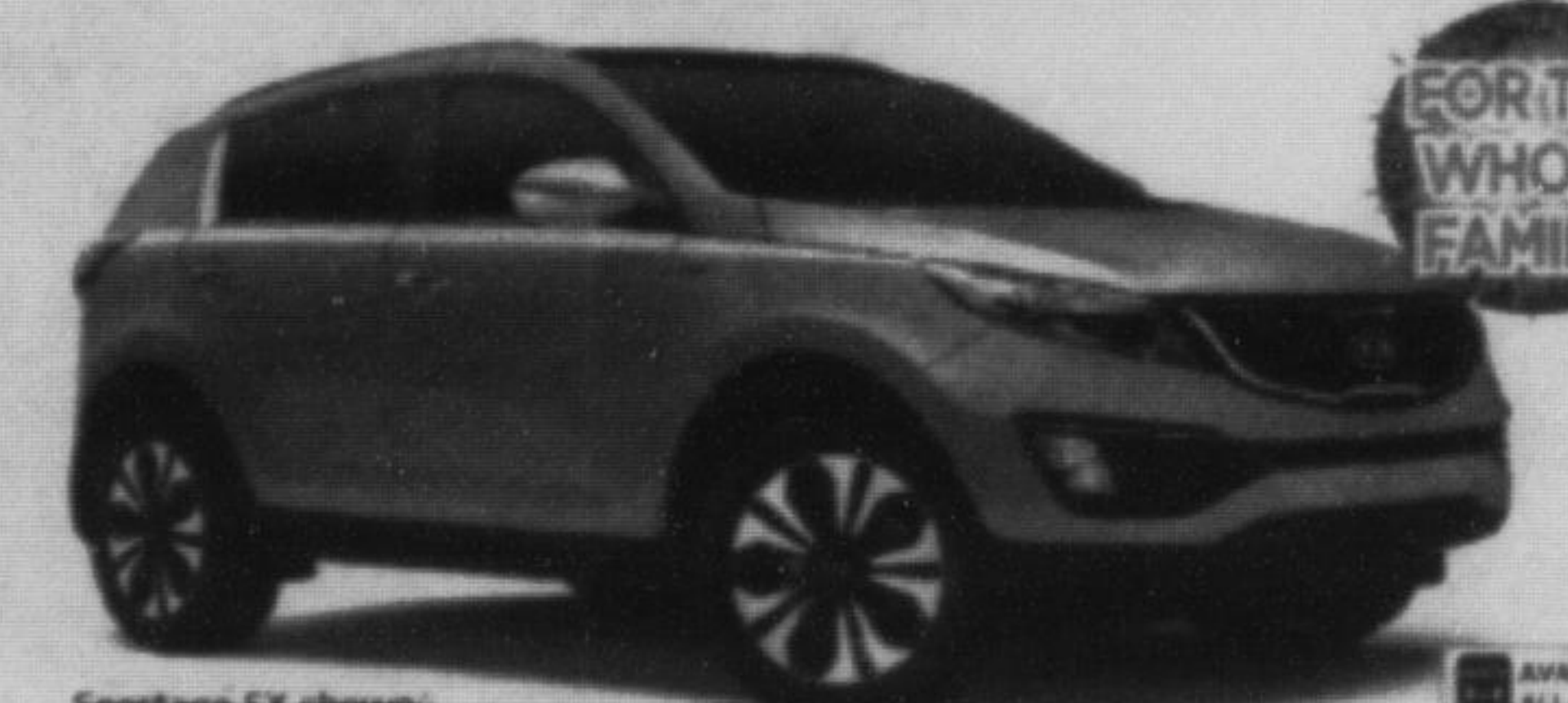
Sportage SX shown*

Offer includes delivery, destination, fees, $1,500 CASH SAVINGS* and $500 CLEAROUT BONUS* . Offer based on 2013 Soul 1.6L MT with a purchase price of $18,878.