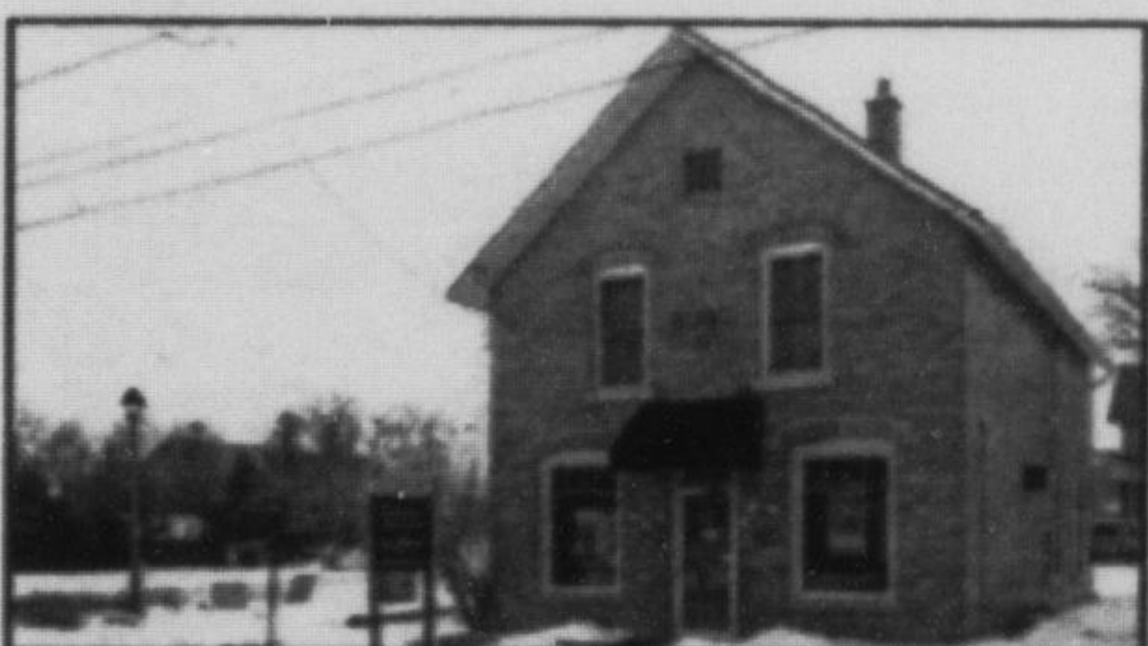
LIVE/WORK IN CAMPBELLVILLE - $575,000

Charming multi use duplex, ideal for live-in work space (retail/office) in the village of Campbellville. Just south of the 401 on Main St. in a high traffic area with an abundance of parking. Currently used as hair salon on the main level with 2nd level 2 bedroom residence/apartment ($1000/mth). Completely updated with newer roof, windows, electrical, plumbing systems. Great location/flexible zoning.