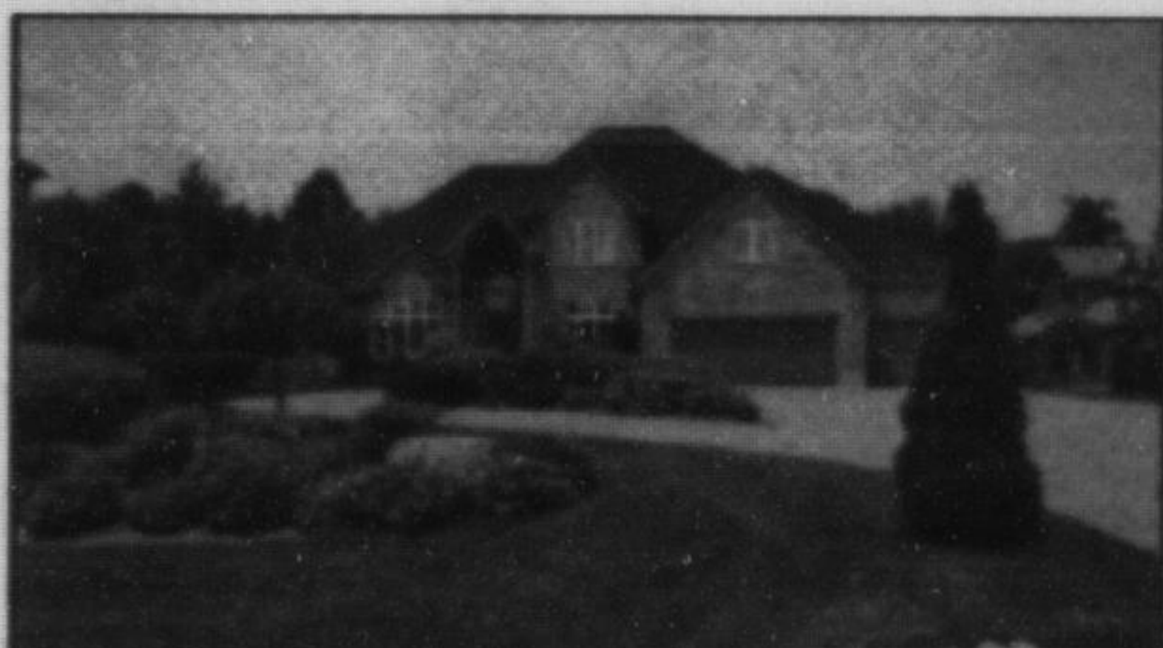
MORRISTON - $979,000

LUXURIOUS MAIN LEVEL MASTER! - $1,149,000 Impeccably maintained 1.5 acre property in Churchill Estates. 4 bedroom bungalow with rare main floor master & luxurious ensuite. 3,662 sq. ft. above grade, dark Oak hardwood throughout, custom kitchen with pantry, center island & breakfast area, main floor den. Bright & spacious with many windows. Three access points to covered porch. Beautiful 27'x 60' patio with pergola & irrigation system.