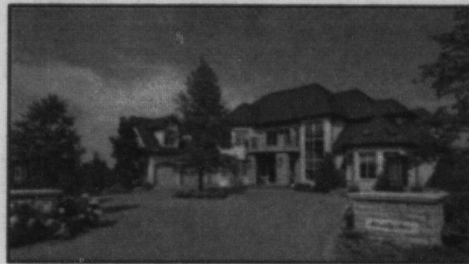
CUSTOM BUILT LUXURY HOME - $5,995,000

905-845-9180 - 1-888-462-4851 - GoodaleMillerTeam.com