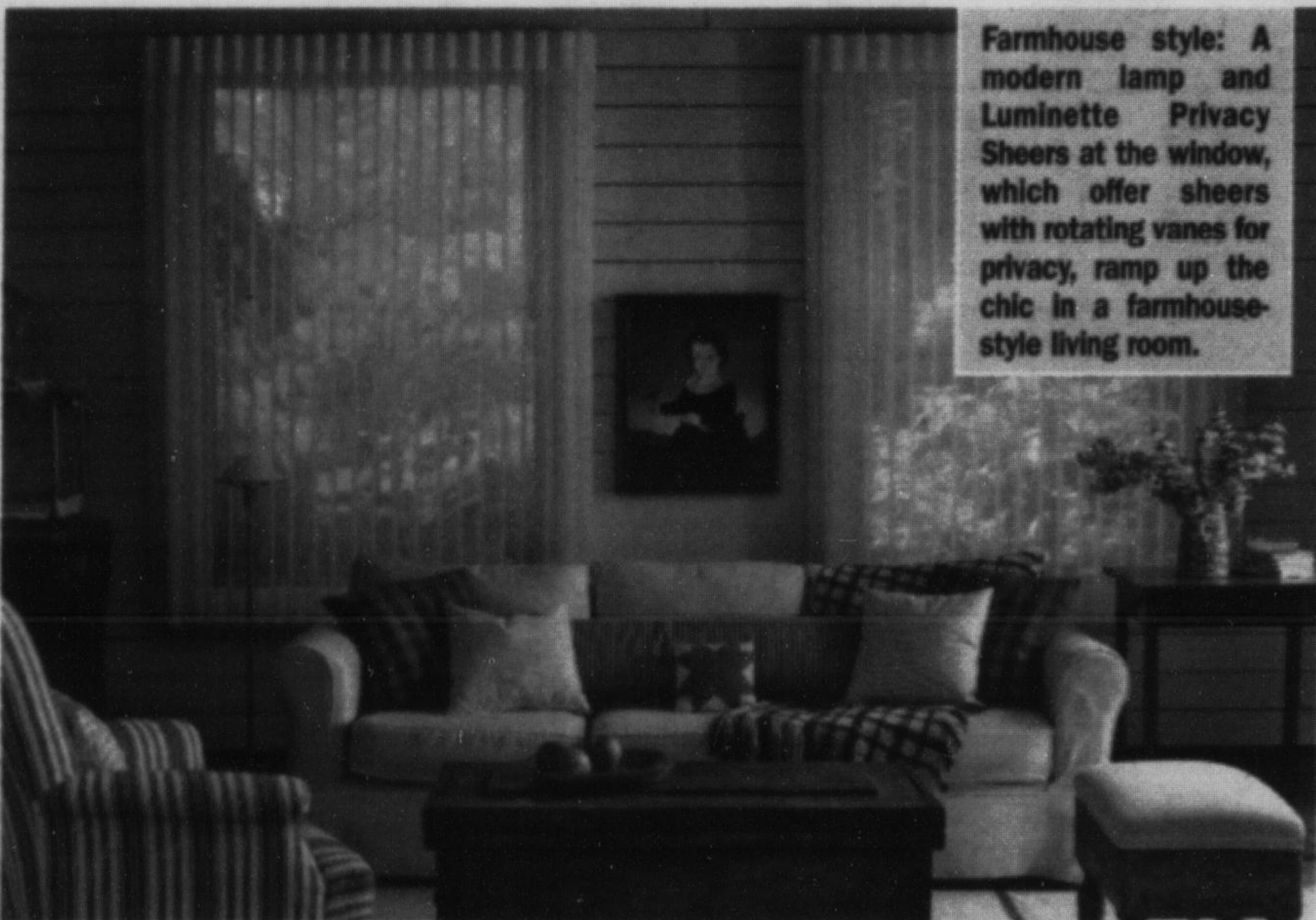
Farmhouse style: A modern lamp and Luminette Privacy Sheers at the window, which offer sheers with rotating vanes for privacy, ramp up the chic in a farmhouse-style living room.