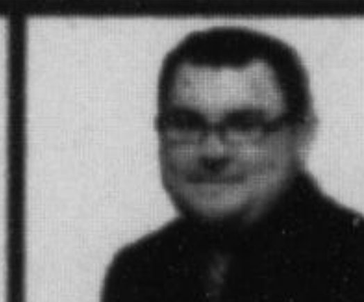
James Wroe www.jameswroe.com

VIEW ALL OUR LISTINGS AT WWW.CENTURY21MILTON.CA