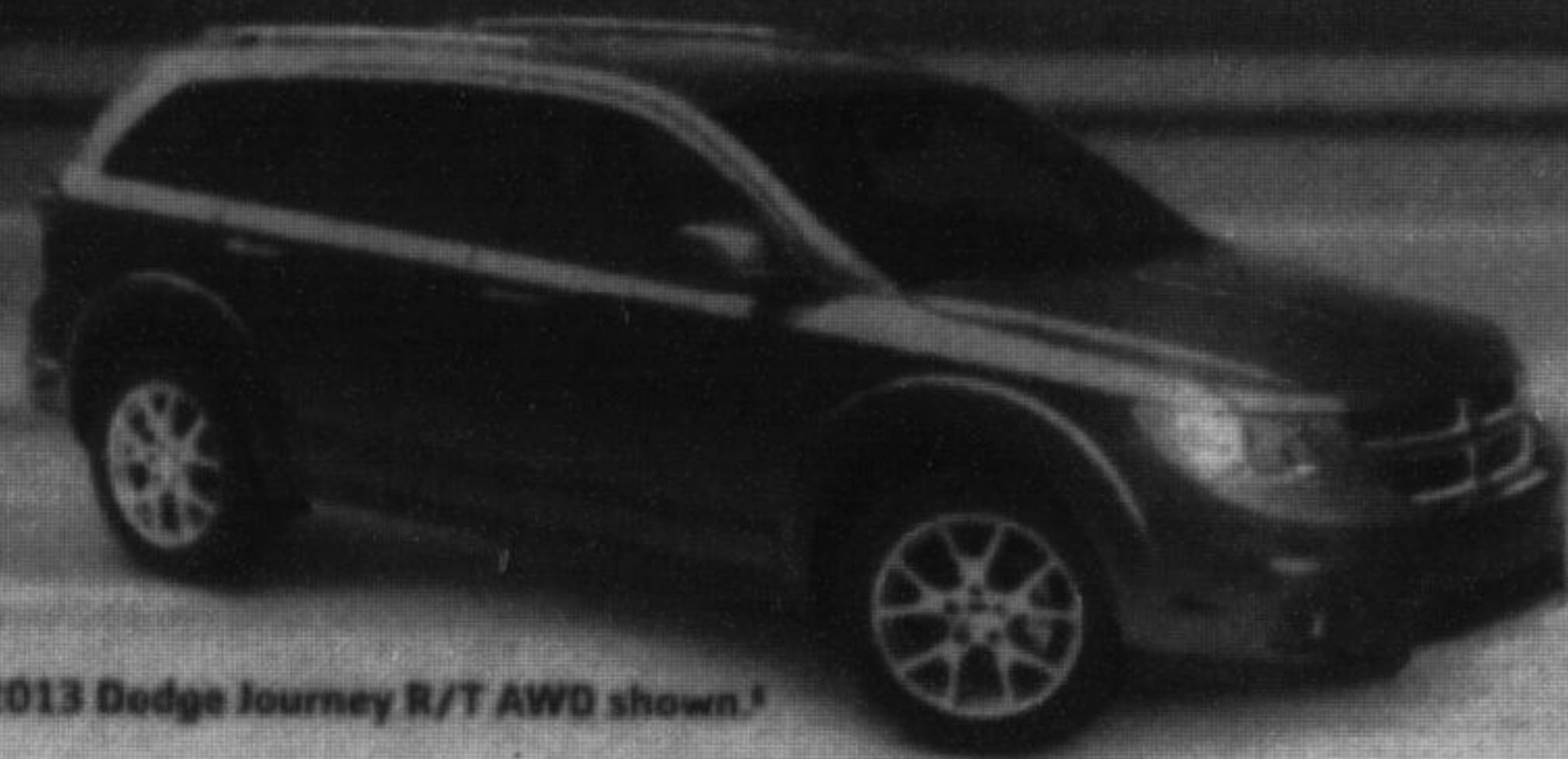
2013 Dodge Journey R/T AWD shown.*