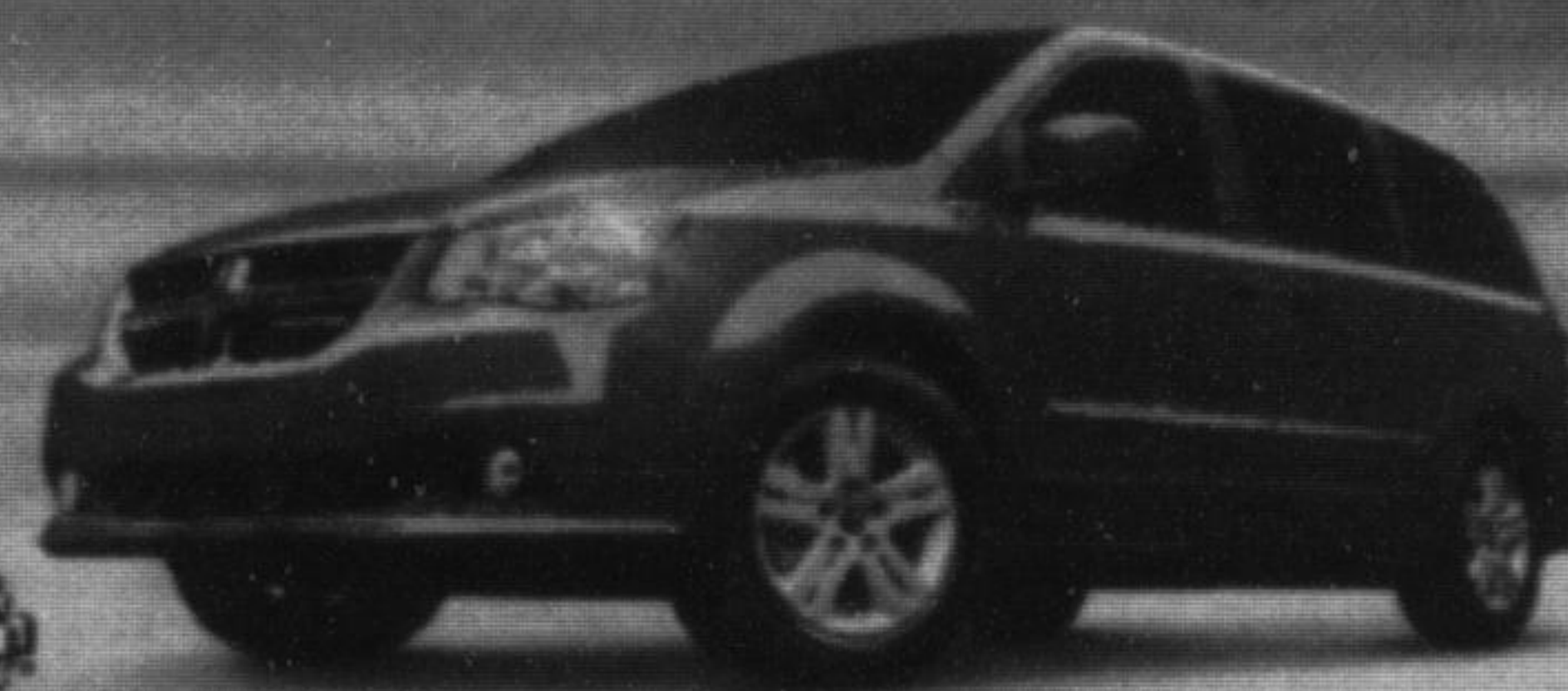
2013 Dodge Grand Caravan Crew Plus shown.*