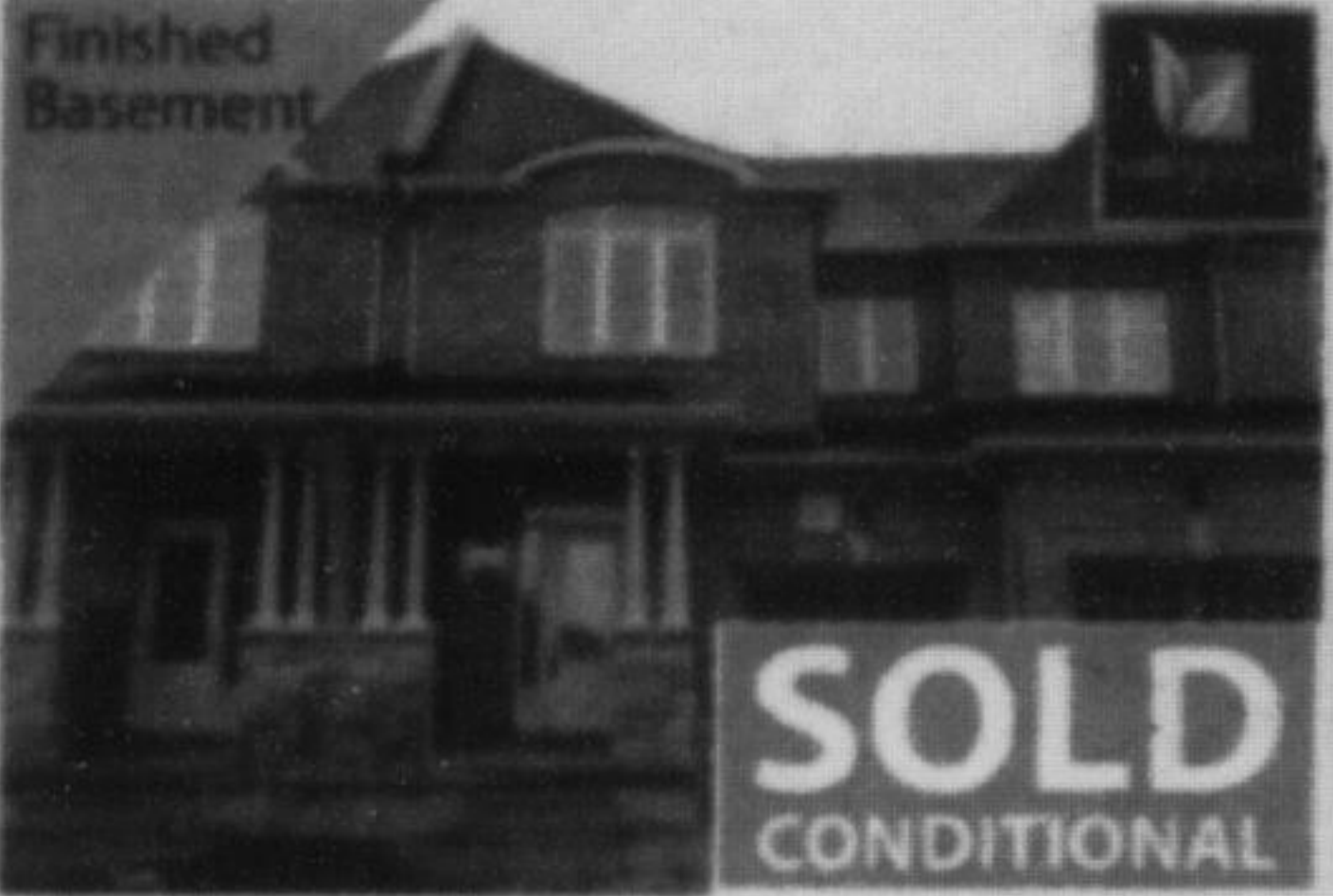
Finished Basement SOLD CONDITIONAL 702 Asleton Blvd $399,900 3 Bdrms • 3 Washrooms • Daisy