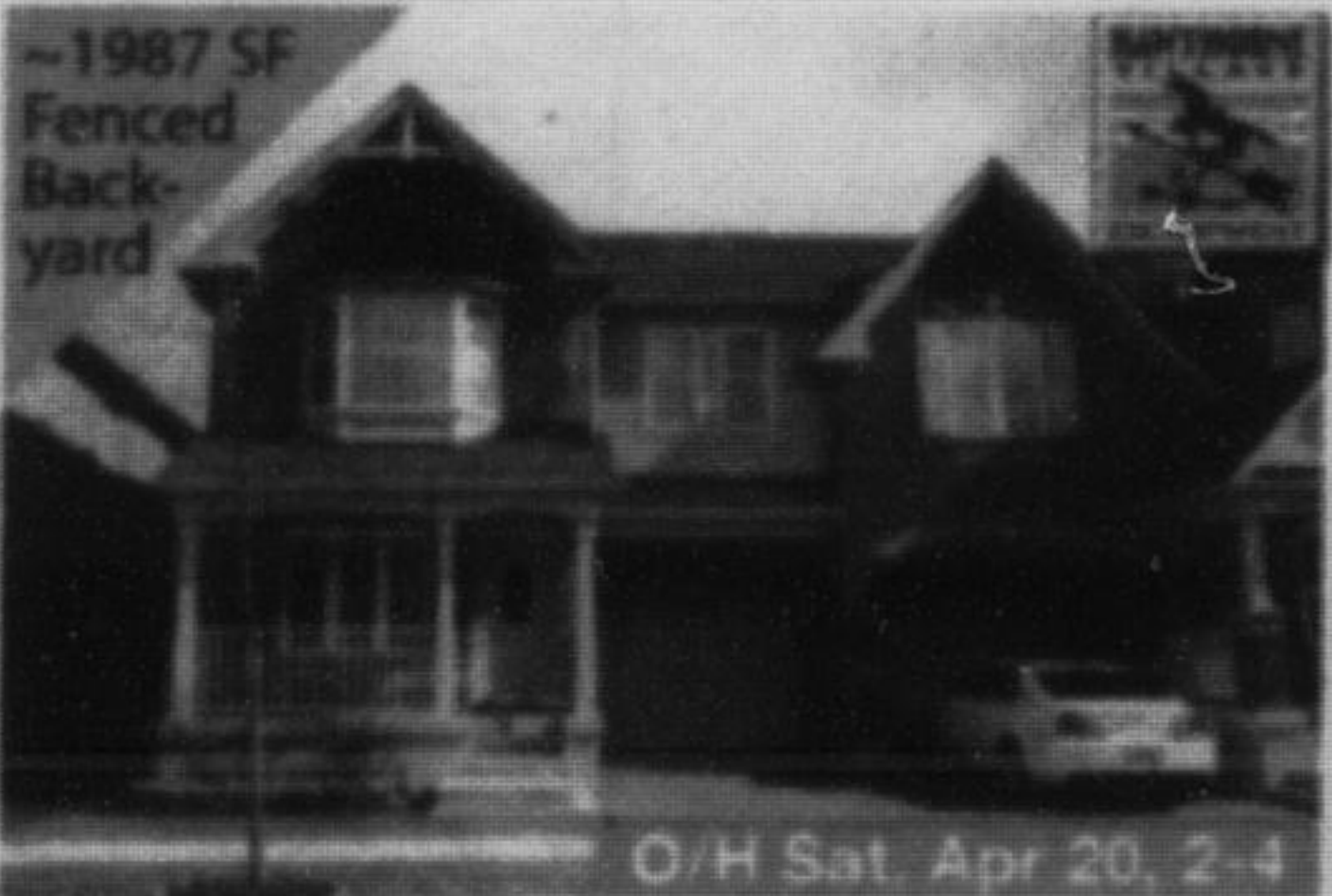
~1987 SF Fenced Backyard O/H Sat, Apr 20, 2-4 174 Mcdougall St $439,500 4 Bdrms • 3 Washrooms • Southbury