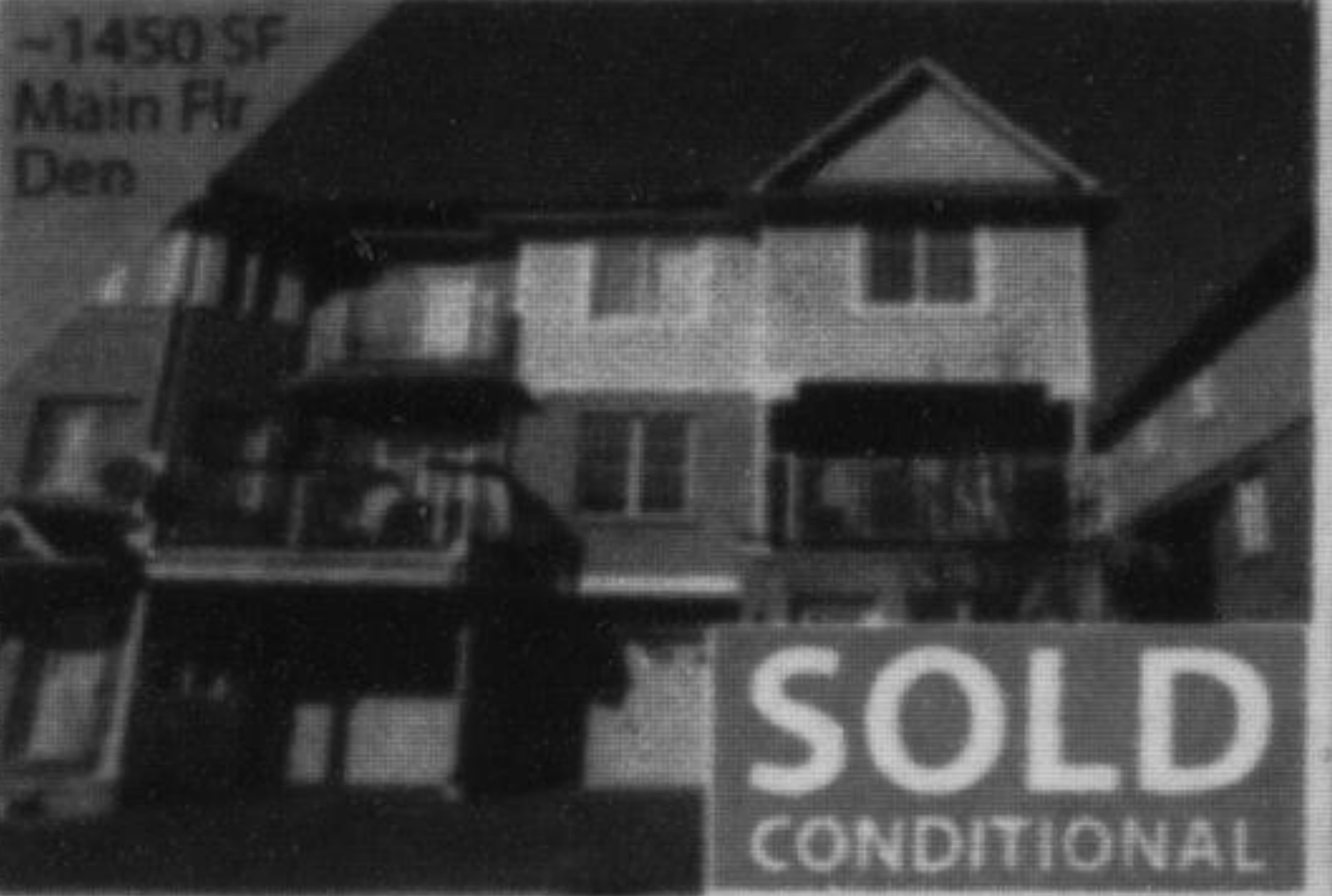
~1450 SF Main Flr Den SOLD CONDITIONAL 620 Ferguson Dr 113 $329,900 3+1 Bdrms • 2 Washrms • Wildflower