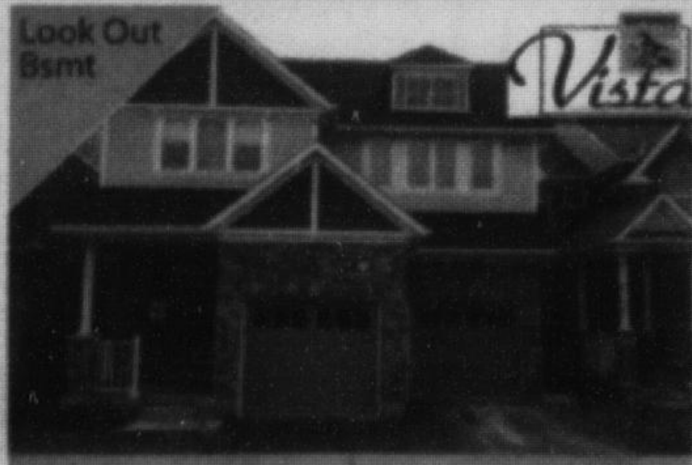
Look Out Bsmt 318 Pringle Ave $559,900 4 Bdrms • 3.5 Washrms • Wood Lilly