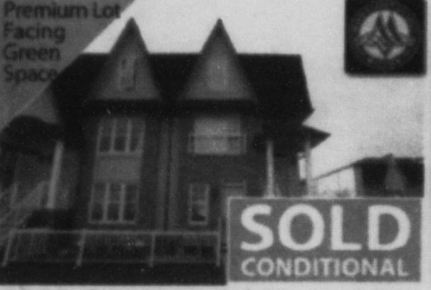
Premium Lot Facing Green Space SOLD CONDITIONAL 1380 Costigan Rd 89 $289,900 3 Bdrms • 2 W/rms • Viva Townhome