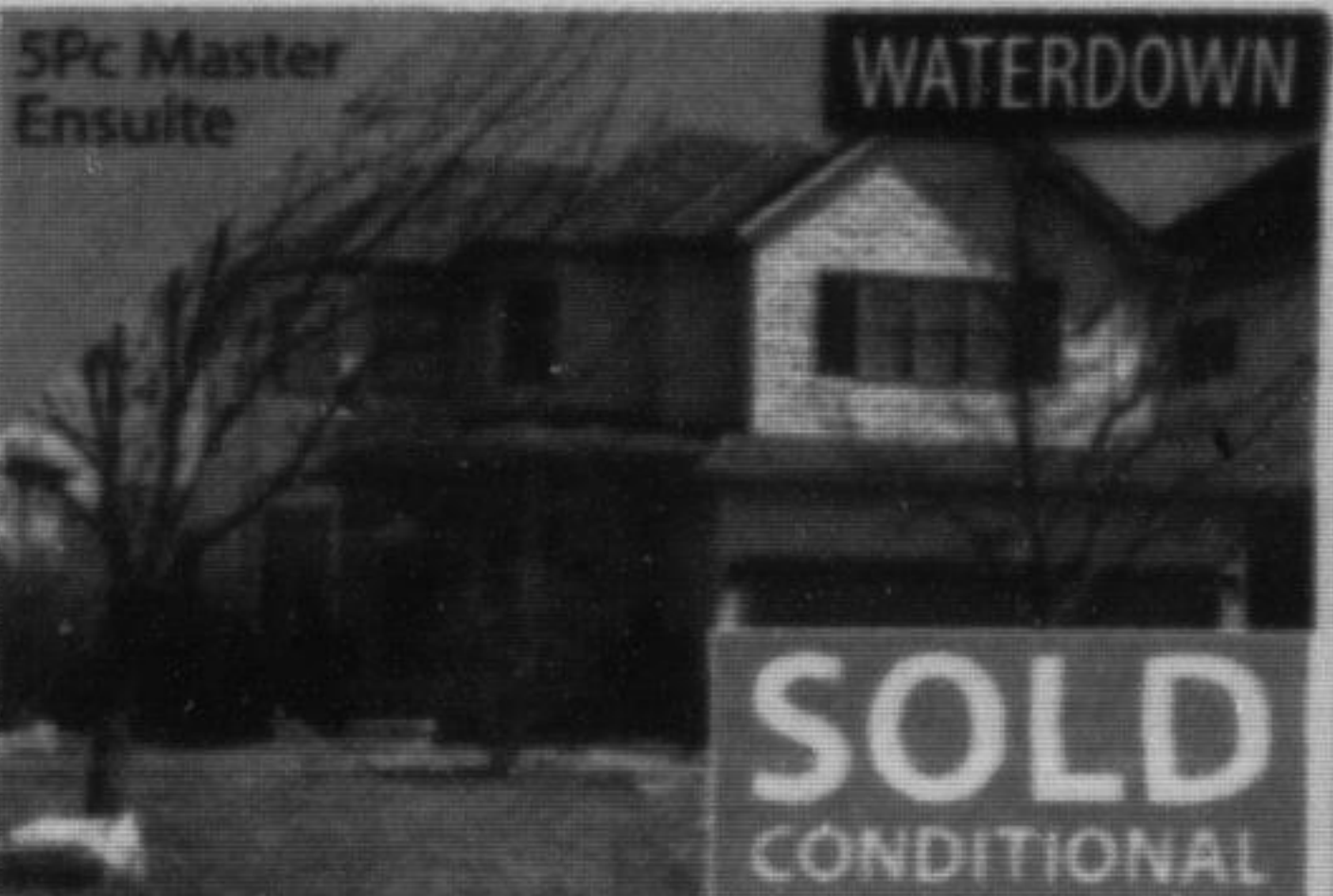
5Pc Master Ensuite SOLD CONDITIONAL 142 Riley St $519,900 Finished Basement W/4th Bedroom