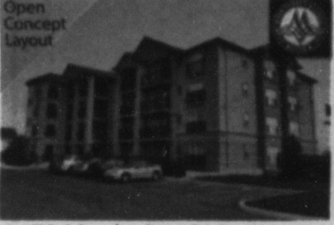
Open Concept Layout 1479 Maple Av #212 $299,900 2 Bdrms • 2 Washroom • Windsor