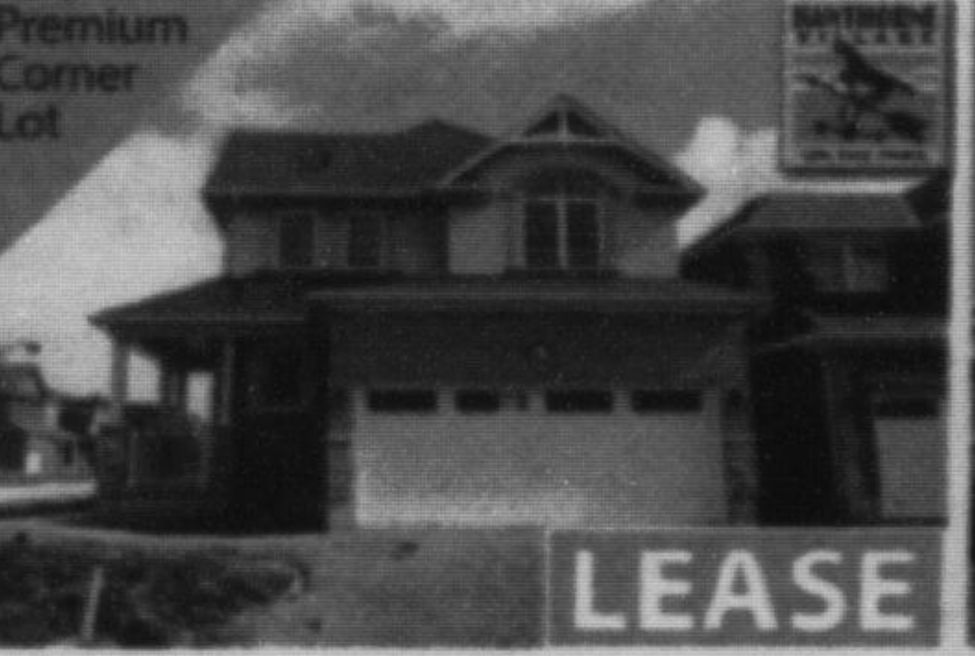
Premium Corner Lot LEASE 414 Leiterman Dr $1,699/mo 4 Bdrms • 3 Washrooms • Mattamy