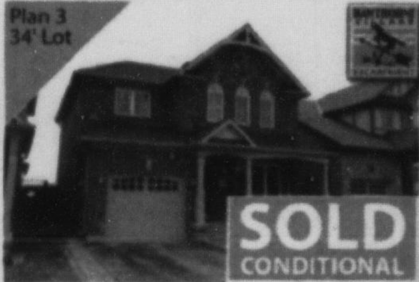
Plan 3 34' Lot SOLD CONDITIONAL 342 Schreyer Cres $468,400 3 Bdrms • 4 Washrooms • Fin. Bsmt