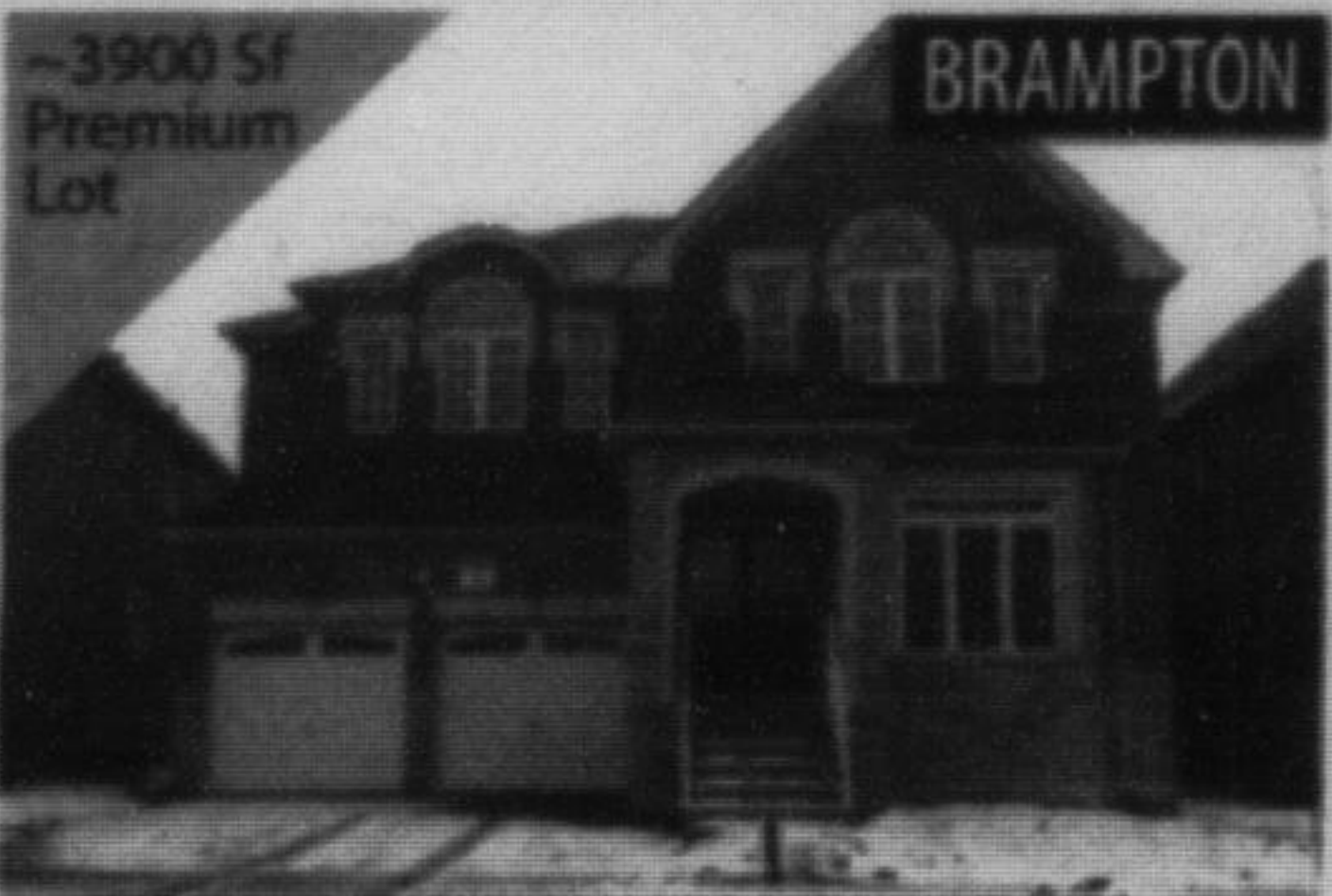
~3900 SF Premium Lot 4 Plentywood Dr $859,900 4+1 Bdrms • 5 Washrms • Orchid