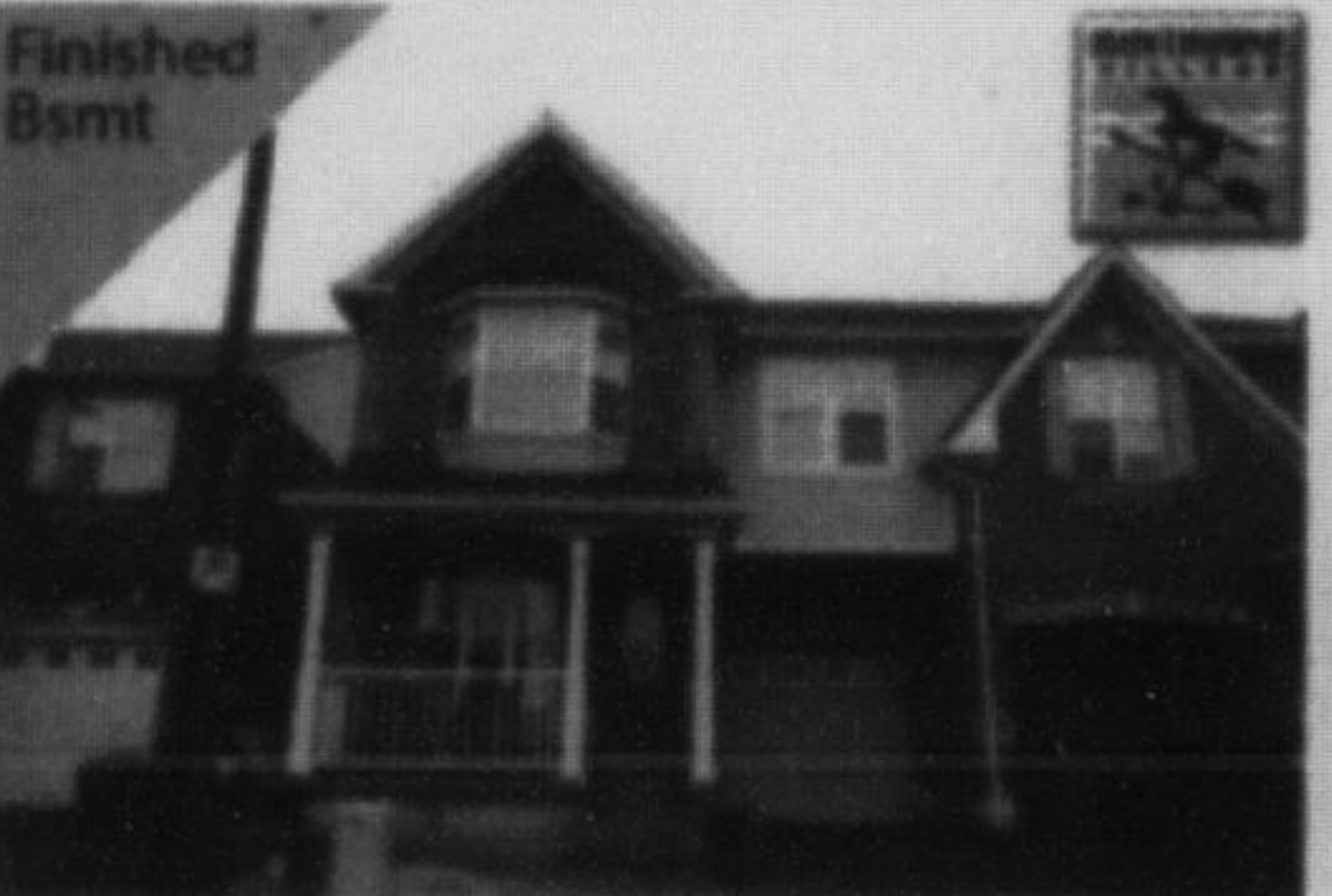
Finished Bsmt 702 Thompson Rd S $445,000 4+1 Bdrms • 4 Washrms • Southbury