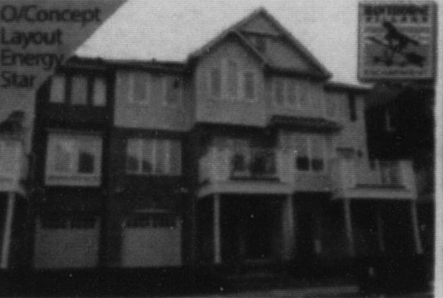
O/Concept Layout Energy Star 881 Willingdon Cres $329,900 2 Bdrms • 2 Washrooms • Currant