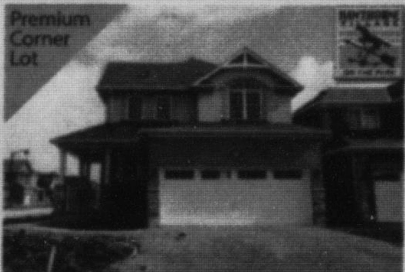
Premium Corner Lot 414 Leiterman Dr $519,900 4 Bdrms • 3 Washrooms • Mattamy