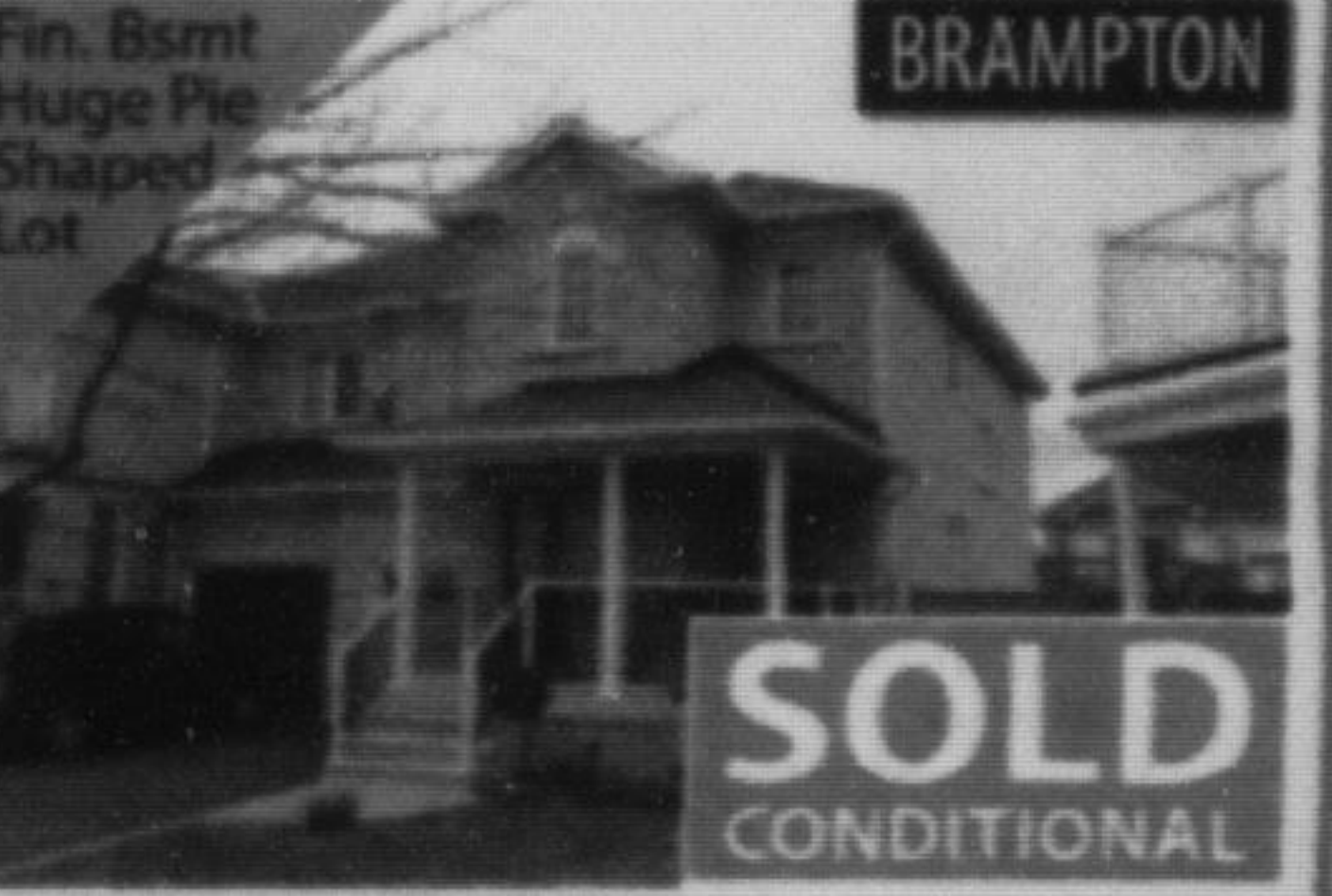
Fin. Bsmt Huge Pie Shaped Lot SOLD CONDITIONAL 58 Viceroy Cres $369,900 3 Bdrms • 4 Washrooms • Detached