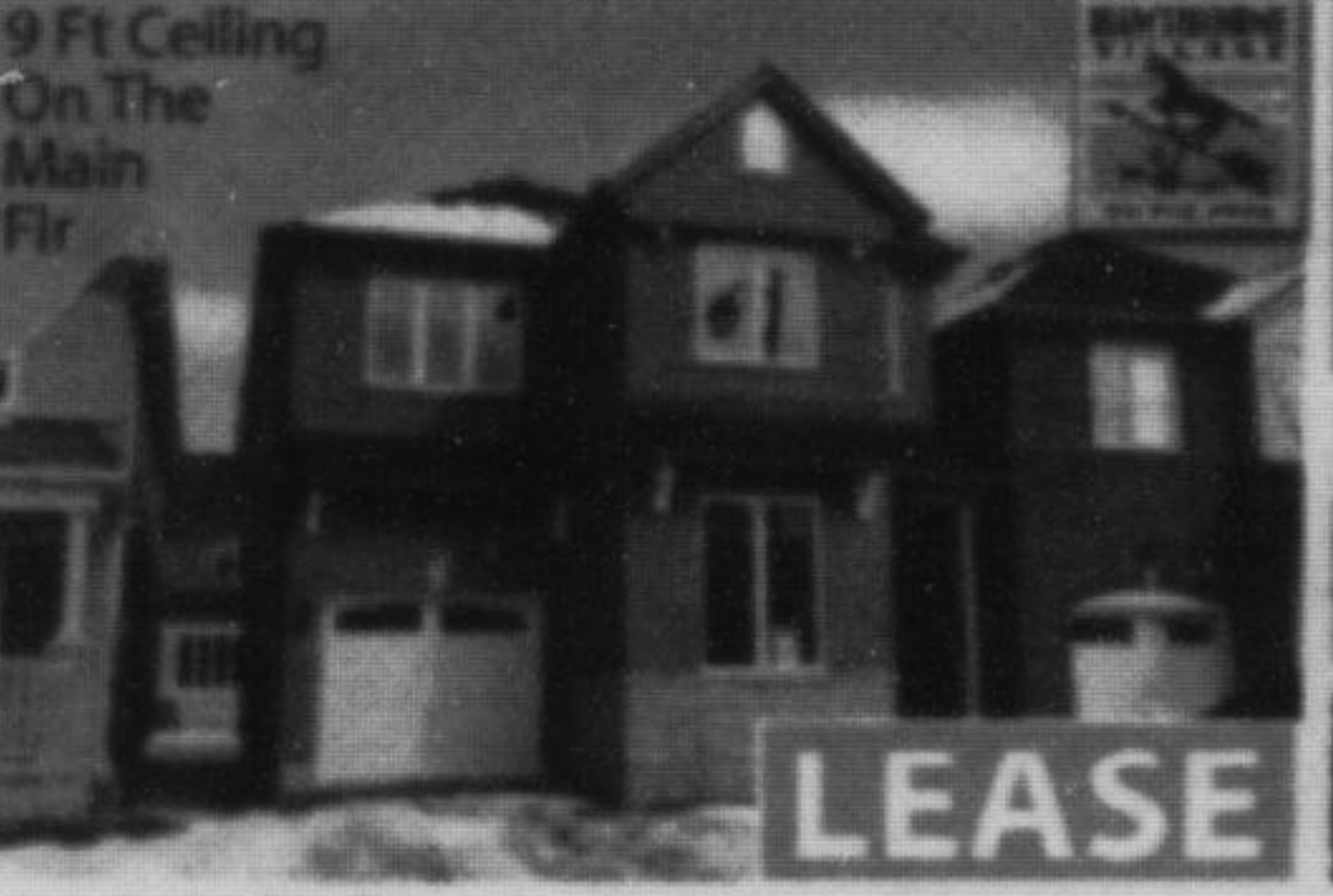
9 Ft Ceiling On The Main Flr LEASE 1124 Solomon Crt $1,800/mo 4 Bdrms • 3 Washrms • Mattamy