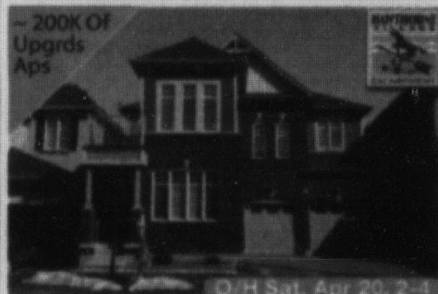
~ 200K Of Upgrds Aps O/H Sat, Apr 20, 2-4 837 Whaley Way $734,900 3+1 Bdrms • 4 Washrms • Wild Rose