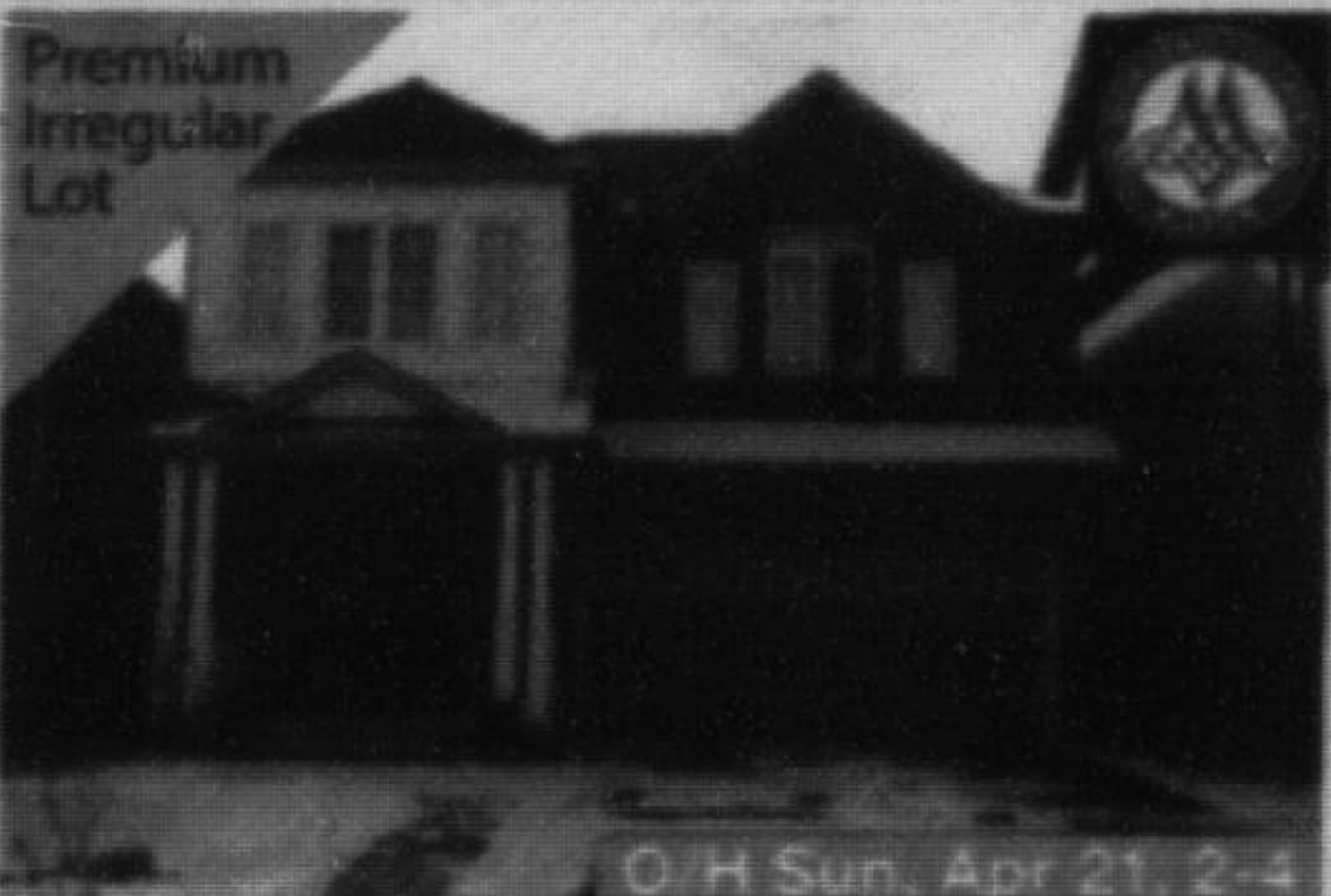
Premium Irregular Lot O/H Sun, Apr 21, 2-4 440 Bussel Cres $499,900 4 Bdrms • 3 Washrooms • Iris