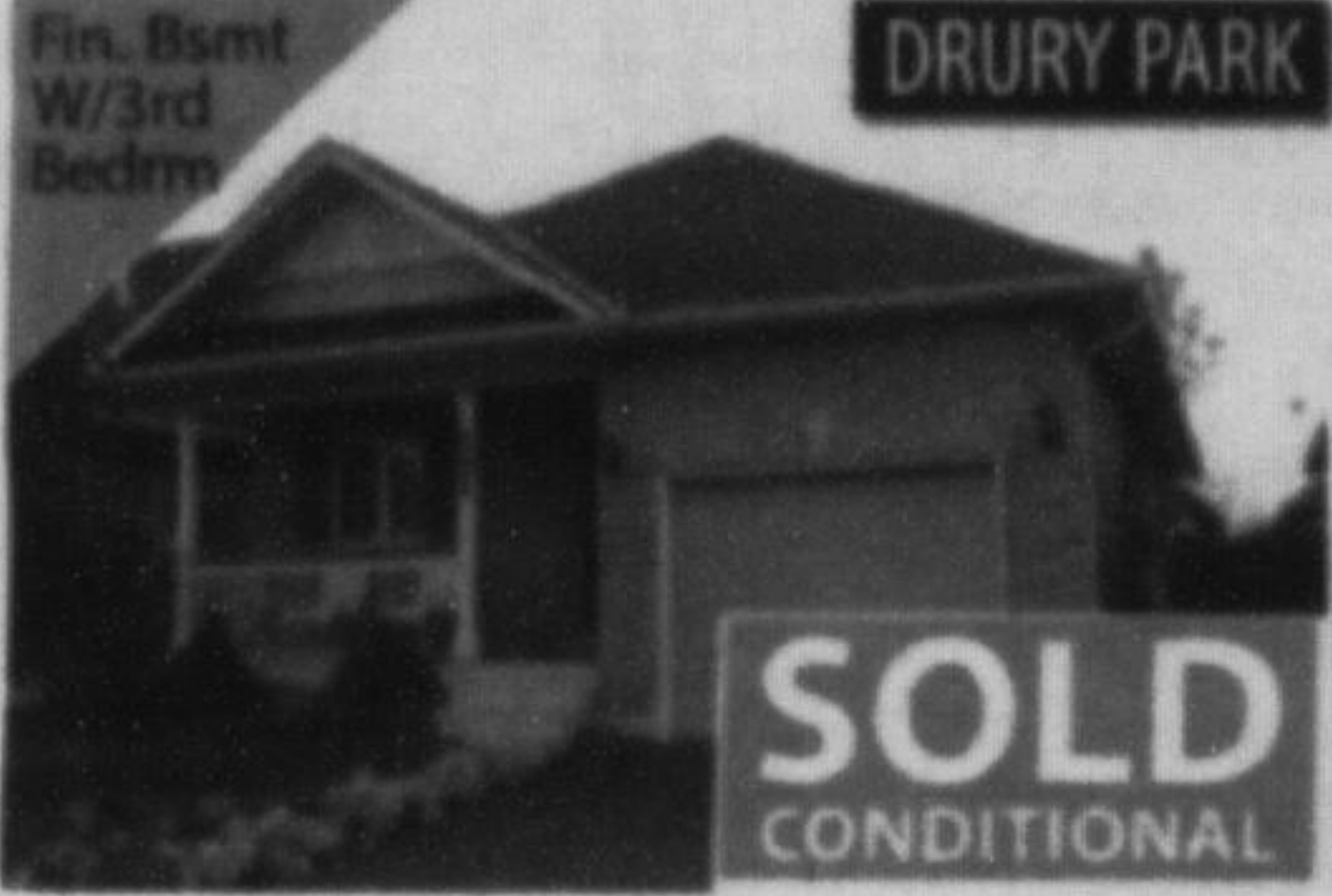
Fin. Bsmt W/3rd Bedrm SOLD CONDITIONAL 291 Centennial Forest $414,900 2+1 Bdrms • 2 Washrms • Drury Park