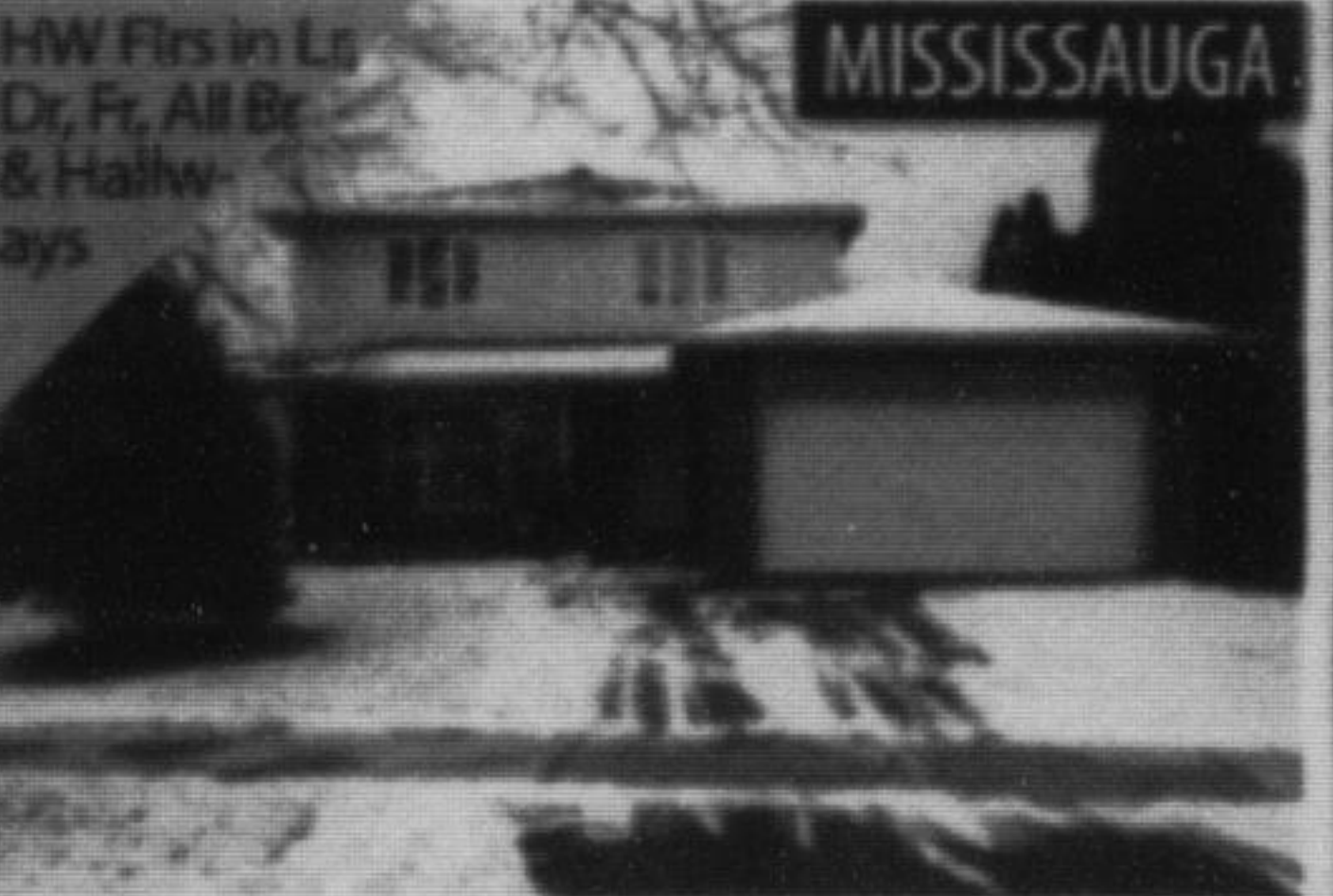
HW Flrs in Lg Dr, Fr, All Br & Hallways 3077 Windwood Dr $499,000 4 Bdrms • 4 Washrooms • Detached