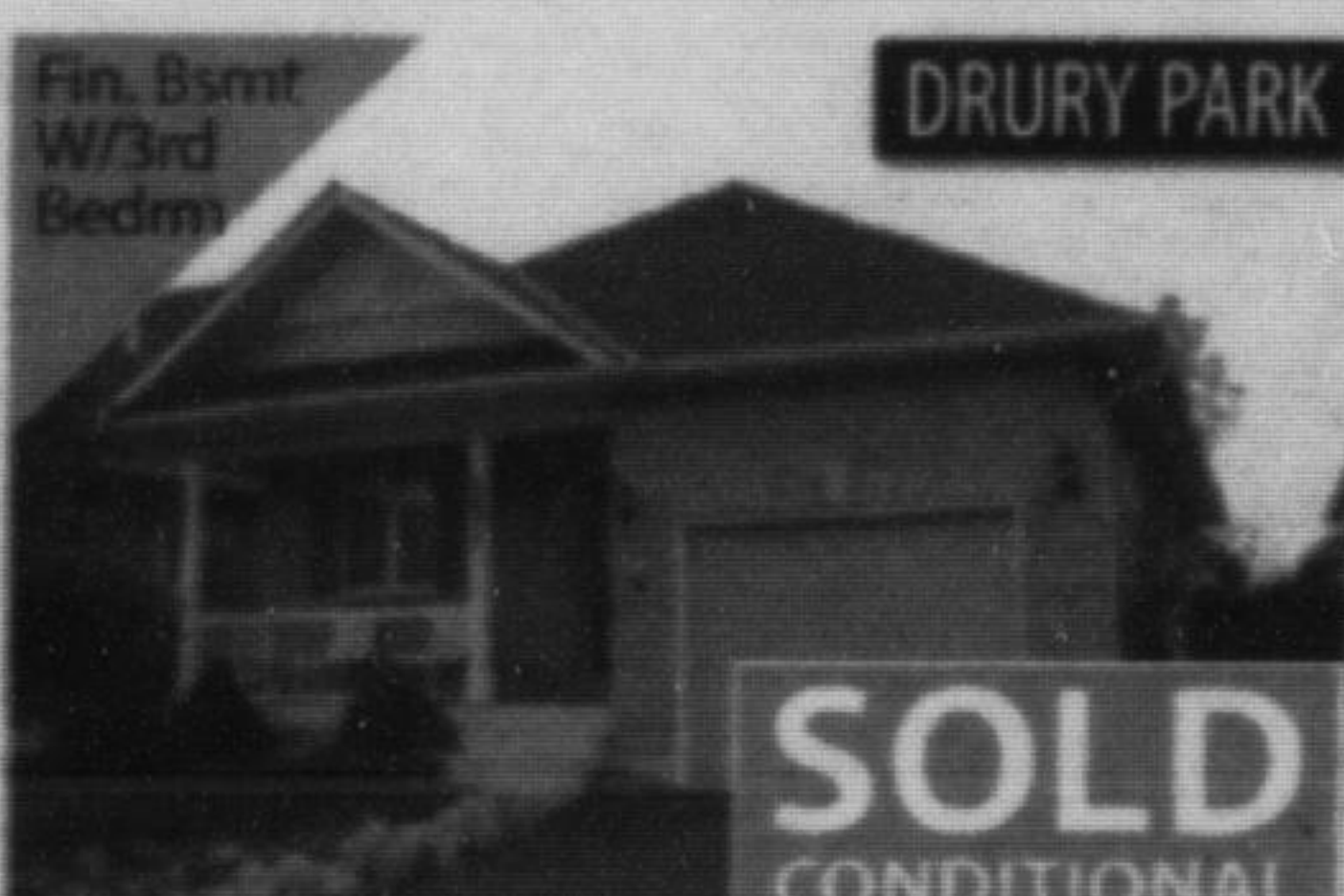
291 Centennial Forest $414,900 2+1 Bdrms • 2 Washrms • Drury Park