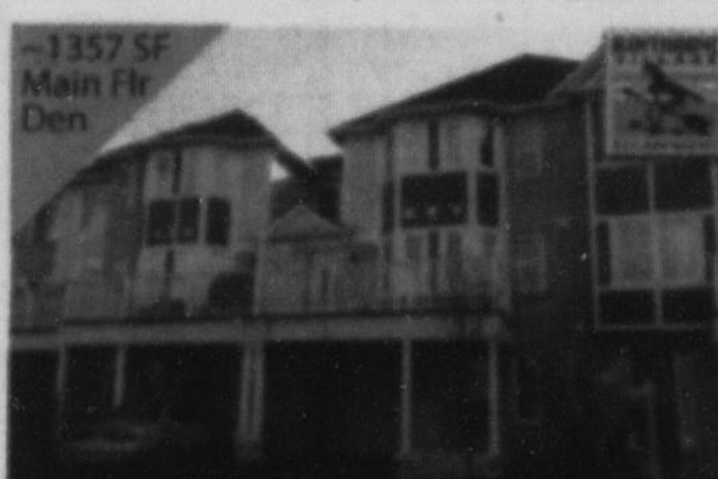
271 Prosser Circ $339,900 3 Bdrms • 2 Washrooms • Springdale