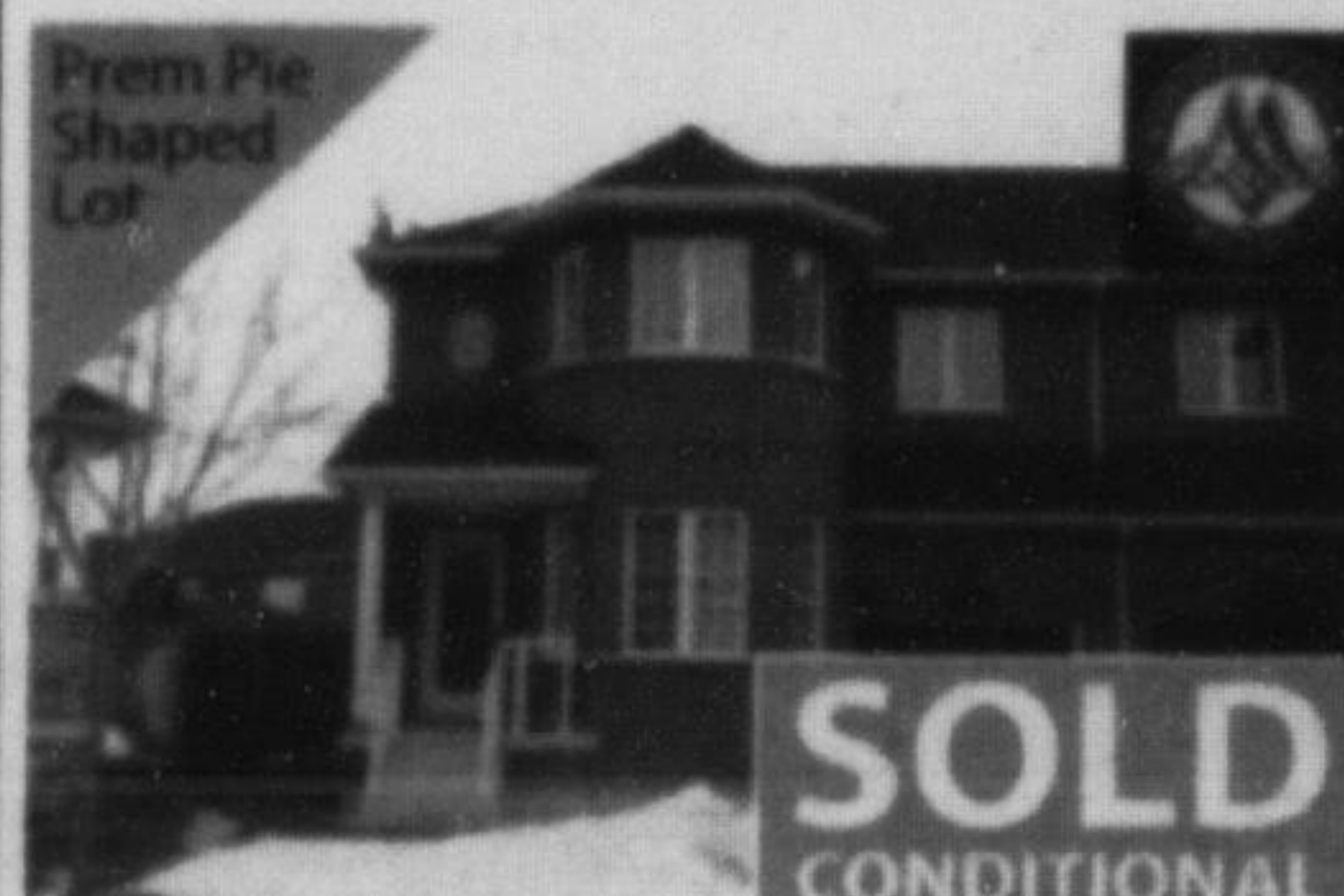
312 Fasken Crt $445,500 3 Bdrms • 3 Washrooms • Willow