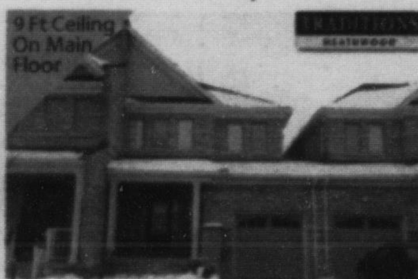
26 Forbes Terr $419,900 3 Bdrms • 3 Washrms • Meadowlark