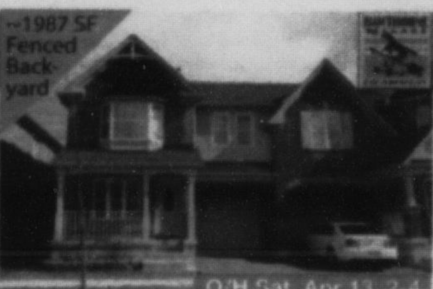
174 Mcdougall St $439,500 4 Bdrms • 3 Washrooms • Southbury