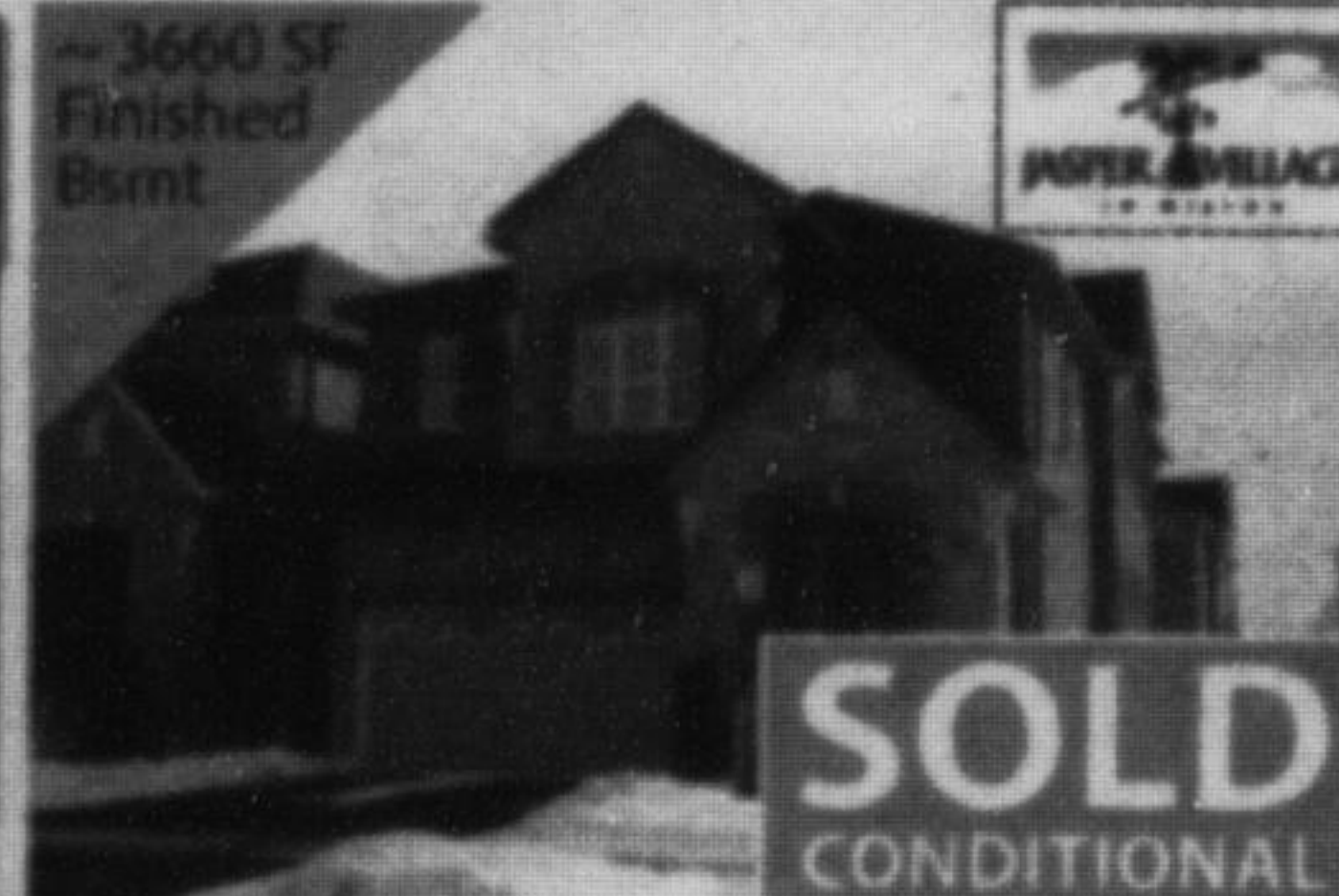
751 Pitcher Pl $649,900 4 Bdrms • 4 Washrms • Thompson