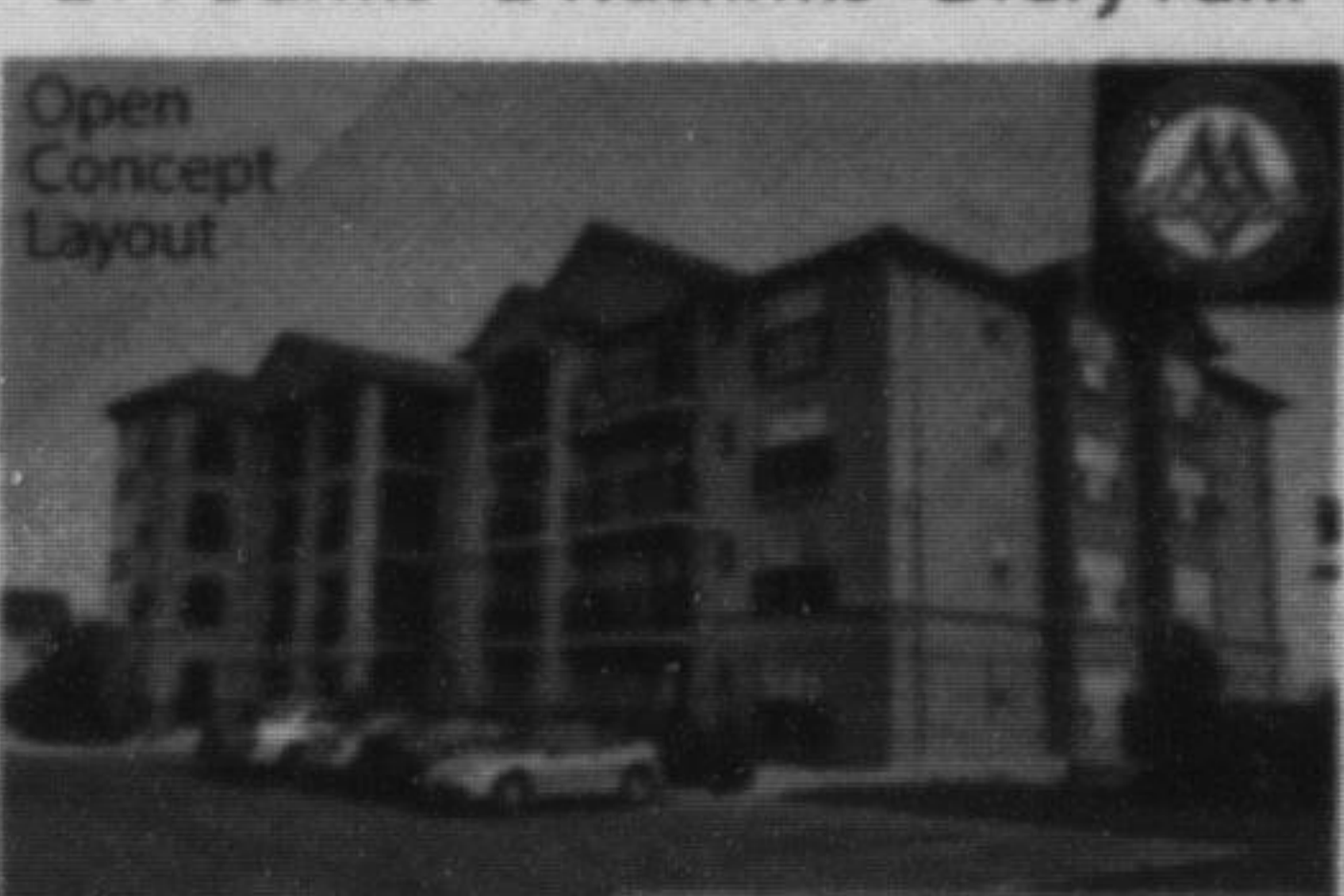
1479 Maple Av #212 $299,900 2 Bdrms • 2 Washroom • Windsor