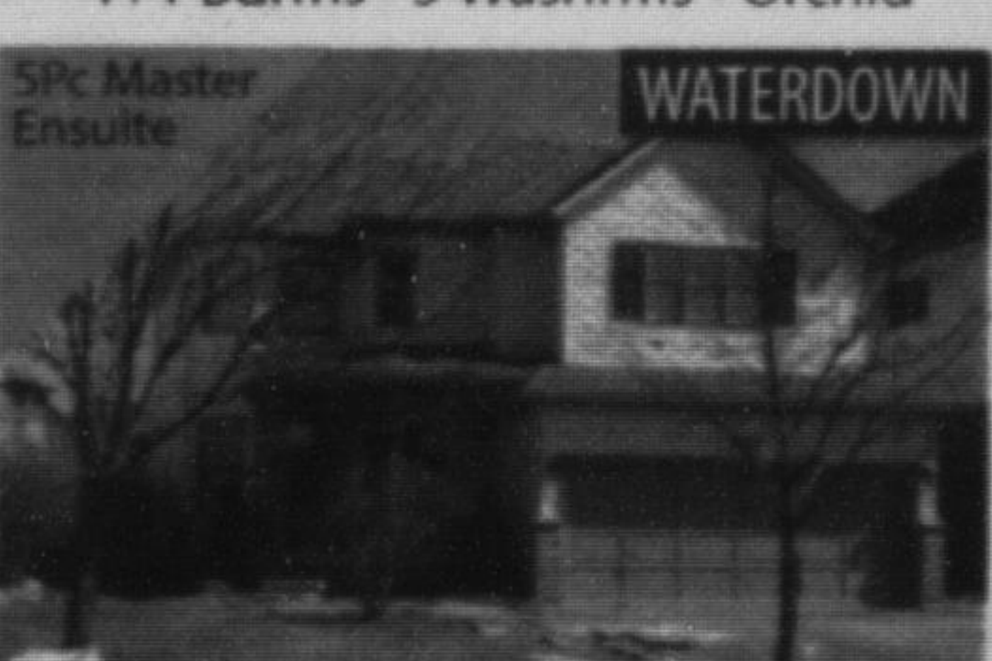
142 Riley St $519,900 Finished Basement W/4th Bedroom