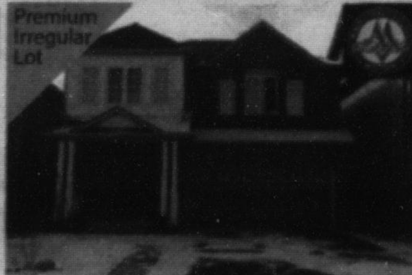
440 Bussel Cres $499,900 4 Bdrms • 3 Washrooms • Iris