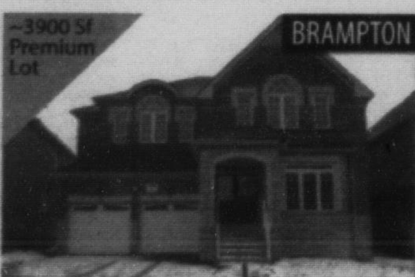
4 Plentywood Dr $859,900 4+1 Bdrms • 5 Washrms • Orchid