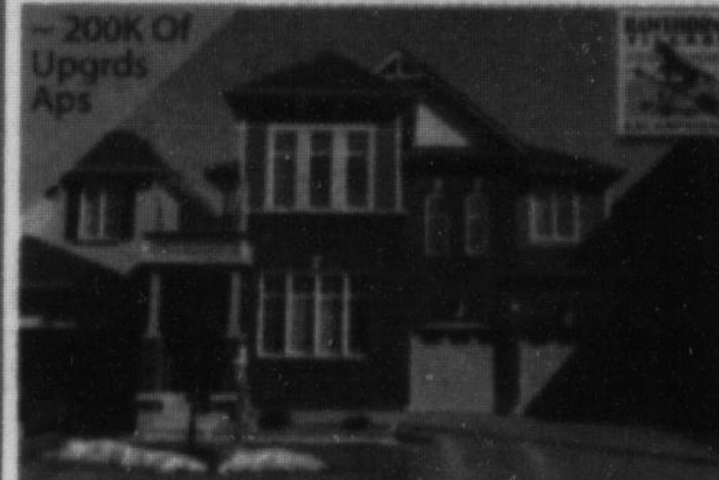
837 Whaley Way $734,900 3+1 Bdrms • 4 Washrms • Wild Rose