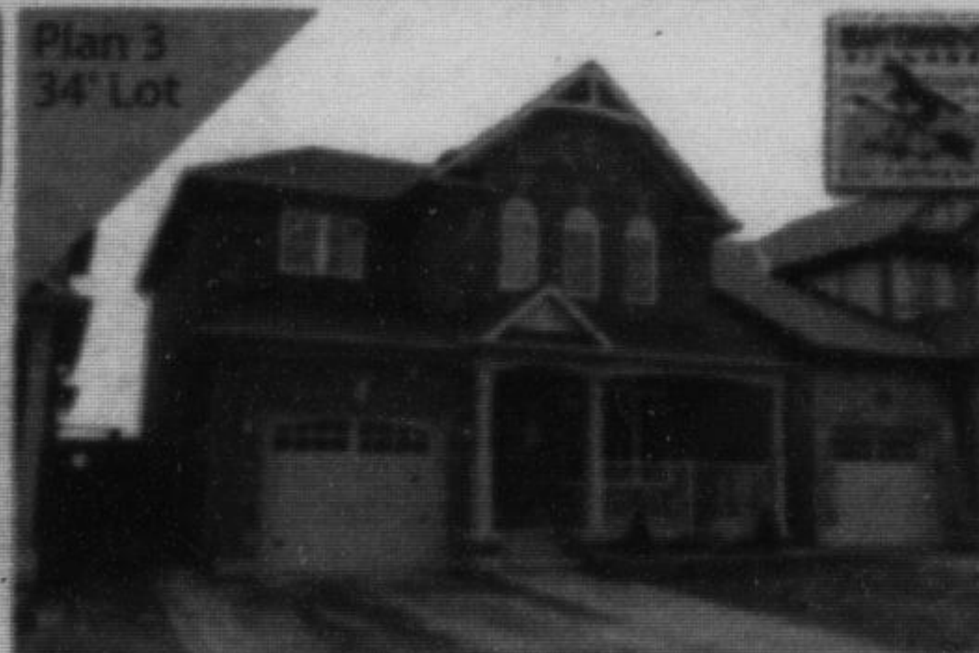
342 Schreyer Cres $468,400 3 Bdrms • 4 Washrooms • Fin. Bsmt