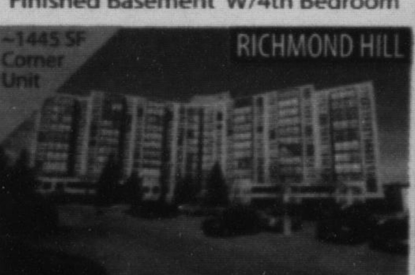
40 Harding Blvd #1012 $314,900 2+1 Bdrms • 2 Washrms • Dynasty