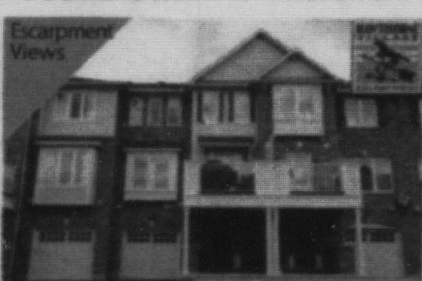
873 Willingdon Cres $322,900 2 Bdrms • 2 Washrms • Cherrywood