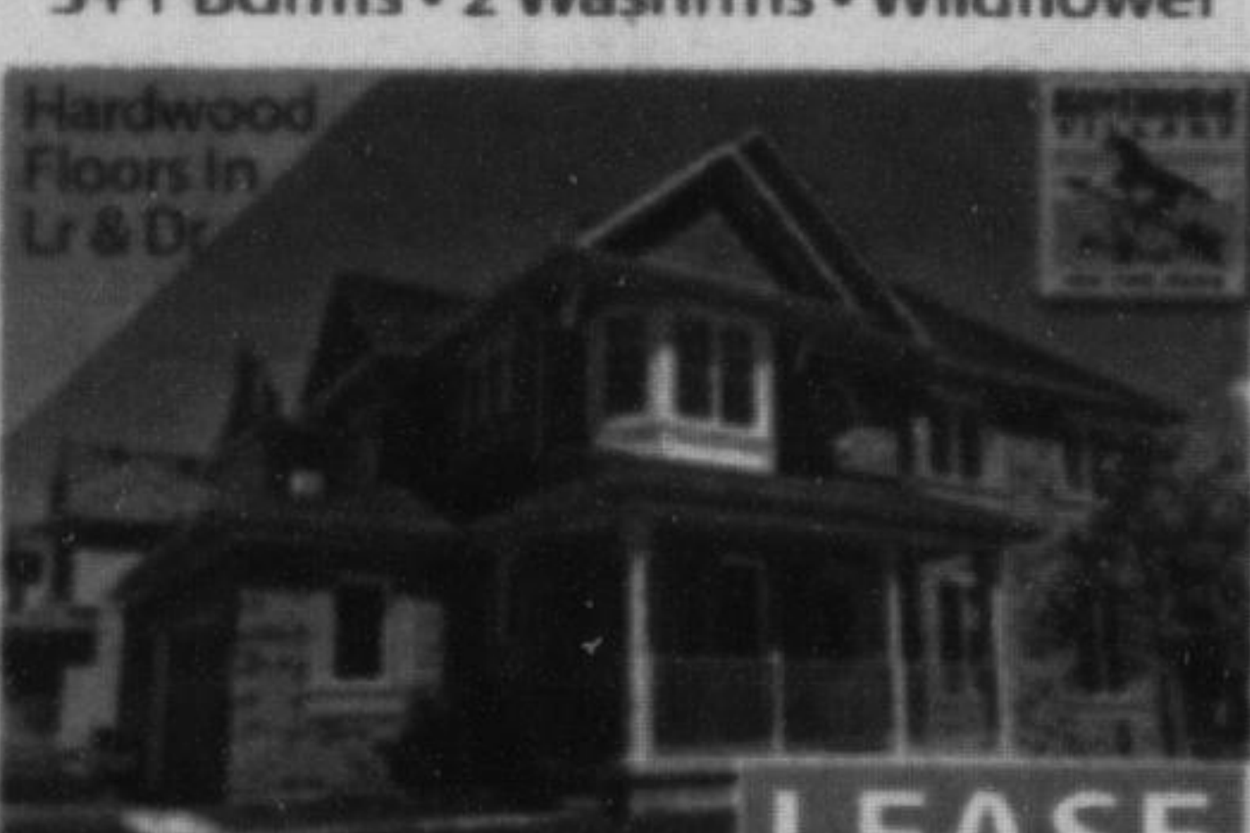
997 Whewell Tr $1,800/mo 4 Bdrms • 3 Washrms • Mattamy