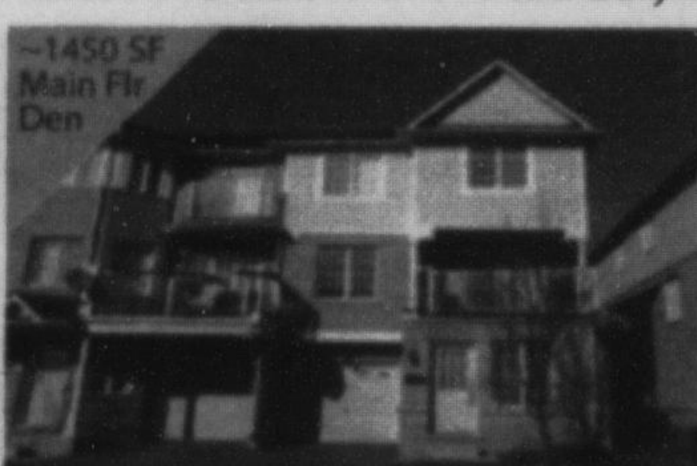
620 Ferguson Dr 113 $329,900 3+1 Bdrms • 2 Washrms • Wildflower