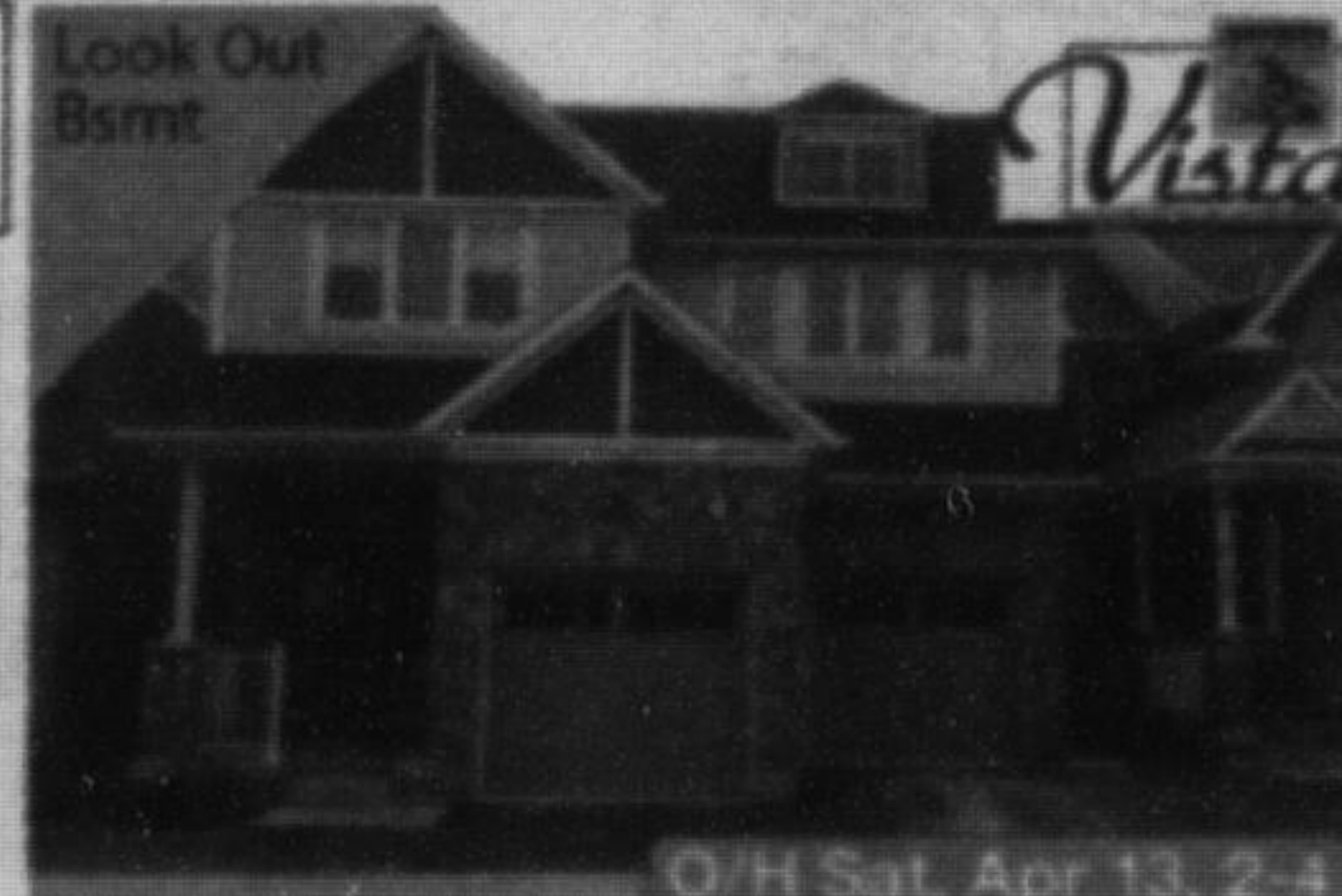
318 Pringle Ave $559,900 4 Bdrms • 3.5 Washrms • Wood Lilly