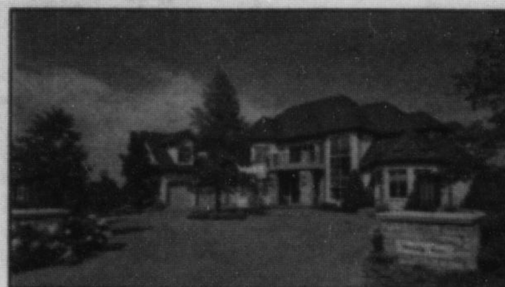
CUSTOM BUILT LUXURY HOME - $5,995,000

905-845-9180 • 1-888-462-4851 • GoodaleMillerTeam.com