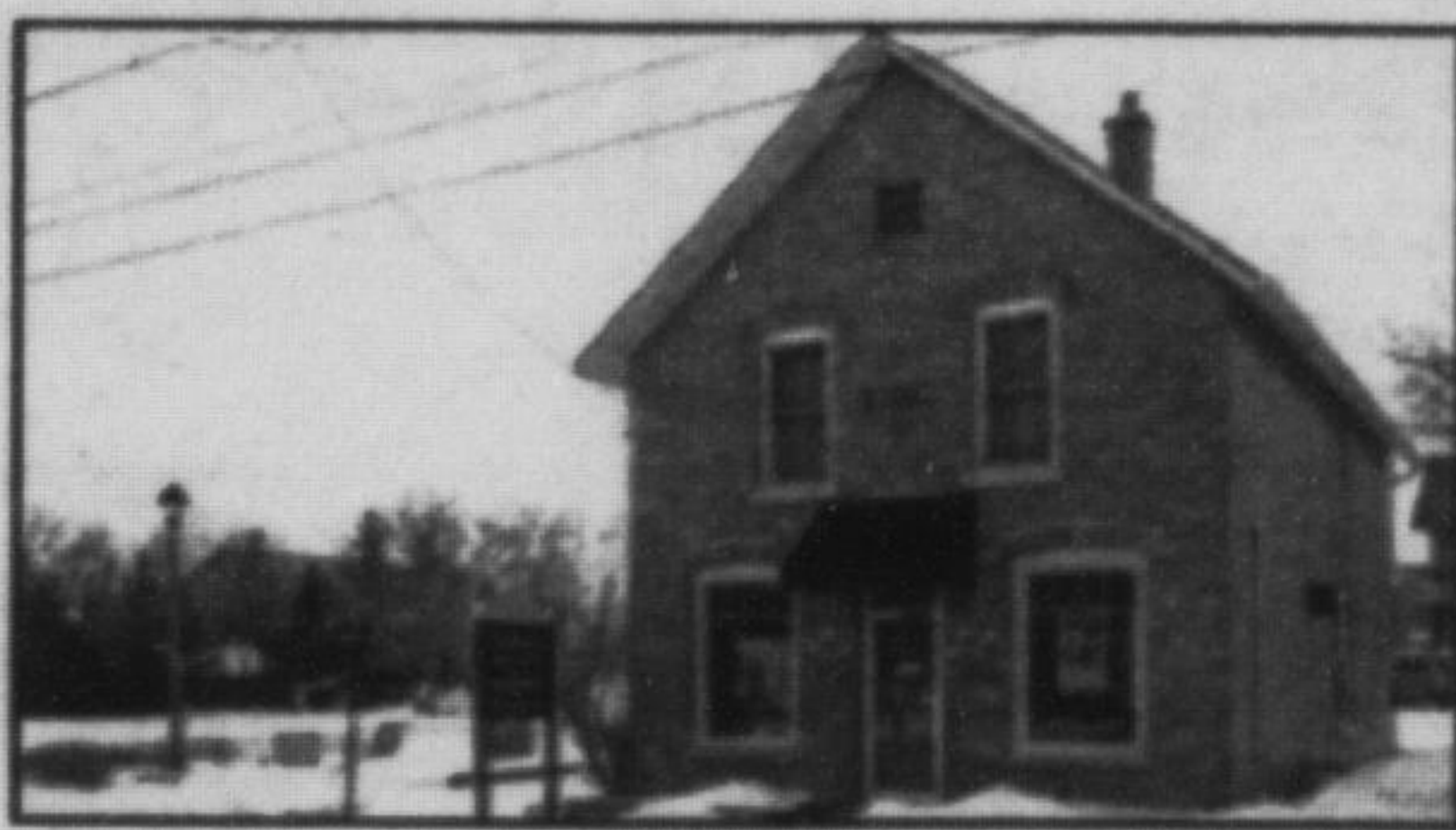
LIVE/WORK IN CAMPBELLVILLE - $575,000

Charming multi use duplex, ideal for live-in work space (retail/office) in the village of Campbellville. Just south of the 401 on Main St. in a high traffic area with an abundance of parking. Currently used as hair salon on the main level with 2nd level 2 bedroom residence/apartment ($1000/mth). Completely updated with newer roof, windows, electrical, plumbing systems. Great location/flexible zoning.