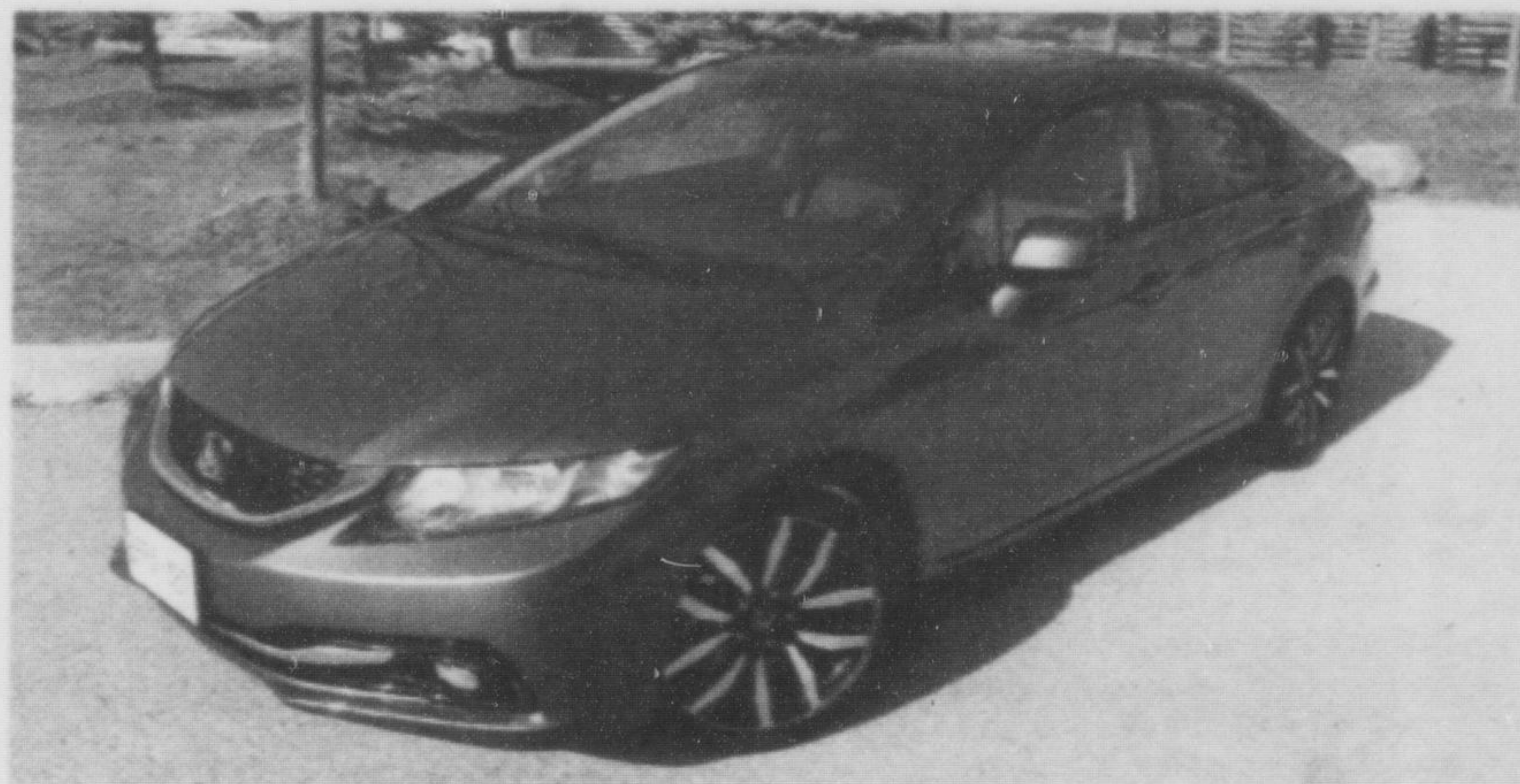
The U.S. Institute for Highway Safety (IIHS) has given the 2013 Honda Civic Coupe and Sedan its Top Safety Pick +