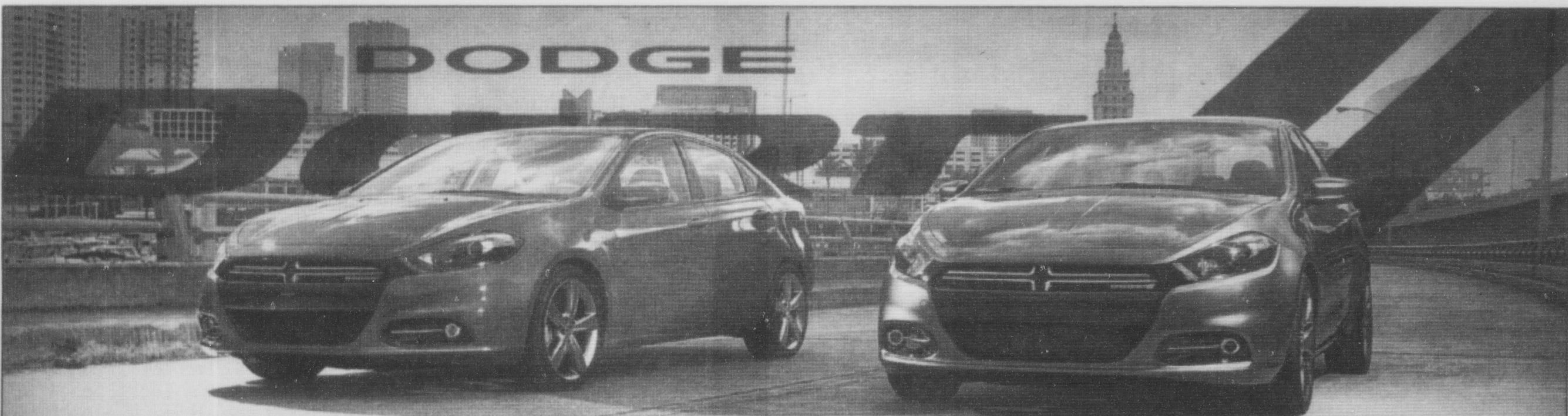
2013 Dodge Dart GT shown.*