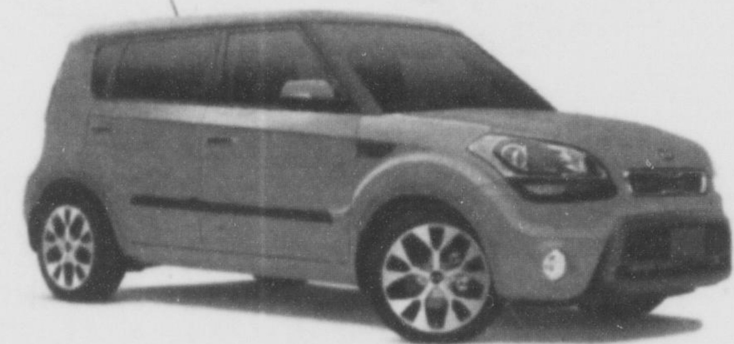
Soul 4x shown**

bi-weekly for 60 months, amortized over 84 months with $0 DOWN PAYMENT , $7,840 remaining balance. Offer includes delivery, destination and fees of $2,183 and $750 LOAN SAVINGS* . BASED ON A PURCHASE PRICE OF $26,878. Offer based on 2013 Sportage 2.4L LX AT FWD.