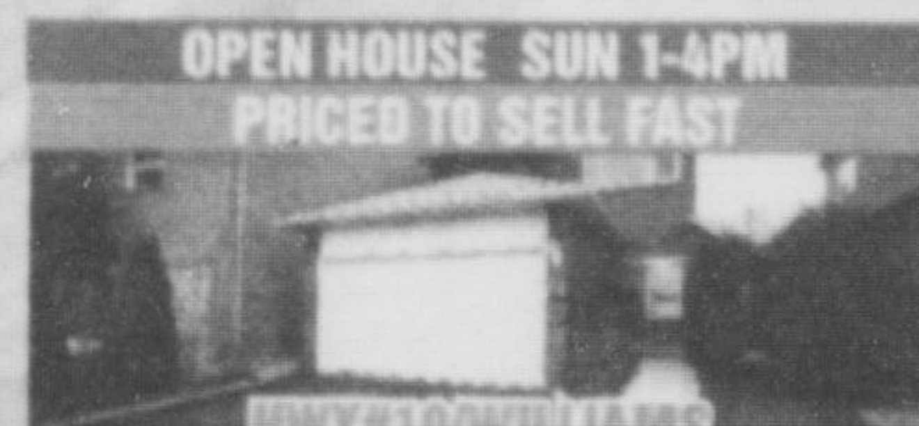
OPEN HOUSE SUN 1-4PM PRICED TO SELL FAST

One Of The Biggest Model On The Street, End Unit Like A Semi, 1927 Sq. Ft. As Per Builder Plan. Mattamy Build Freehold Town House With Practical Layout. Tons Of Upgrades. Main Floor Combined Living & Dining Room. Sep Family Room. Fully Upgraded Kitchen Cabinets. Granite Countertop. Upgraded S/S Appliances. Upgraded Sink & Faucet. Master With Full Ensuite, Frameless Glass Shower, Soaker Tub & Granite Vanity. Freshly Painted In Neutral Decor. W/O Finished Bsmt. $379,900.