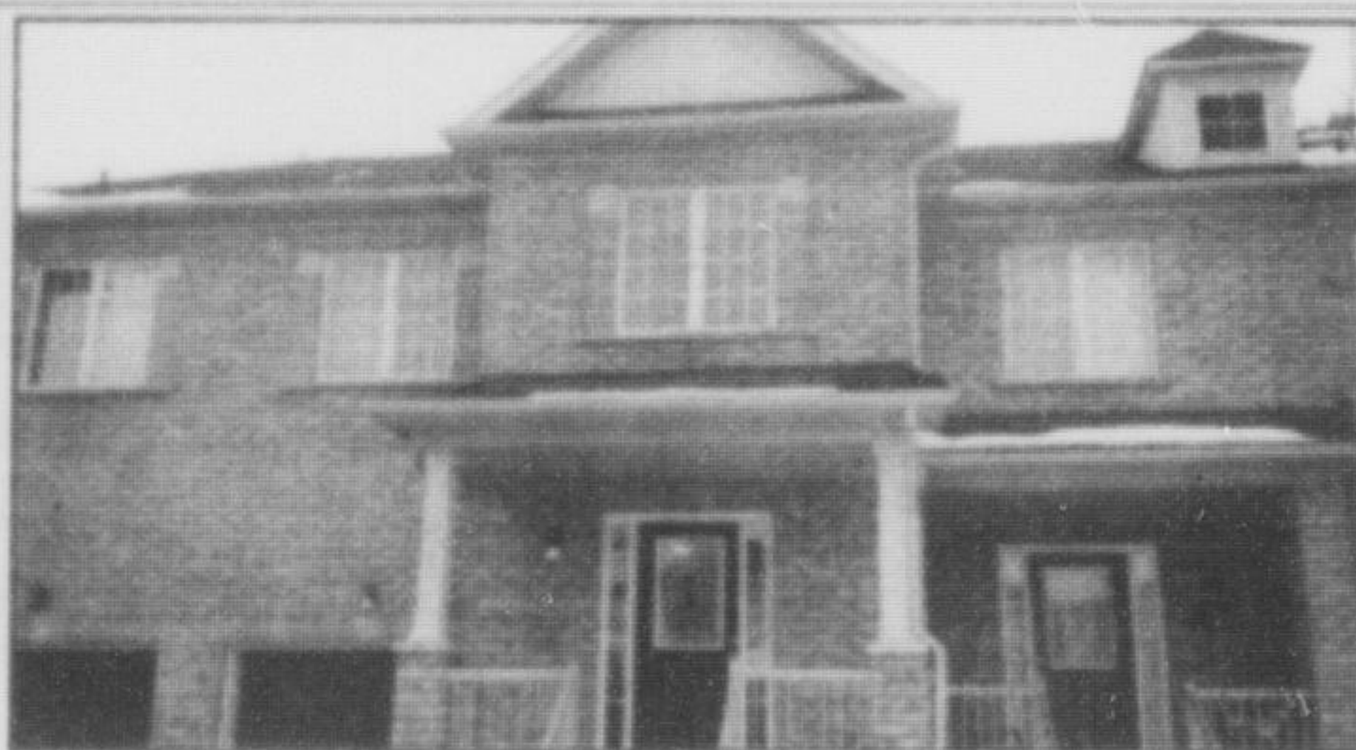
377 BUSSEL CRESCENT