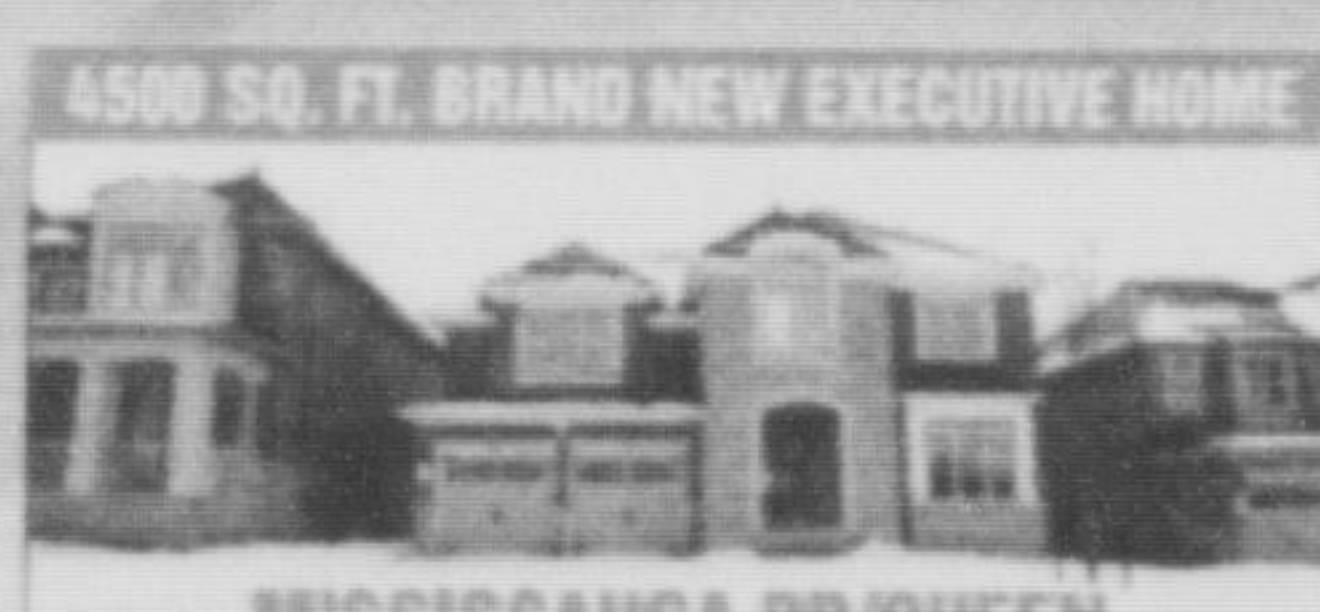
4500 SQ. FT. BRAND NEW EXECUTIVE HOME

Steal Of Deal! Gorgeous 4 Bedrooms Detached 2480 Sq Ft, All Brick Home In High Demand Area. Shows 10+++ Oak Stair, High Ceiling In L/R, Main F/L Laundry With Garage Access. Modern Kitchen With Centre Island, Double Door Garage, 45 Feet With Lot Mattamy Beauty. Family Room Built In Media Niche And Fireplace. Master Bedroom With 5 Pc Ensuite And W/I Closet. All Rooms Very Good Size With Closets. House Shows Well. $459,000.