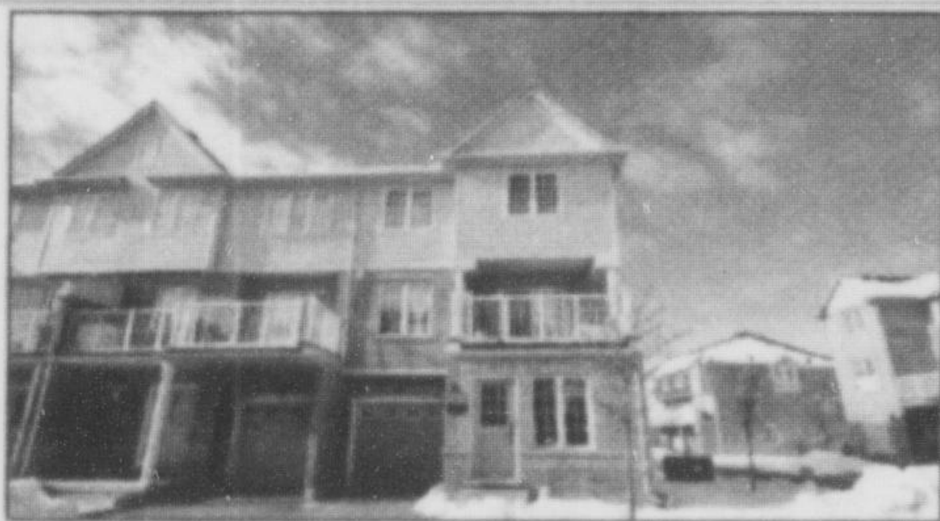
620 FERGUSON DRIVE #89

RE/MAX REALTY SPECIALISTS INC., BROKERAGE