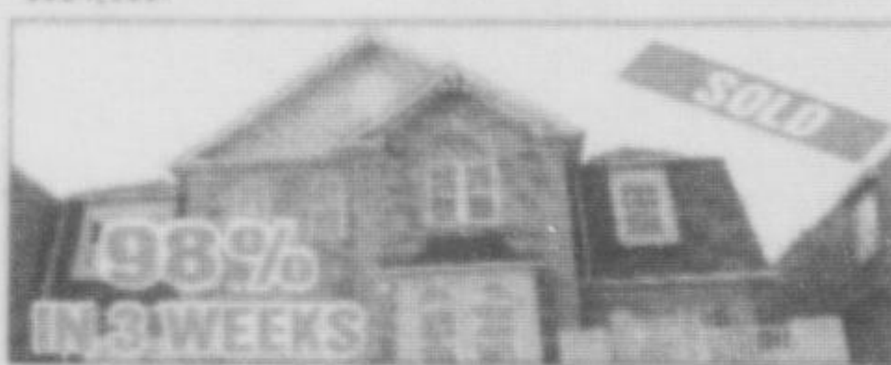
Louis St. Laurent / Farmstead