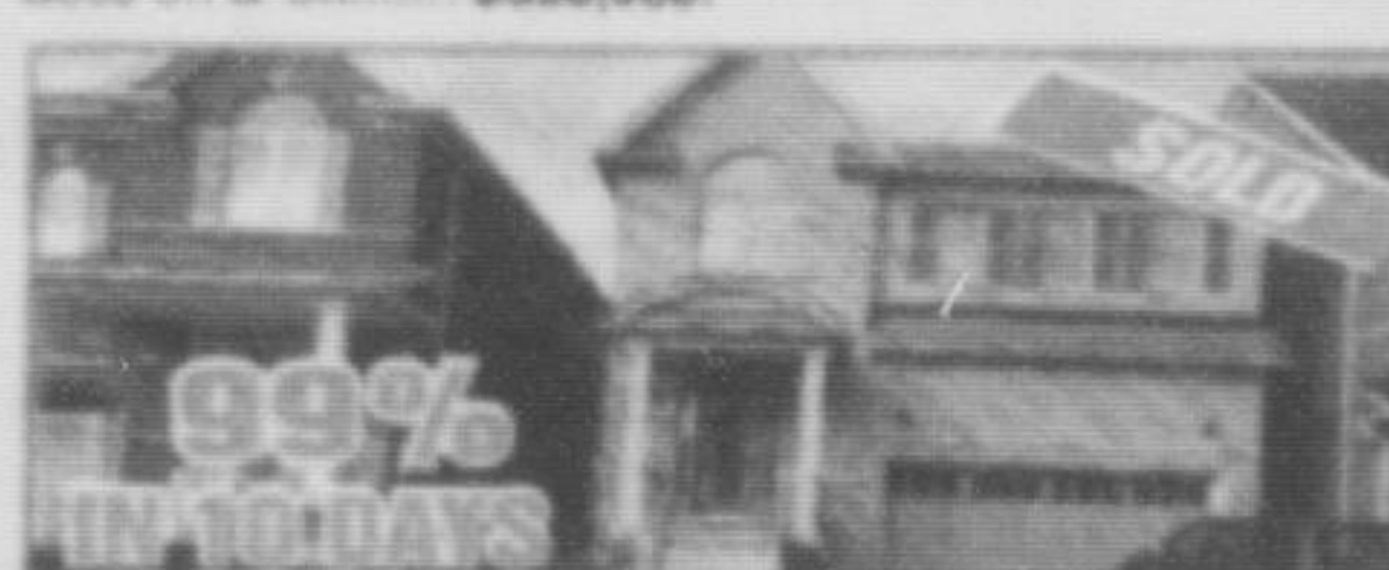
Derry / North Savoline

www.SaveMax.ca 145 Clarence St., Suite #29, Brampton ON L6W 1T2