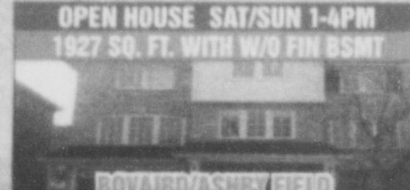
OPEN HOUSE SAT/SUN 1-4PM 1927 SQ. FT. WITH W/O FIN BSMT

House With A Wow Factor. Come And Appreciate This Beauty Of Brampton. 3 Bedroom Semi With Impressive Double Door Entry. Main Floor Combined Living & Dining Area. Sep Family Room. Eat In Kitchen. Huge Master With Full Ensuite, His & Her Closet. Good Size Bedrooms. Semi Finished Bsmt Can Be Converted Into Apartment. $369,900