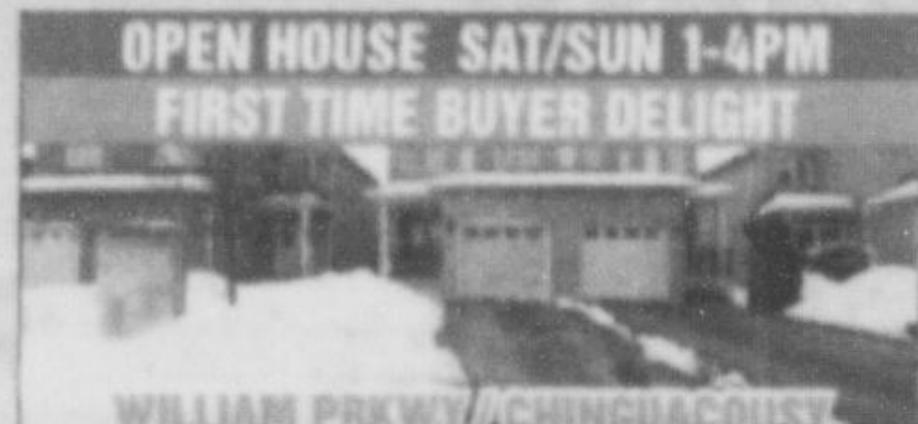
OPEN HOUSE SAT/SUN 1-4PM FIRST TIME BUYER DELIGHT