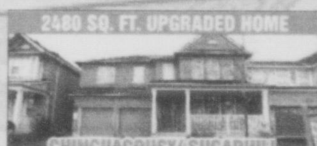
2480 SQ. FT. UPGRADED HOME

Excellent Opportunity To Own Well Maintained, Renovated & Professionally Painted Detached House With 2 Car Garage, Brand New Driveway, New Concrete Walkway & Patio, New Windows & Patio Door, New Toilets, Vanity & Mirrors, Stone Tiles In Main Washroom, New Casings, Baseboards And Doors, No Carpet Trim Out, New Oak Hardwood Stairs, New 3 Pc Washroom In The Basement. Mirrored Closets, New Yard Fence (2 Sides) With Gate. Desirable Location, Child Safe Crt. Close To Amenities. $384,900.