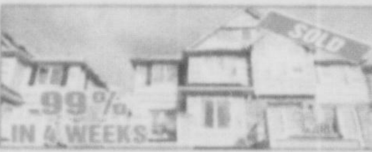
Derry / Scott

Welcome To Executive Detach Home On 60' Lot 4500 Sq Ft. Impressive Stone & Brick Elevation Front; Huge Tandem Garage. Double Door Entrance. 2X2' Porcelain Tiles On The Main Floor. Family Room & Den With Hardwood Floor; Upgraded Kitchen With Granite Counter Top, Back Splash, Walk-in Pantry, Large Breakfast Area, Mst Br With 7 Pc Ensuite. All Br's Attac. With Washroom & Walk-in Closet. List Goes On & On!!!! $998,500.