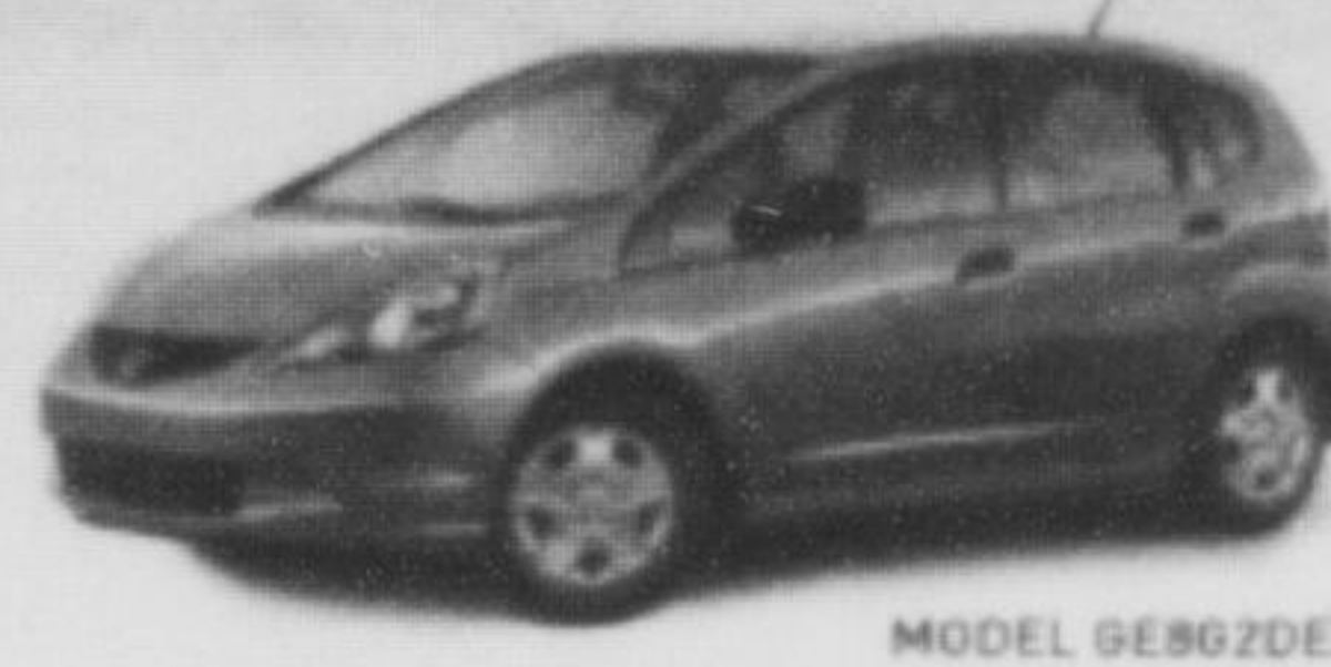
MODEL GE8G2DEX NAMED ONE OF CAR AND DRIVER'S 10BEST FOR THE 7TH YEAR IN A ROW

2013 FIT DX BI-WEEKLY LEASE FOR $77 @ 2.99% APR FOR 48 MONTHS** WITH $1,989 DOWN PAYMENT/OAC AND $0 SECURITY DEPOSIT