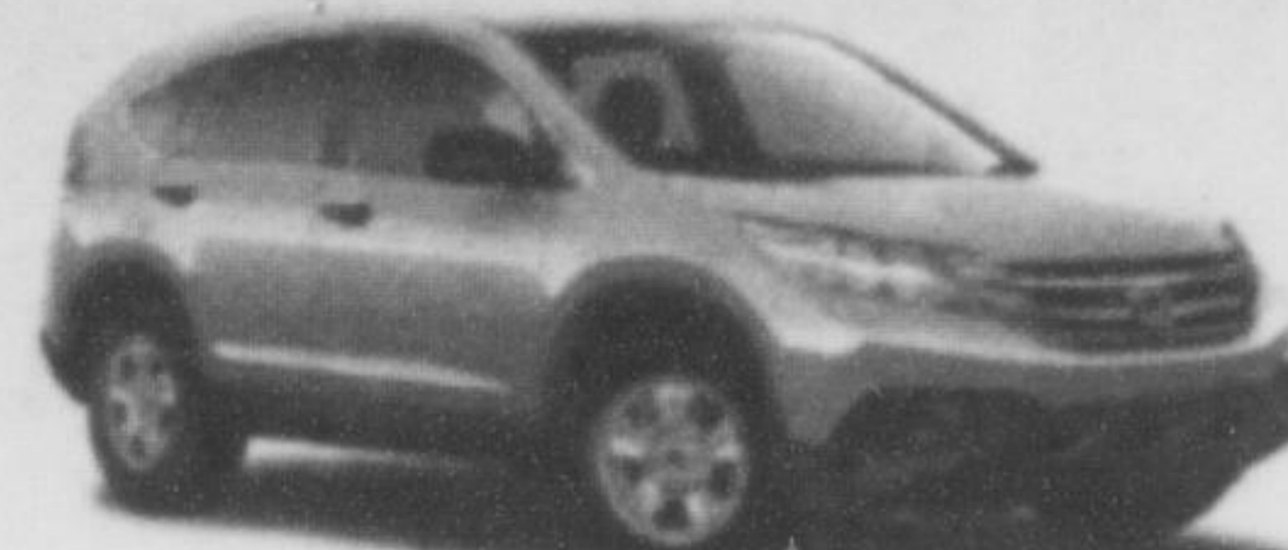
MODEL RM3H3DES 2013 IIHS TOP SAFETY PICK: SMALL SUV

2013 CR-V LX BI-WEEKLY LEASE FOR $139 @ 2.99% APR FOR 48 MONTHS** WITH $2,501 DOWN PAYMENT/OAC AND $0 SECURITY DEPOSIT