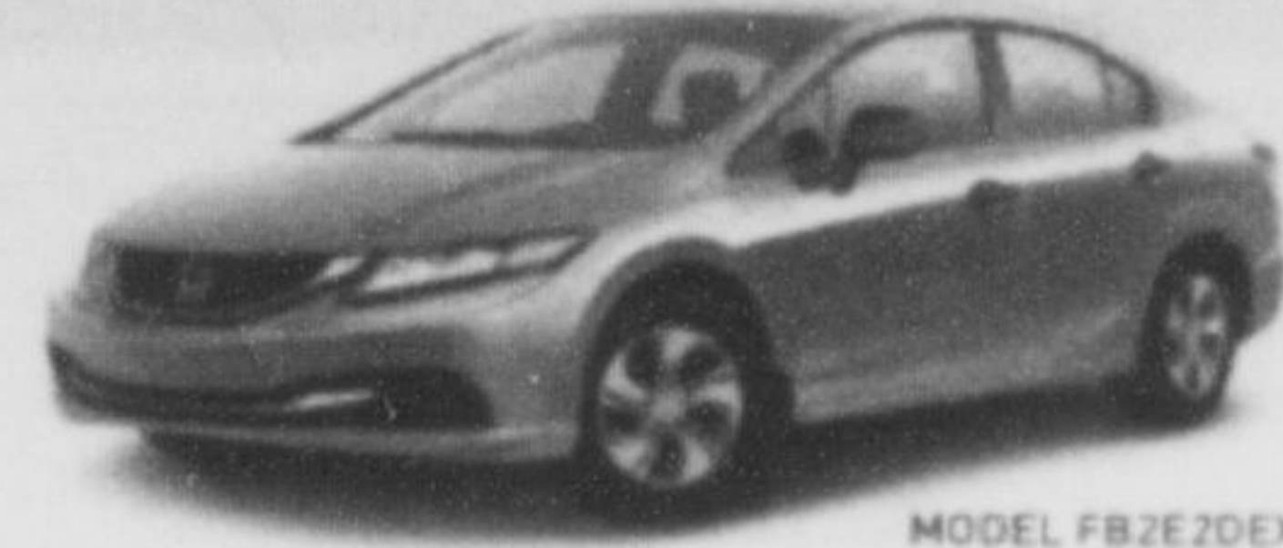
MODEL FB2E2DEX CANADA'S FAVOURITE CAR 15 YEARS IN A ROW**

ENHANCED 2013 CIVIC DX BI-WEEKLY LEASE FOR $82 @ 2.99% APR FOR 48 MONTHS** WITH $1,529 DOWN PAYMENT/OAC AND $0 SECURITY DEPOSIT