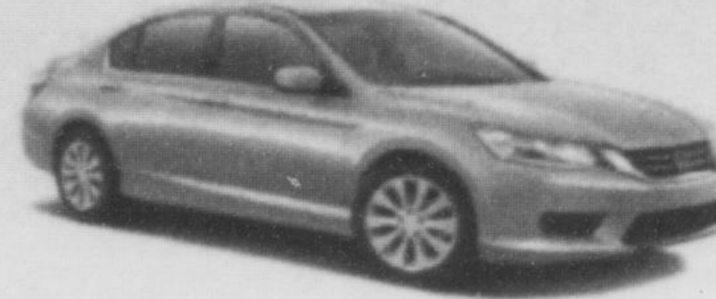
MODEL CR2E3DE 2013 CANADIAN CAR OF THE YEAR

THE ALL-NEW 2013 ACCORD LX BI-WEEKLY LEASE FOR $135 @ 3.99% APR FOR 48 MONTHS** WITH $2,042 DOWN PAYMENT/OAC AND $0 SECURITY DEPOSIT