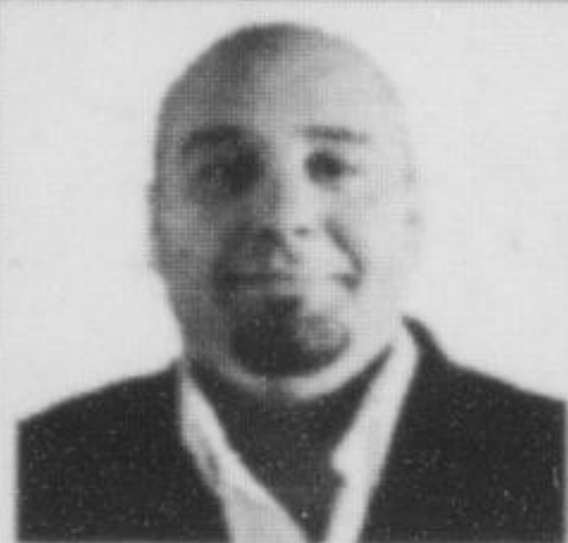
Fabrizio Pacchione* www.fabuloushomes.ca