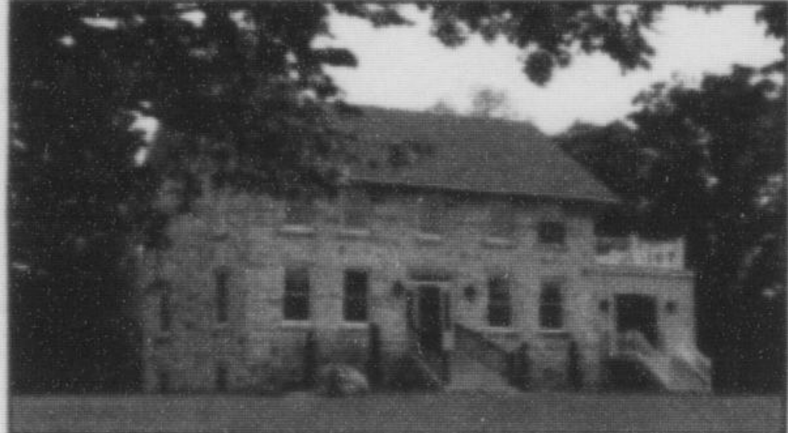
LUXURY LIVING MEETS FINE RESTORATION - $2,299,000

Impeccably maintained 1.5 acre property in Churchill Estates. 4 bedroom bungalow with rare main floor master & luxurious ensuite. 3,662 sq. ft. above grade, dark Oak hardwood throughout, custom kitchen with pantry, center island & breakfast area, main floor den. Bright & spacious with many windows. Three access points to covered porch. Beautiful 27'x 60' patio with pergola & irrigation system.