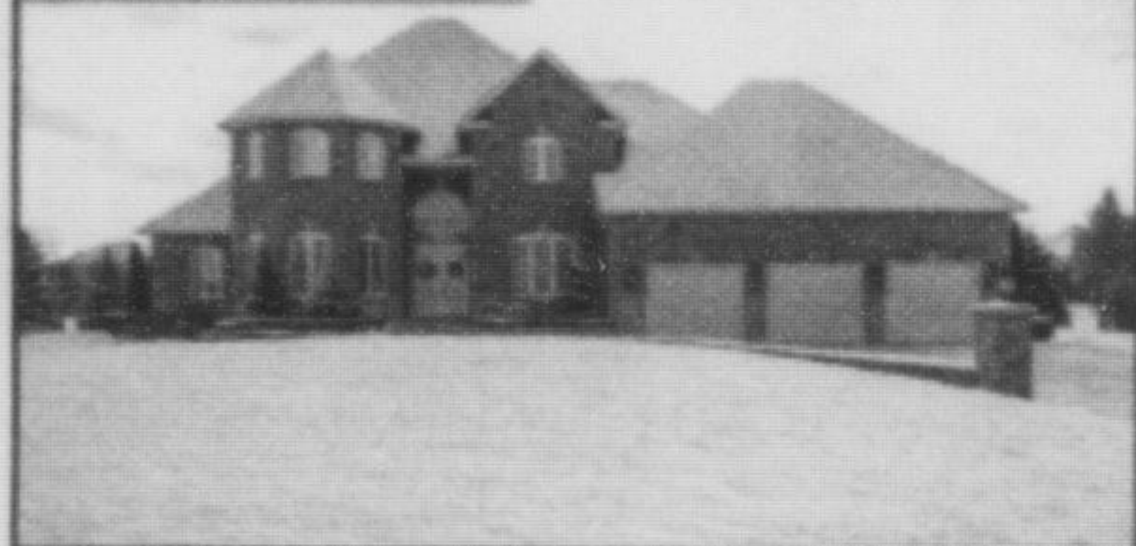
TRANQUIL CHURCHILL ESTATES - 1,149,000

Impeccably maintained 1.5 acre property in Churchill Estates. 4 bedroom bungalow with rare main floor master & luxurious ensuite. 3,662 sq. ft. above grade, dark Oak hardwood throughout, custom kitchen with pantry, center island & breakfast area, main floor den. Bright & spacious with many windows. Three access points to covered porch. Beautiful 27'x 60' patio with pergola & irrigation system.