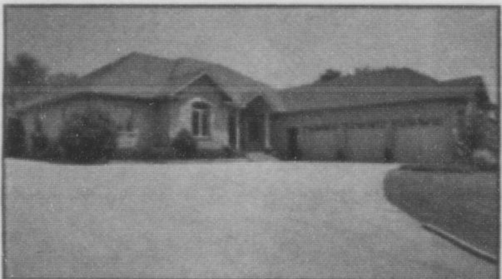
RURAL CAMPBELLVILLE - $1,049,900

Gorgeous c1850's home rebuilt stone by stone in 2008. Enjoy yesterday's charm with all of today's conveniences. Over 4700 sq ft of living space. Large principal rooms, custom kitchen with high end appliances, geothermal heating/cooling system, hardwood floors, two fireplaces. Master bedroom with ensuite plus private terrace overlooking 97 scenic acres. Just north of the 401 near Campbellville.