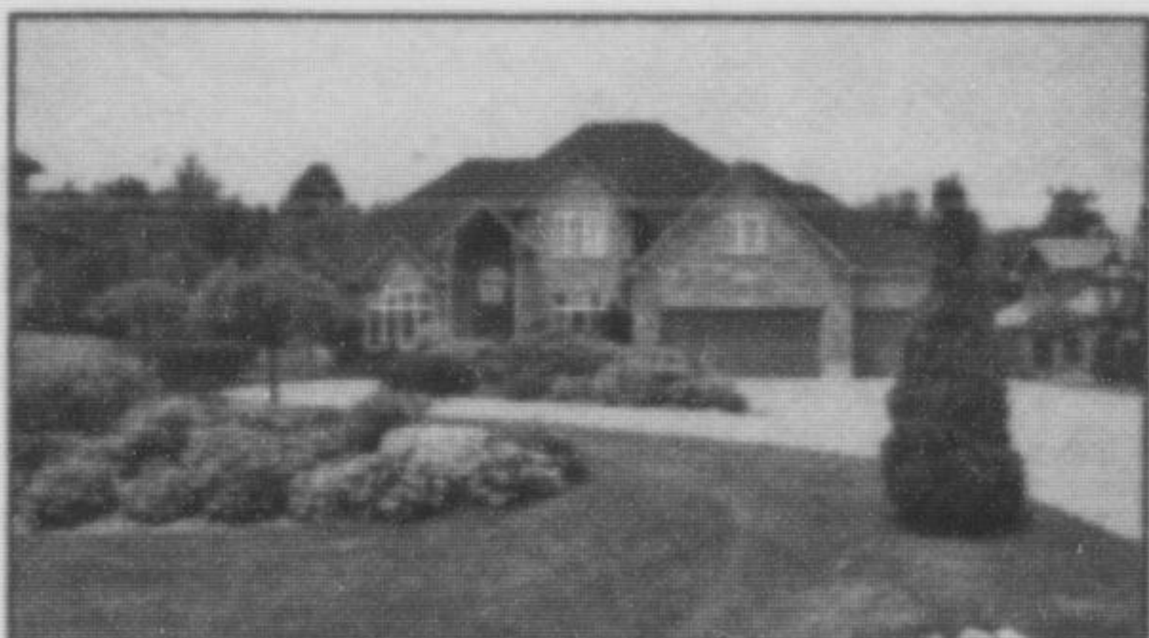
MORRISTON - $999,000

Recently built custom bungalow on private 2 acre lot. 2,683 sq ft of luxury finishes plus the finished lower level. Custom kitchen, Maple hardwood flooring throughout. Great floor plan with huge master suite, 2 large walk in closets, main level custom laundry room. Covered rear porch and impeccably landscaped.