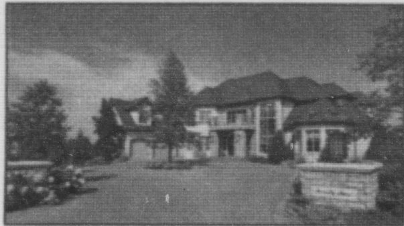
CUSTOM BUILT LUXURY HOME - $5,995,000

On Blue Springs Golf Course. 13,000 sq ft of luxury living with 5 car garage, 5 bdrms, all with ensuites & balcony access, separate guest suite, custom walnut millwork t/o, 2 laundry rooms, 4 season sunroom, main lvl master suite, fully fin L/L with heated floors, walkout, custom wine cellar, walk-in fridge & freezer, den, games & entertainment rooms, Gunite pool, & more.