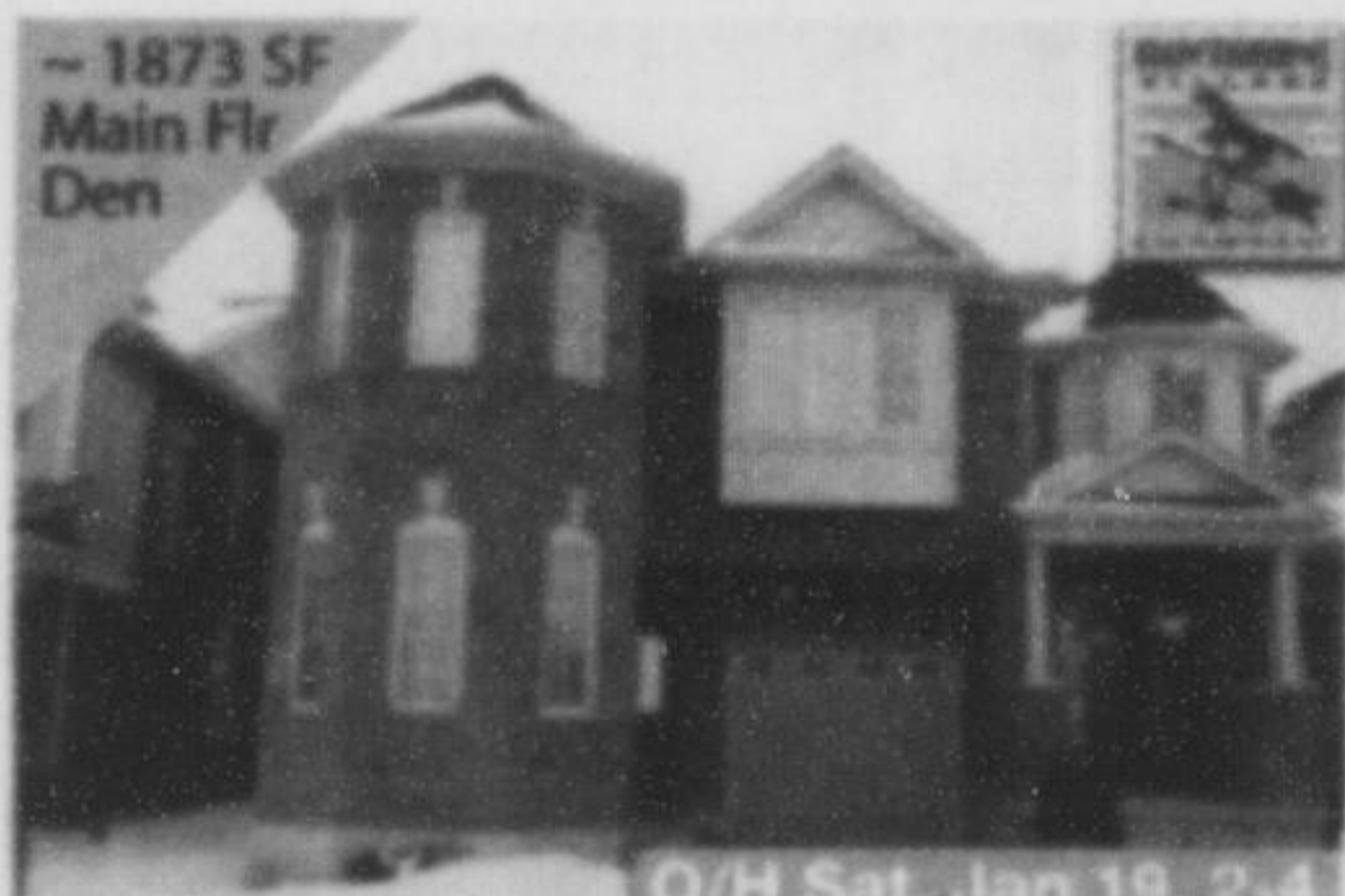
~1873 SF Main Flr Den O/H Sat, Jan 19, 2-4 251 Wise Crossing $399,900 3 Bdrms • 3 Washrms • Oakwood End