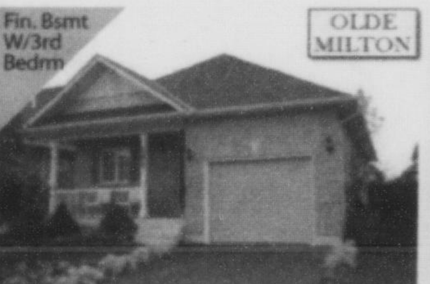
Fin. Bsmt W/3rd Bedrm O/H Sat, Jan 19, 2-4 291 Centennial Forest $419,900 2+1 Bdrms • 2 Washrms • Drury Park