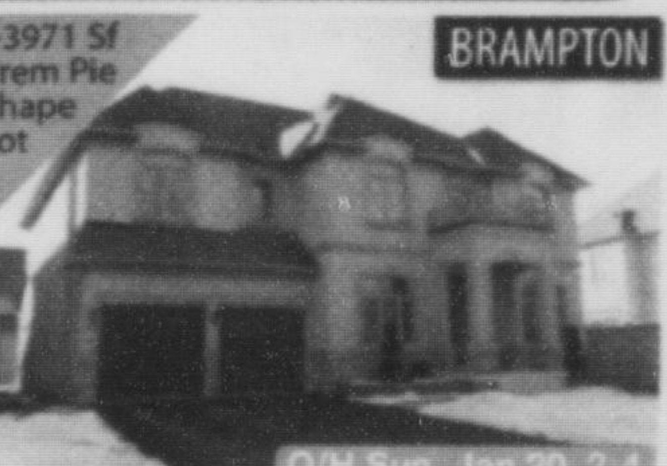
~3971 SF Prem Pie Shape Lot O/H Sun, Jan 20, 2-4 27 Beacon Hill Dr $974,900 5 Bdrms • 4 Washrooms • Edinburgh