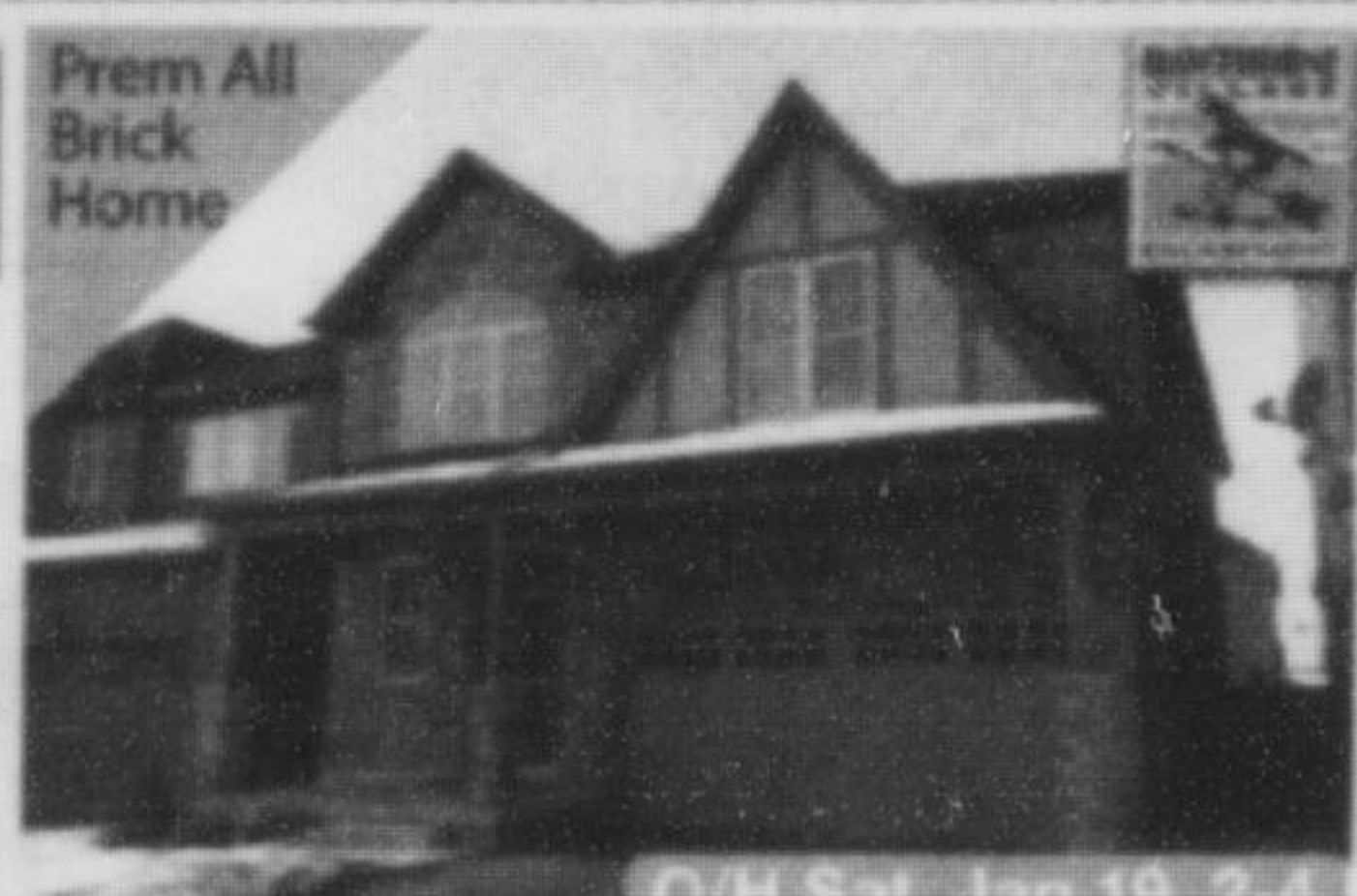
Prem All Brick Home O/H Sat, Jan 19, 2-4 475 Mockridge Terr $569,888 5 Bdrms • Energy Star • Mattamy