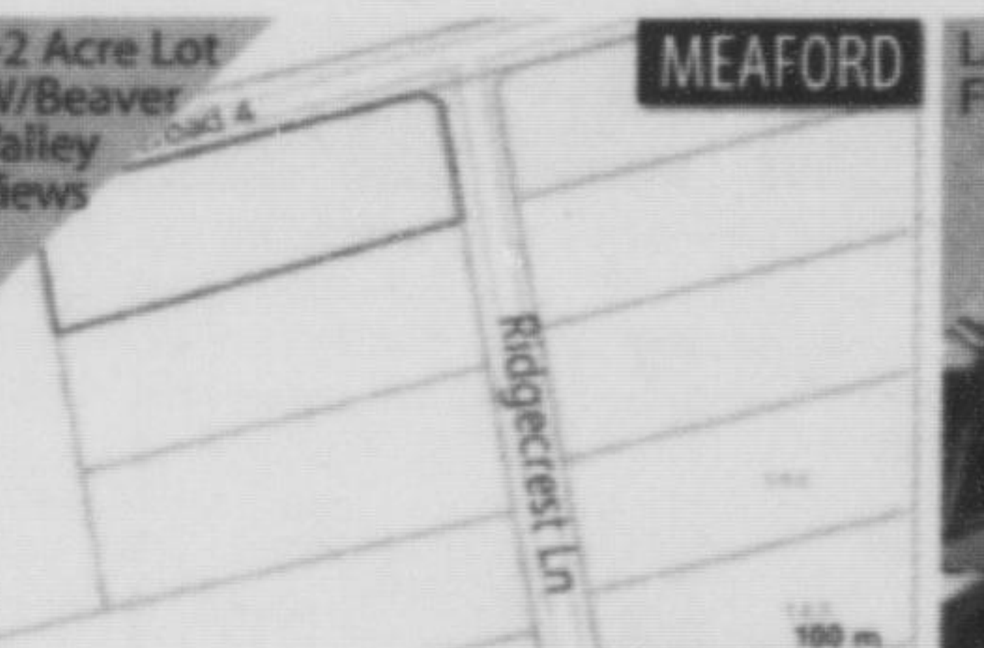
~2 Acre Lot W/Beaver Valley Views Close To Georgian Bay, Thornbury 00 Ridgecrest Lane $99,000