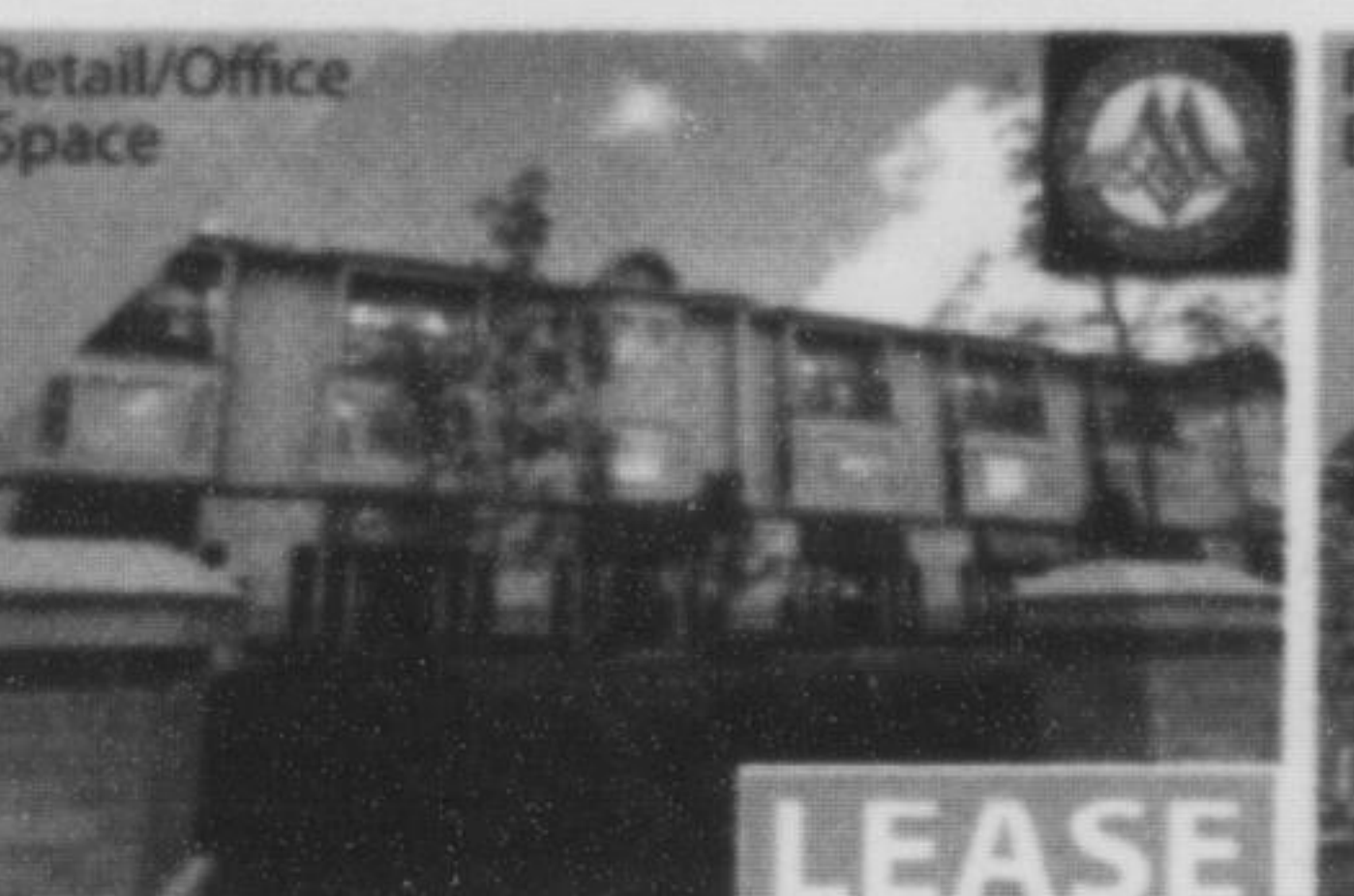
Retail/Office Space ~ 825 Sq Ft On Ground Floor 9133 Derry Rd $1,600/mo