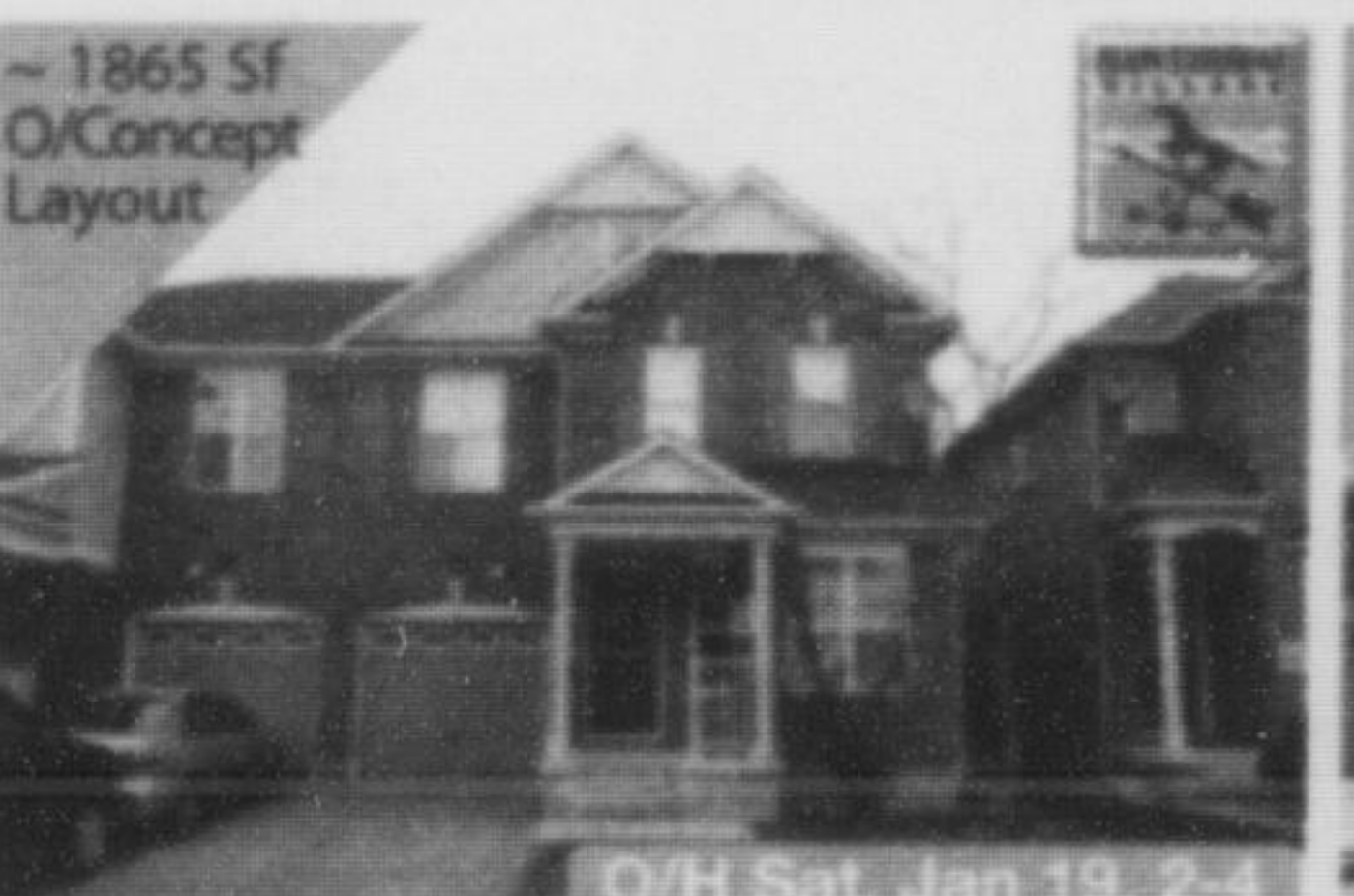
~1865 SF O/Concept Layout O/H Sat, Jan 19, 2-4 1115 Barr Cres $404,900 4 Bdrms • 3 Washrooms • Townland