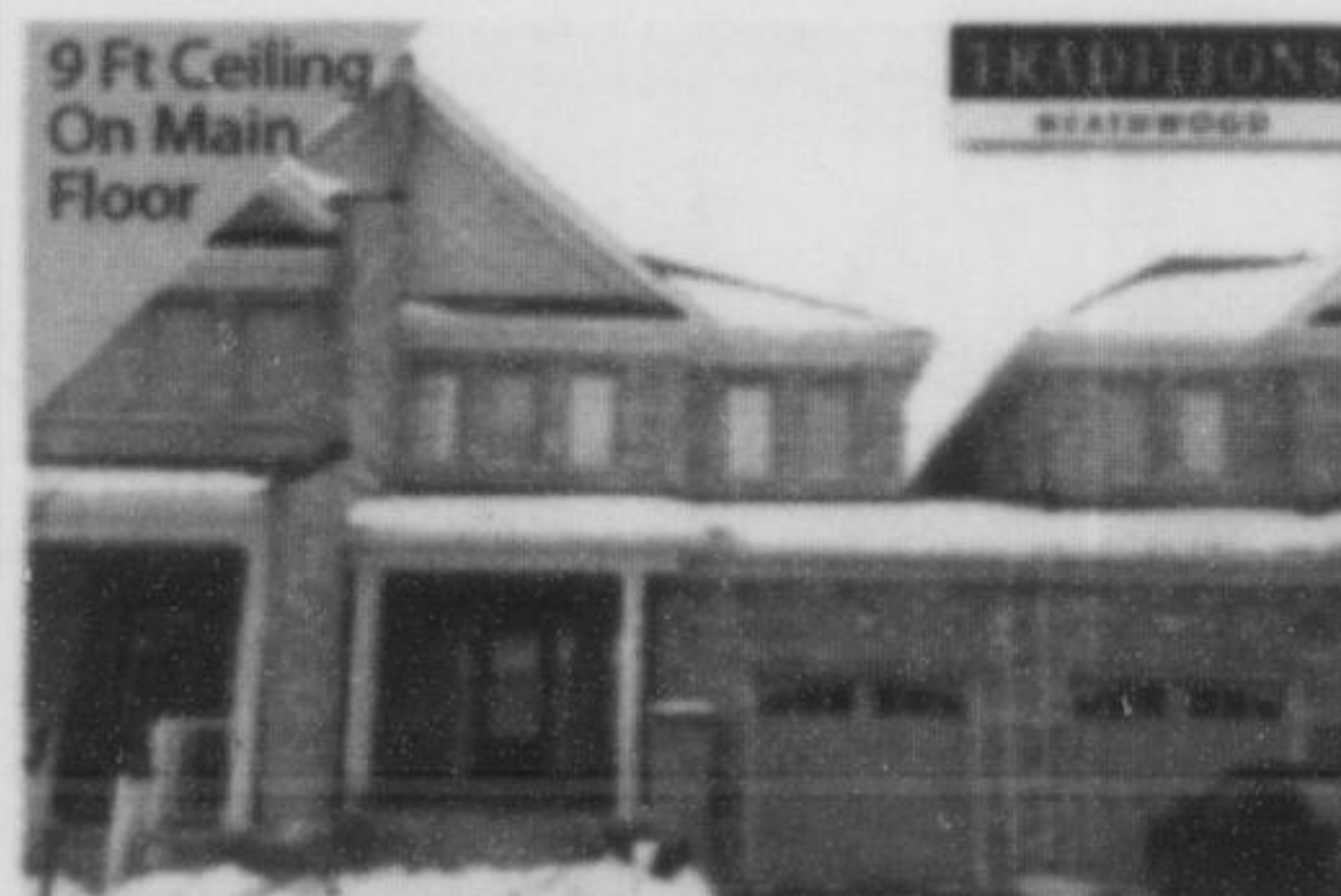
9 Ft Ceiling On Main Floor O/H Sat, Jan 19, 2-4 26 Forbes Terr $429,900 3 Bdrms • 3 Washrms • Meadowlark