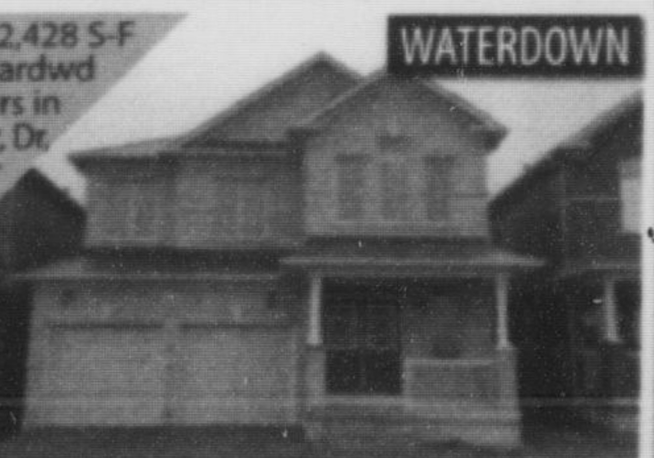
~2,428 S-F Hardwd Flrs in Lr, Dr, Fr O/H Sun, Jan 20, 2-4 145 Skinner Rd $549,000 4 Bdrms • 4 Washrooms • Cliffview 5