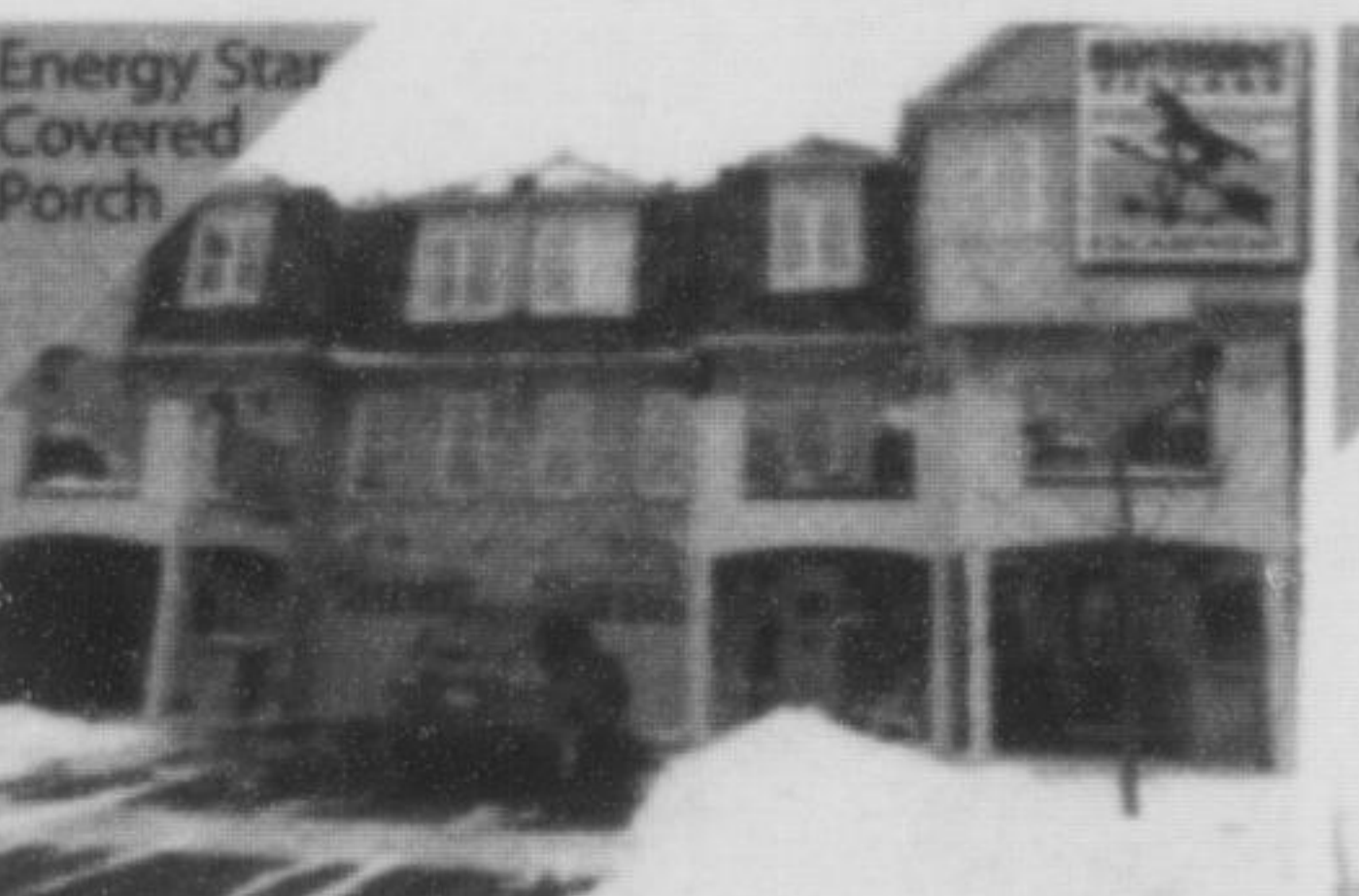
Energy Star Covered Porch O/H Sat, Jan 19, 2-4 495 Mcjannett Ave $314,800 2 Bdrms • 2 Washrms • Cherrywood