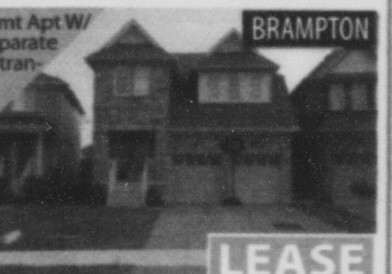
Bsmt Apt W/ Separate Entrance O/H Sun, Jan 20, 2-4 12 Tawnberry Circ $850/mo 1 Bdrms • 1 Washrm • Open Concept