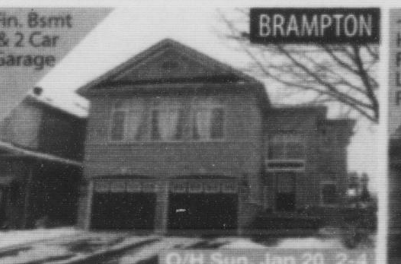
Fin. Bsmt & 2 Car Garage O/H Sun, Jan 20, 2-4 1 HillPath Crescent $539,000 4 Bdrms • 4 Washrooms • Detached