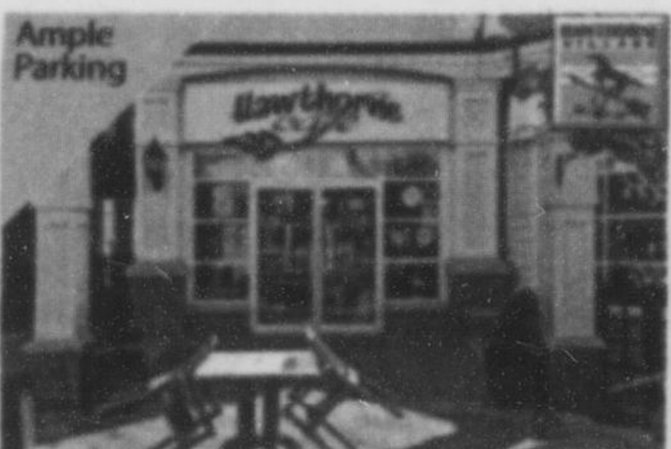
Ample Parking Established Business Opportunity 10220 Derry Rd