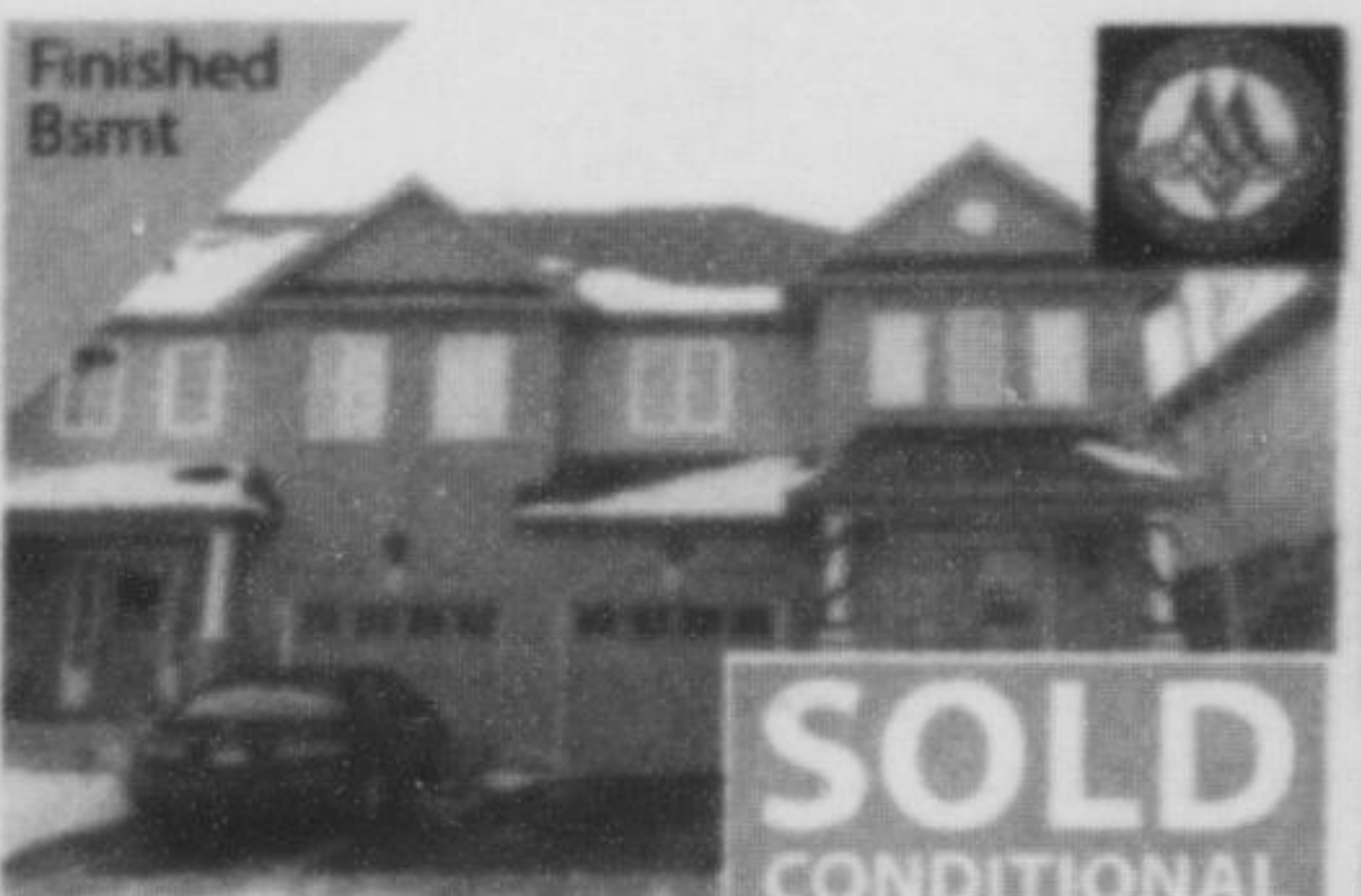
Finished Bsmt O/H Sat, Jan 19, 2-4 387 Hobbs Cres $394,900 4 Bdrms • 3 Washrms • Falcon Crest