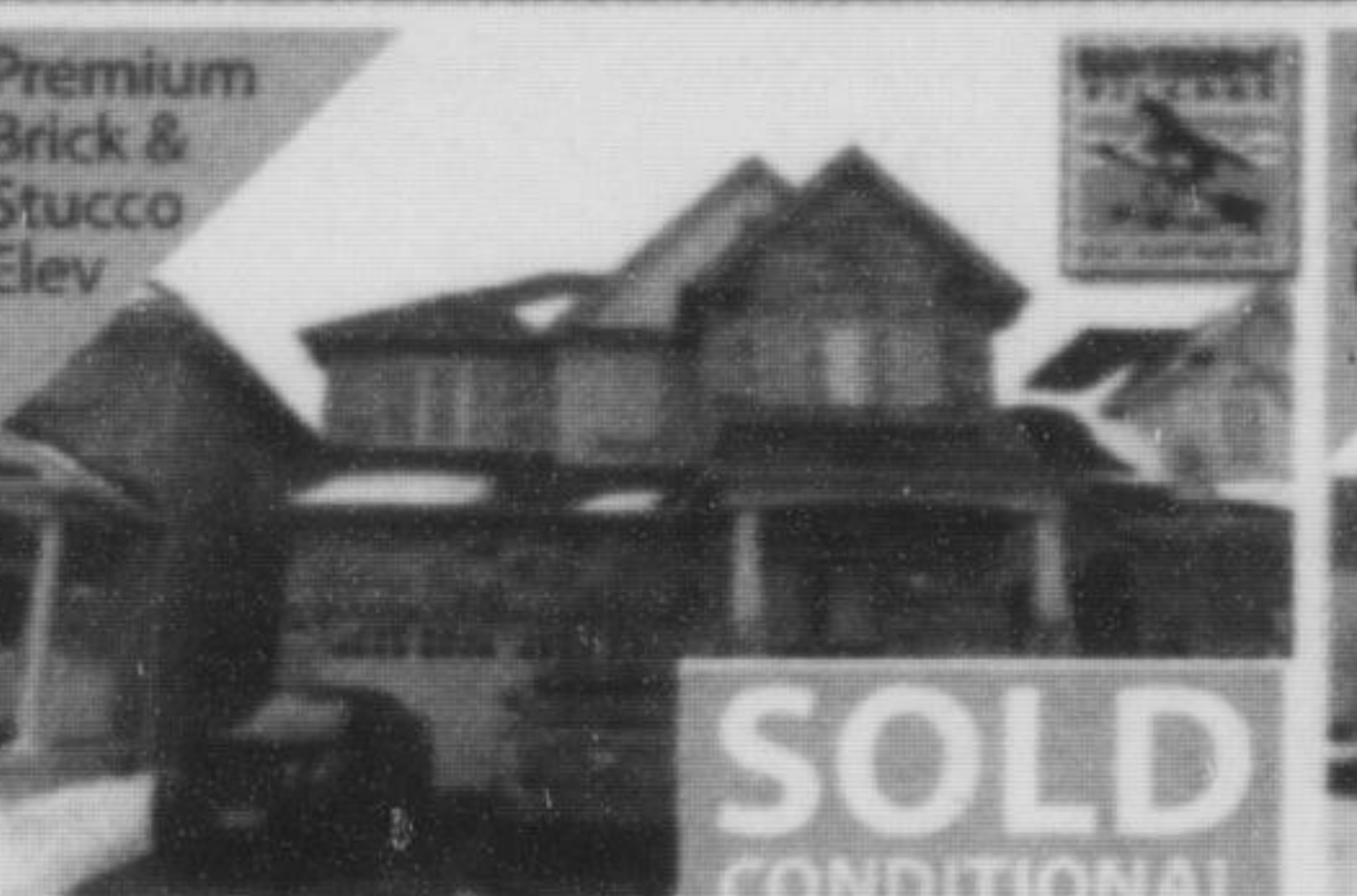
Premium Brick & Stucco Elev O/H Sun, Jan 20, 2-4 320 Mcdougall Cros $469,900 3 Bdrms • 3 Washrooms • Newport II