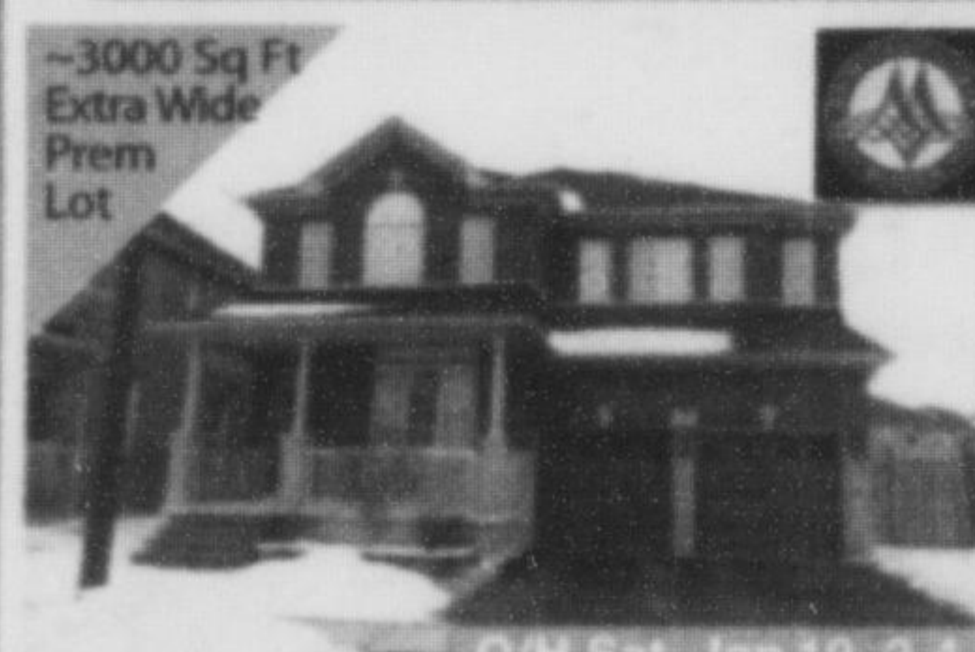
~3000 Sq Ft Extra Wide Prem Lot O/H Sat, Jan 19, 2-4 1147 Norrington Pl $629,900 4 Bdrms • 4 Washrooms • Belvedere