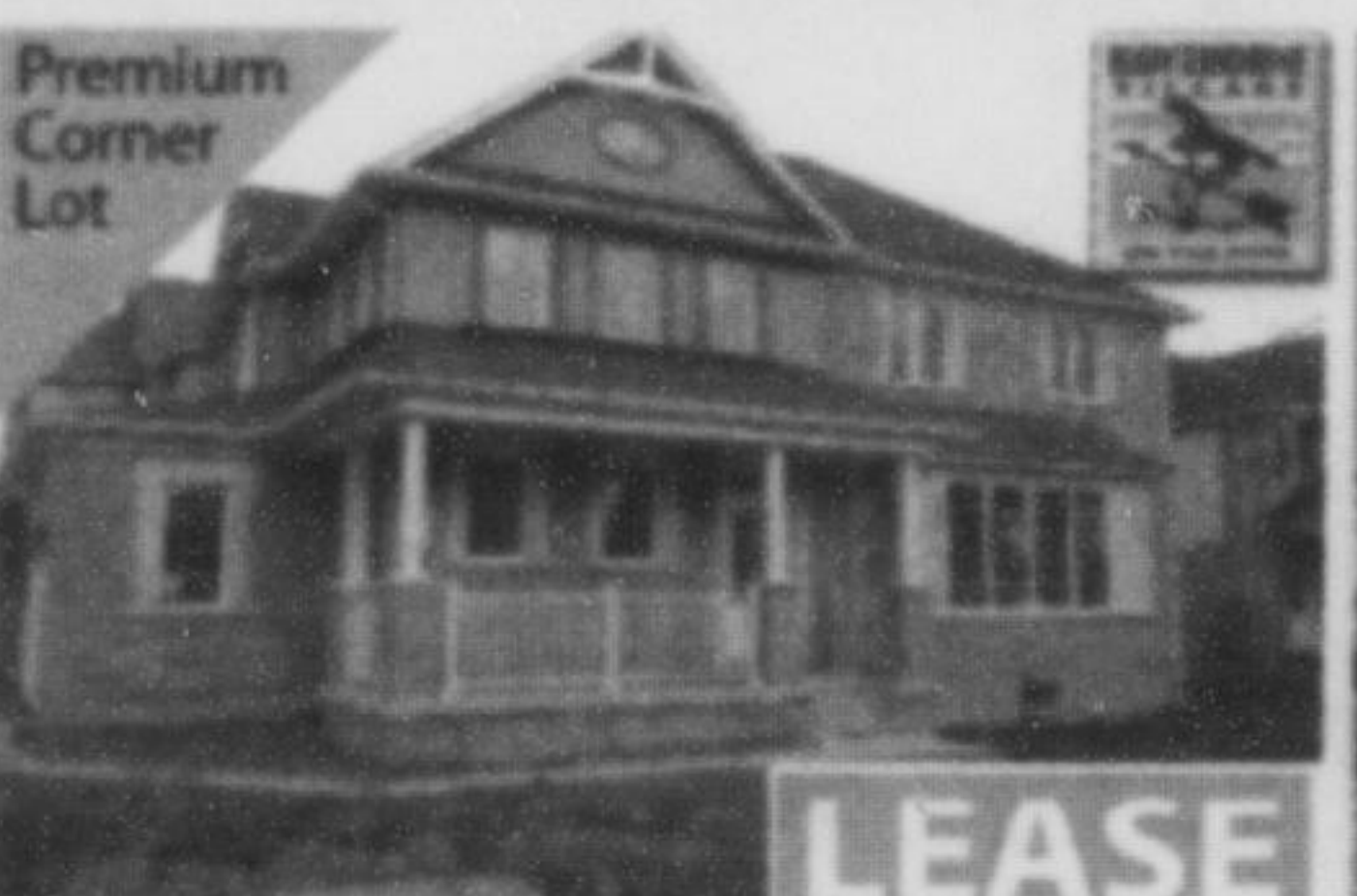
Premium Corner Lot O/H Sat, Jan 19, 2-4 476 Leiterman Dr $1,800/mo 4 Bdrms • 3 Washrooms • Mattamy