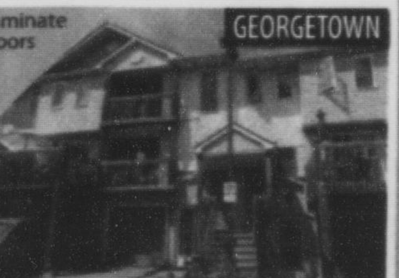
Laminate Floors O/H Sun, Jan 20, 2-4 12A Wylie Circ $184,900 2 Bdrms • 1 Washroom • Townhome