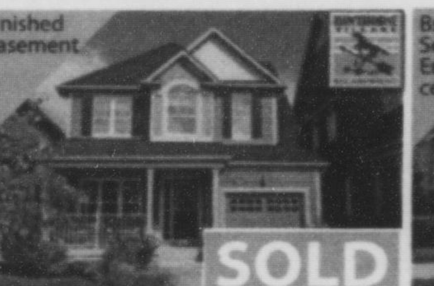
Finished Basement O/H Sun, Jan 20, 2-4 961 Savoline Blvd $446,000 3+1 Bdrms • 4 W/rms • Honeysuckle