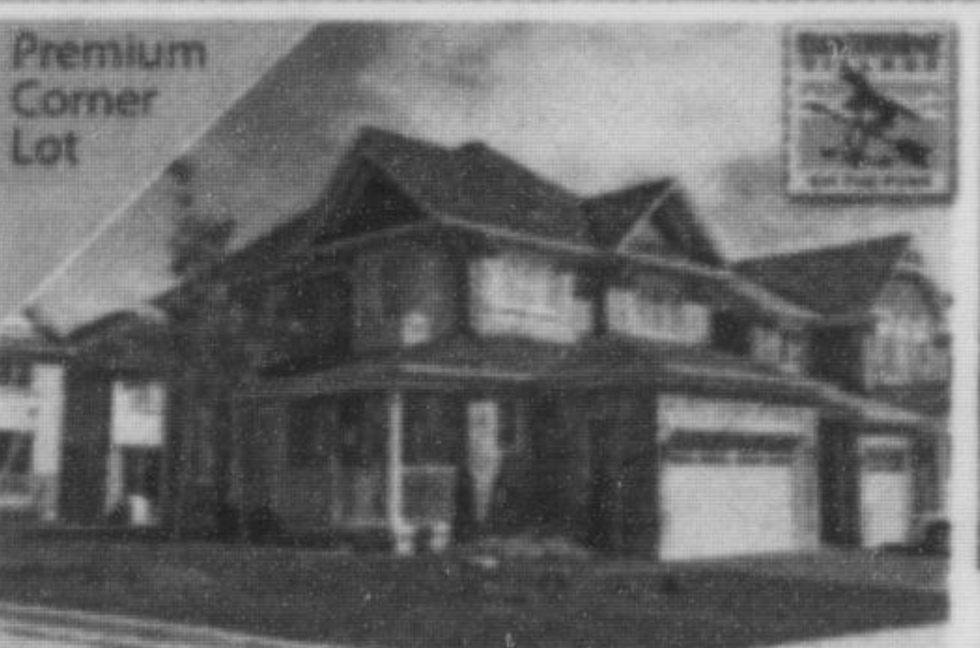
Premium Corner Lot O/H Sat, Jan 19, 2-4 901 Dice Way $484,900 3 Bdrms • 3 W/rms • 30' / Plan 5 Crnr