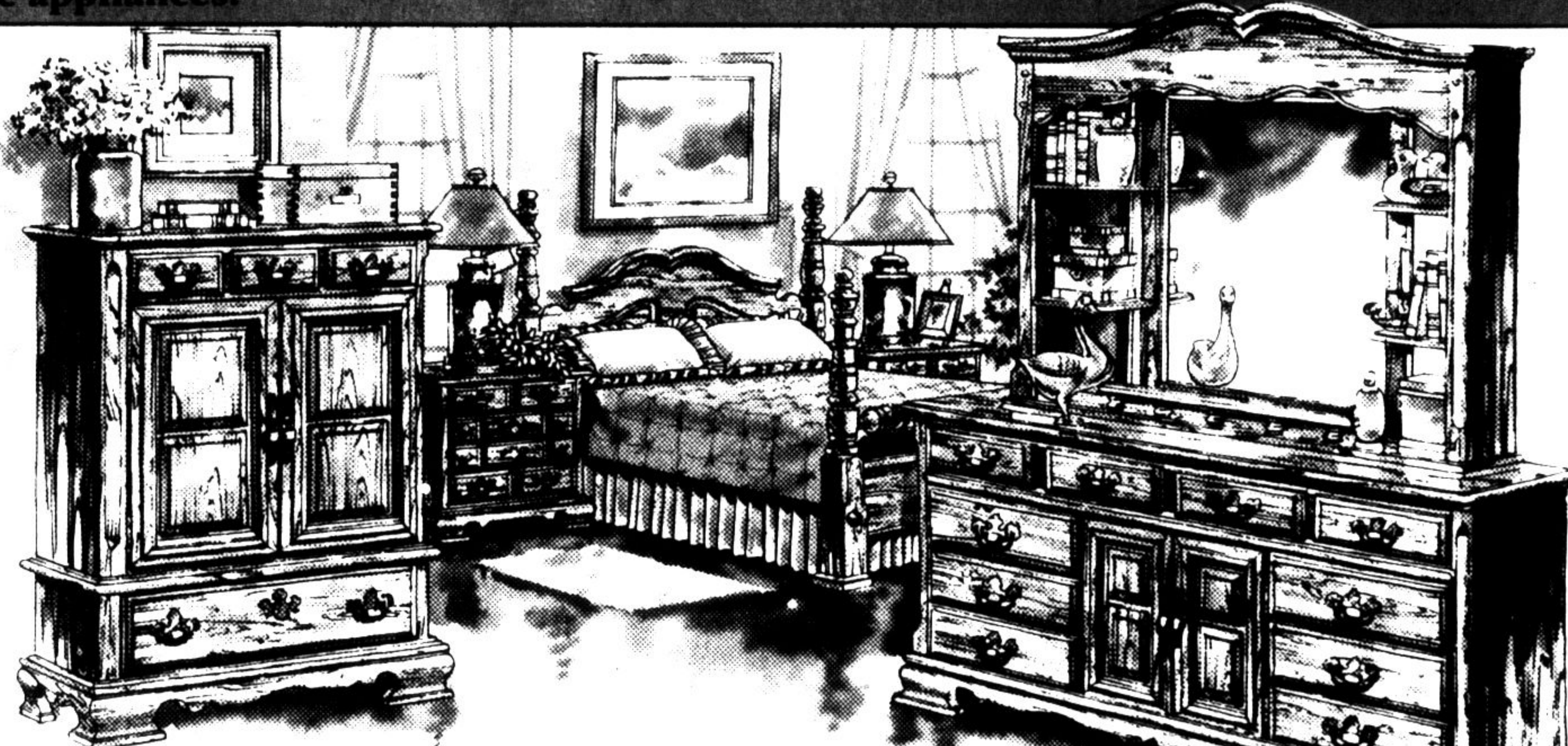
Night tables each $249.

Beautifully distressed honey pine finish, bright brass hardware accents, and the meticulous attention to detail