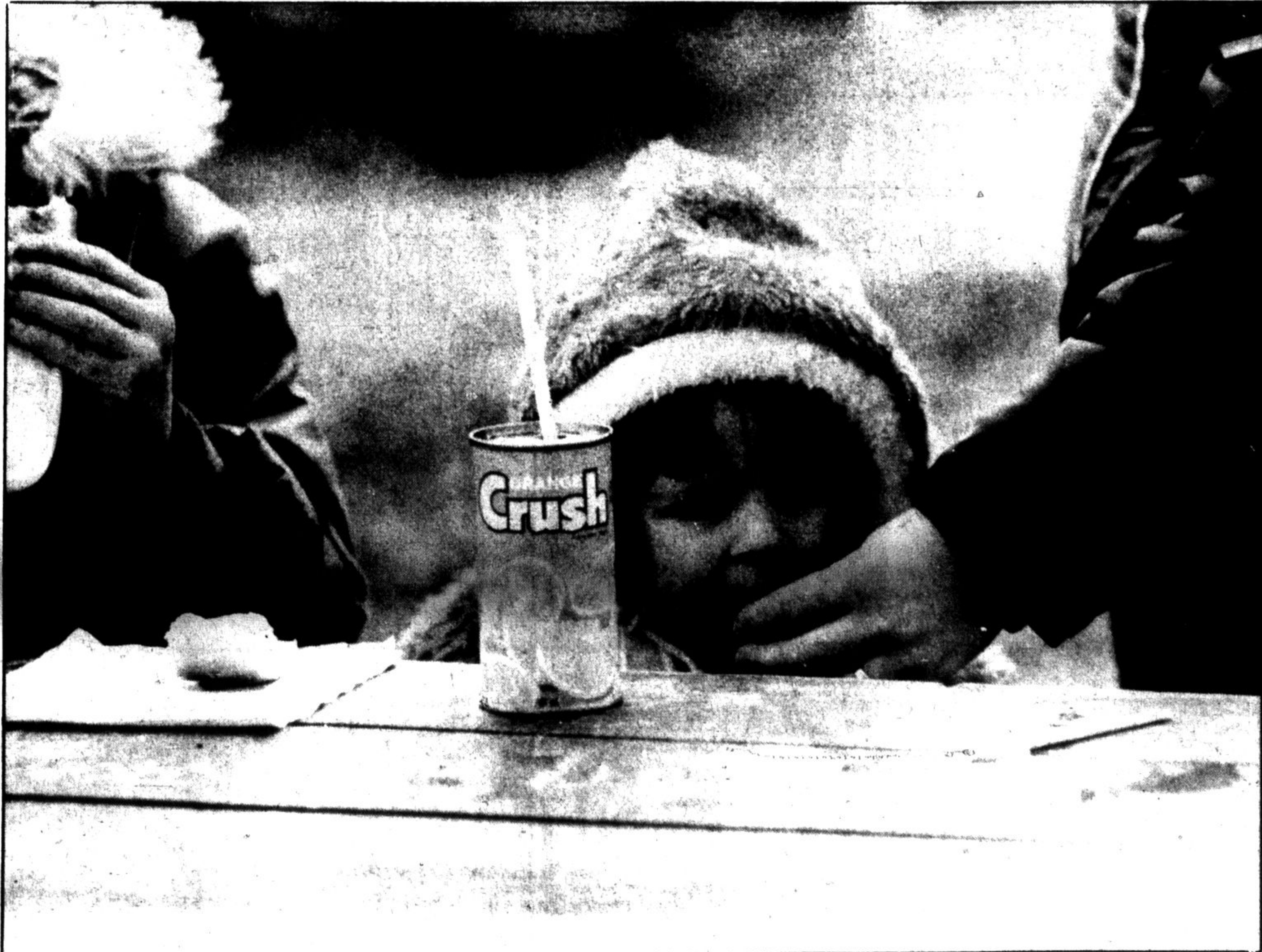
Hot dogs were the order of the day at least for this youngster who needed a hand with her lunch.