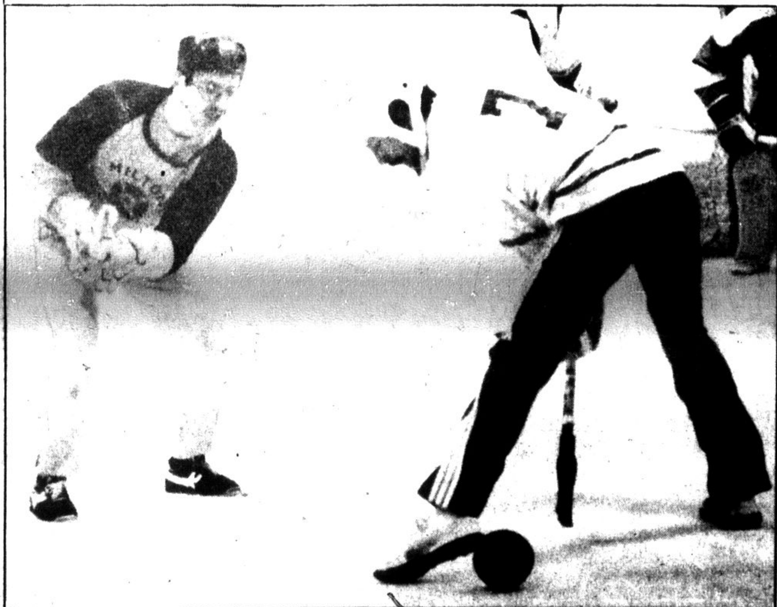
One of the most popular events of the weekend was the broomball bash Saturday.