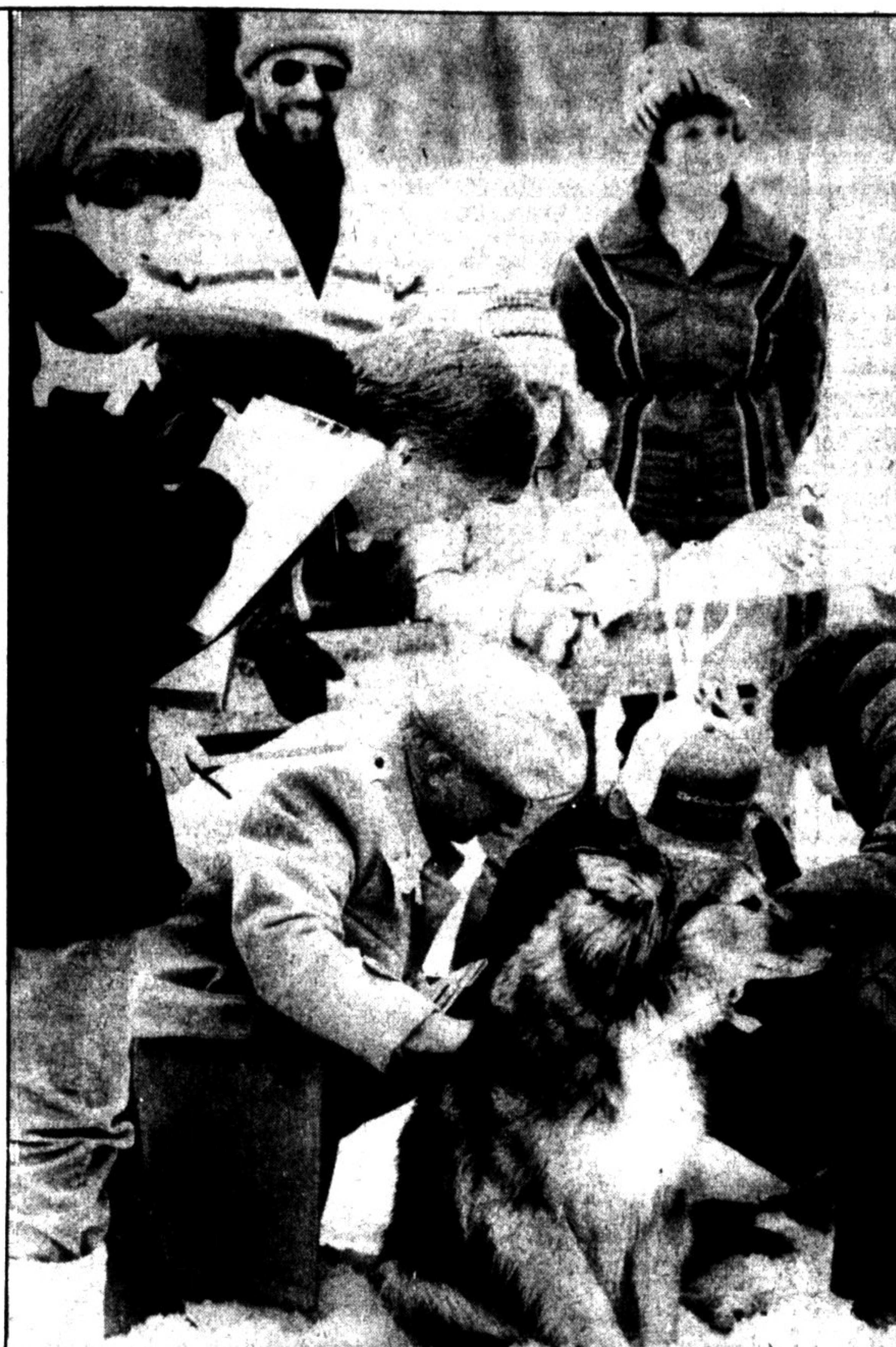
Not a hair escaped the watchful eyes of judges at the mutt show.

It was something more akin to a spring carnival with unseasonably warm temperatures which did nothing but draw the crowds.