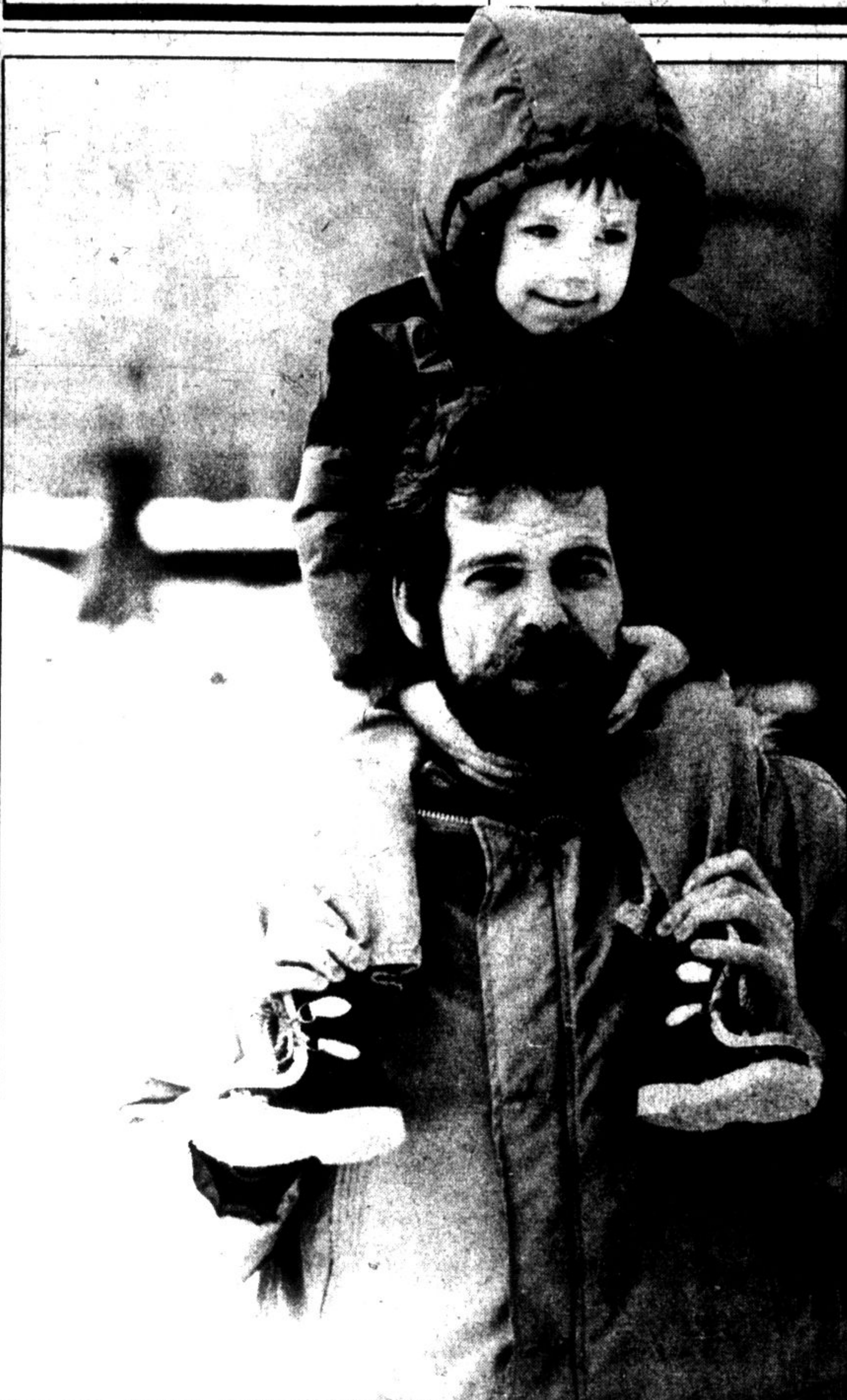
This young man is sporting a smile which was the look of the weekend for carnival participants.