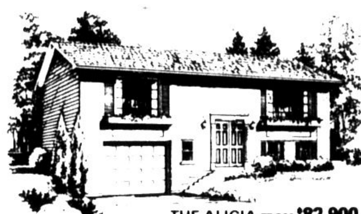
THE ALICIA FROM $82,900.

EXTRAORDINARY FEATURES INCLUDED IN YOUR HOME