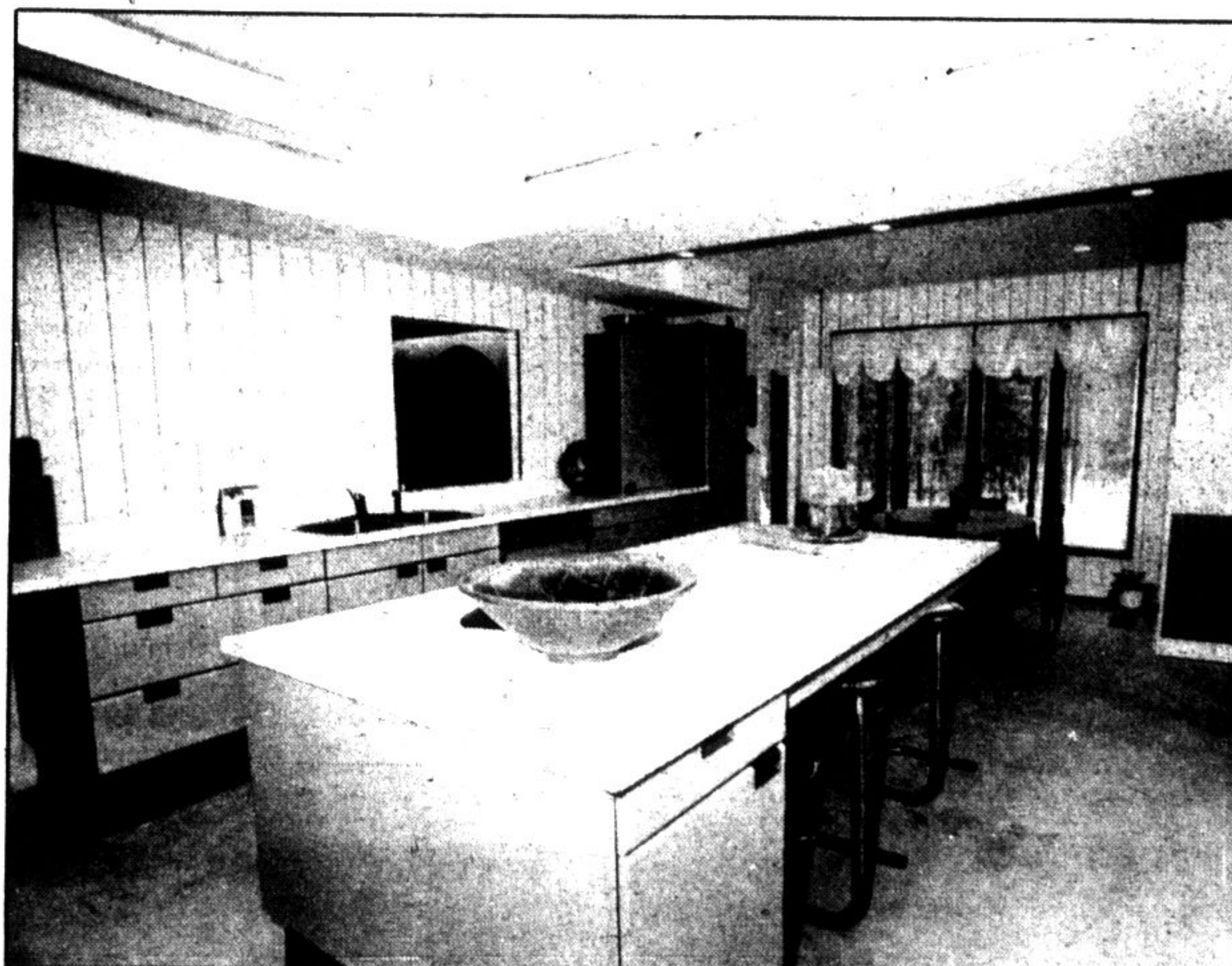
Modern is the word to describe the spacious kitchen. It features an eating area flanked by large windows.