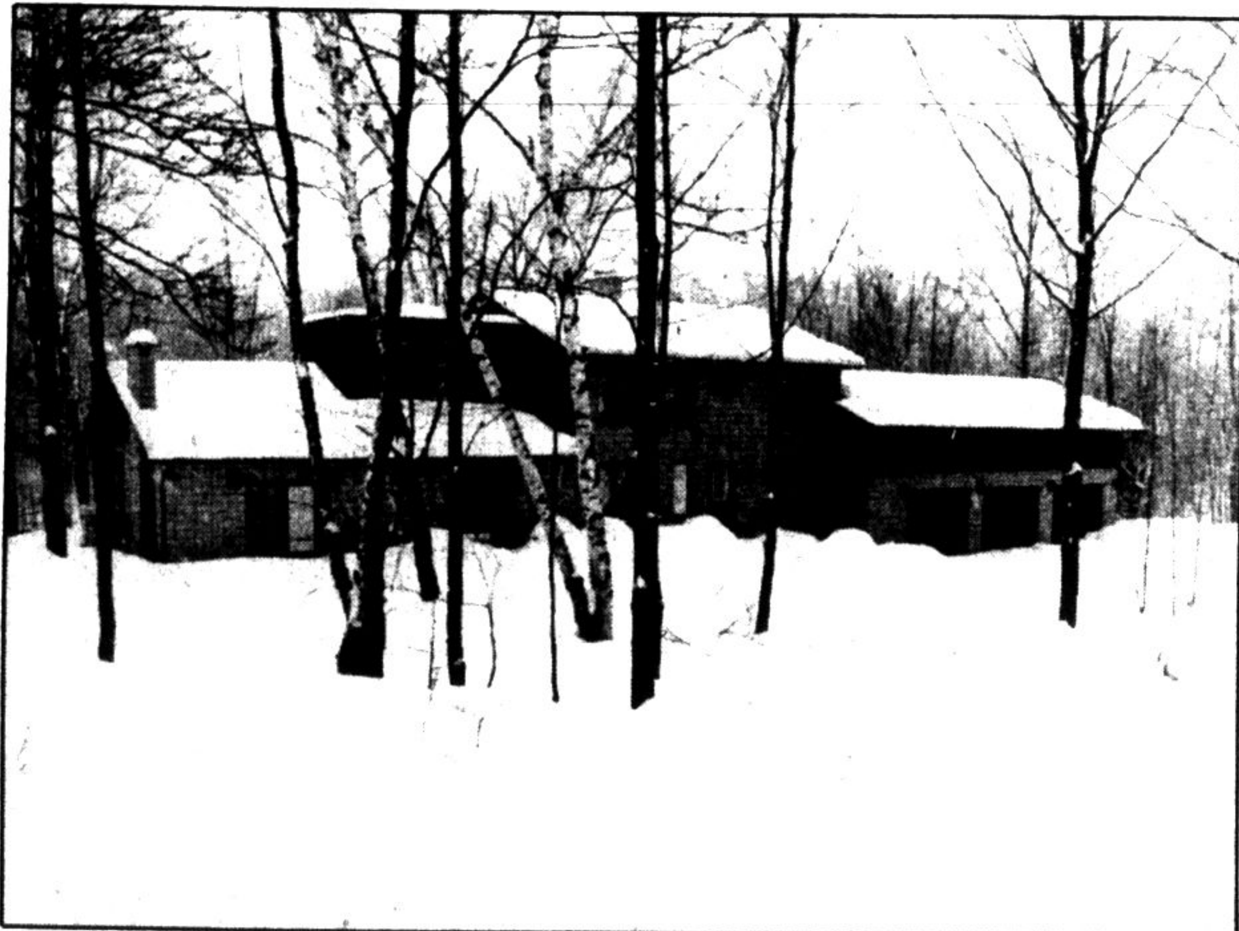
A rural setting enhances this extra-large home located in a grove of mature trees.

miltowne realty corp. 22 ontario st. s. milton, ont. 878-2365