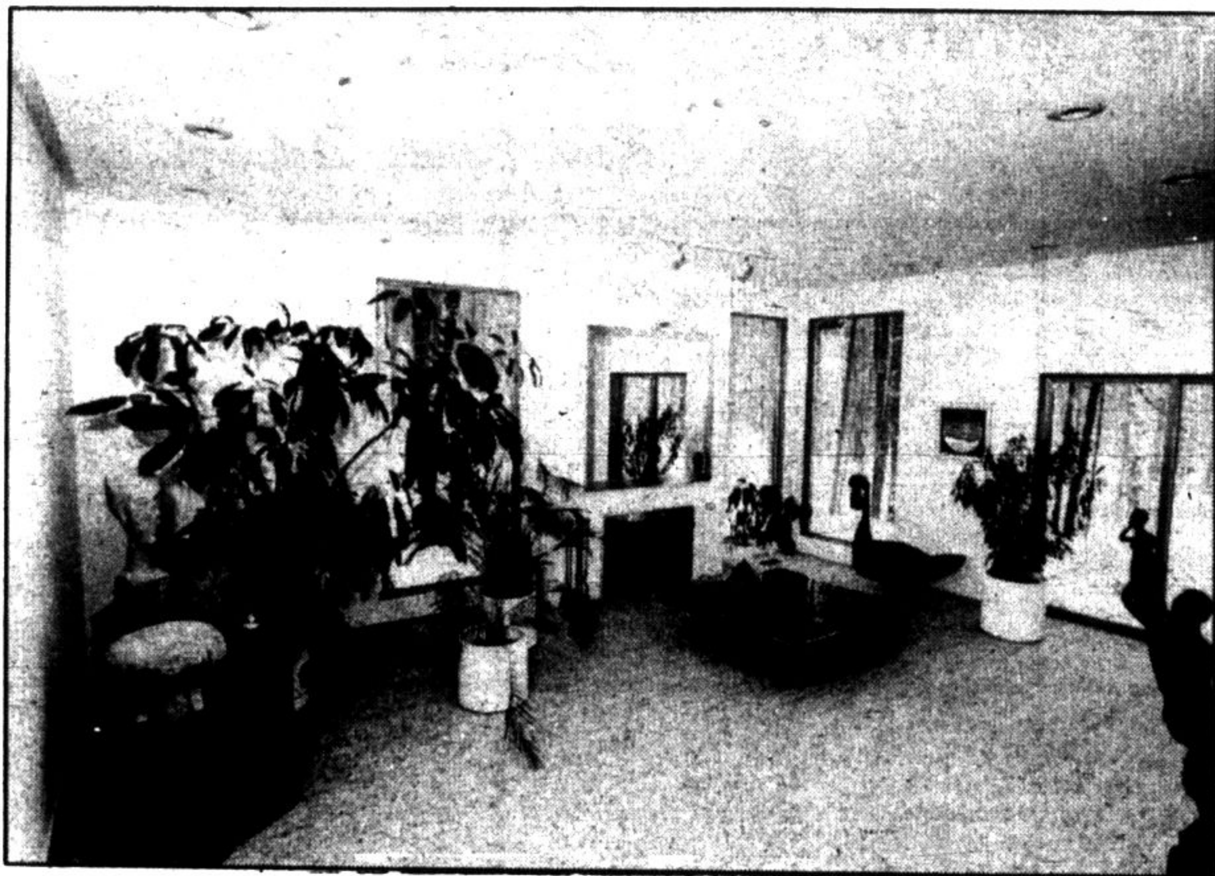
Large windows provide a picture perfect view of the lot from the living room.