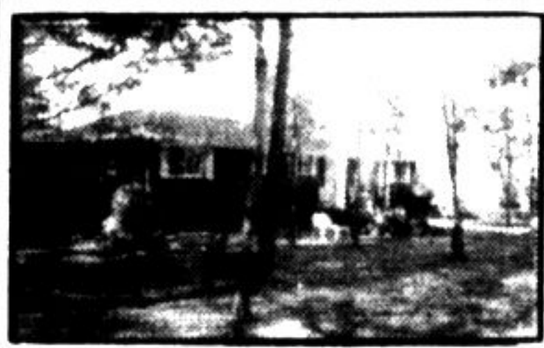
OPEN HOUSE SUN. 25th NOV. 1-5 p.m.

Looking for that special country home that has everything? Come see this one on 18 acres plus 36'x36' brick stable/heated workshop. Take Hwy. no. 401 to Hwy. no. 25 north to 15th side Rd. west to 6th line north on 6th line between 20th and 25th Side Rd. For details call Carole Stonhill or 878-8101.