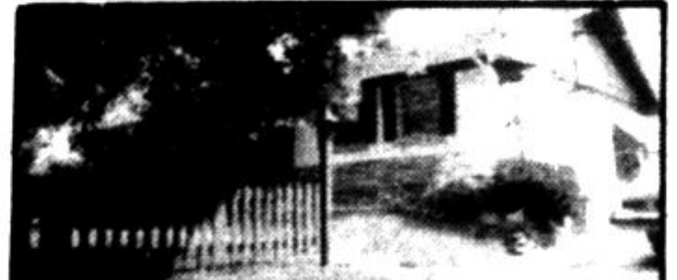
BURLINGTON DELIGHT Extras incl. split level, range in kit., upgraded broadloom throughout, Florida rm. Call now! $129,900. 82