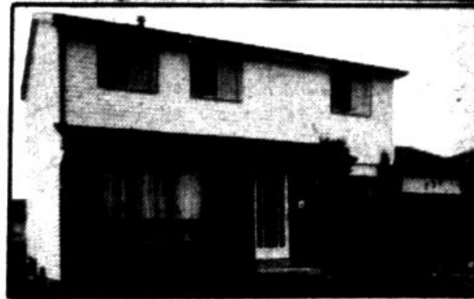
Terrific 2 storey offering 4 bdms., walk-out from kitchen and more! $79,900. 49