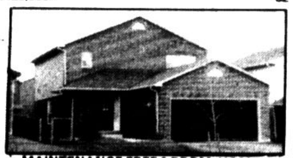
MAINTENANCE FREE 3 BDRM. HOME Tastefully finished with upgraded broadloom and ceramic tiles. Won't last! $101,900. 91