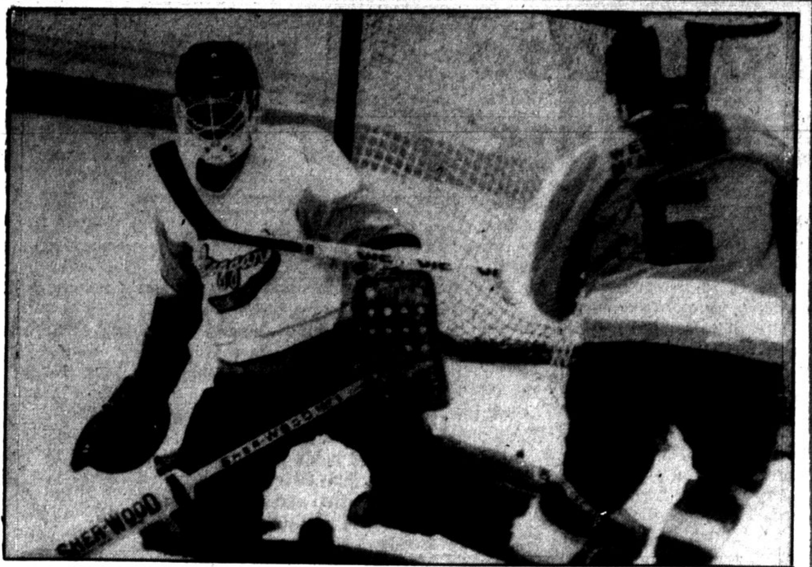
Such was the fate of West End Bulls Sunday as even golden opportunities like this failed. B.W. Haggart denied Bulls their first win of their two-year history in the Milton Hockey League with a 4-3 win.

Notes: There are no games scheduled for Sunday in light of the Grey Cup football game.