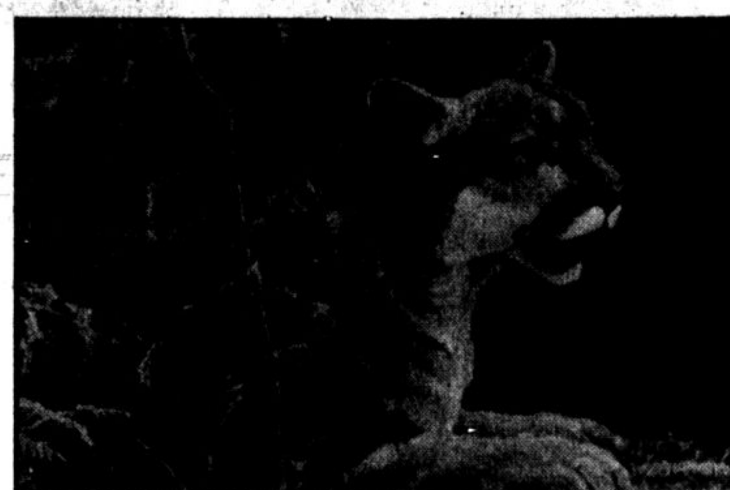
950 s/n COUGAR PORTRAIT by Robert Bateman $130.00