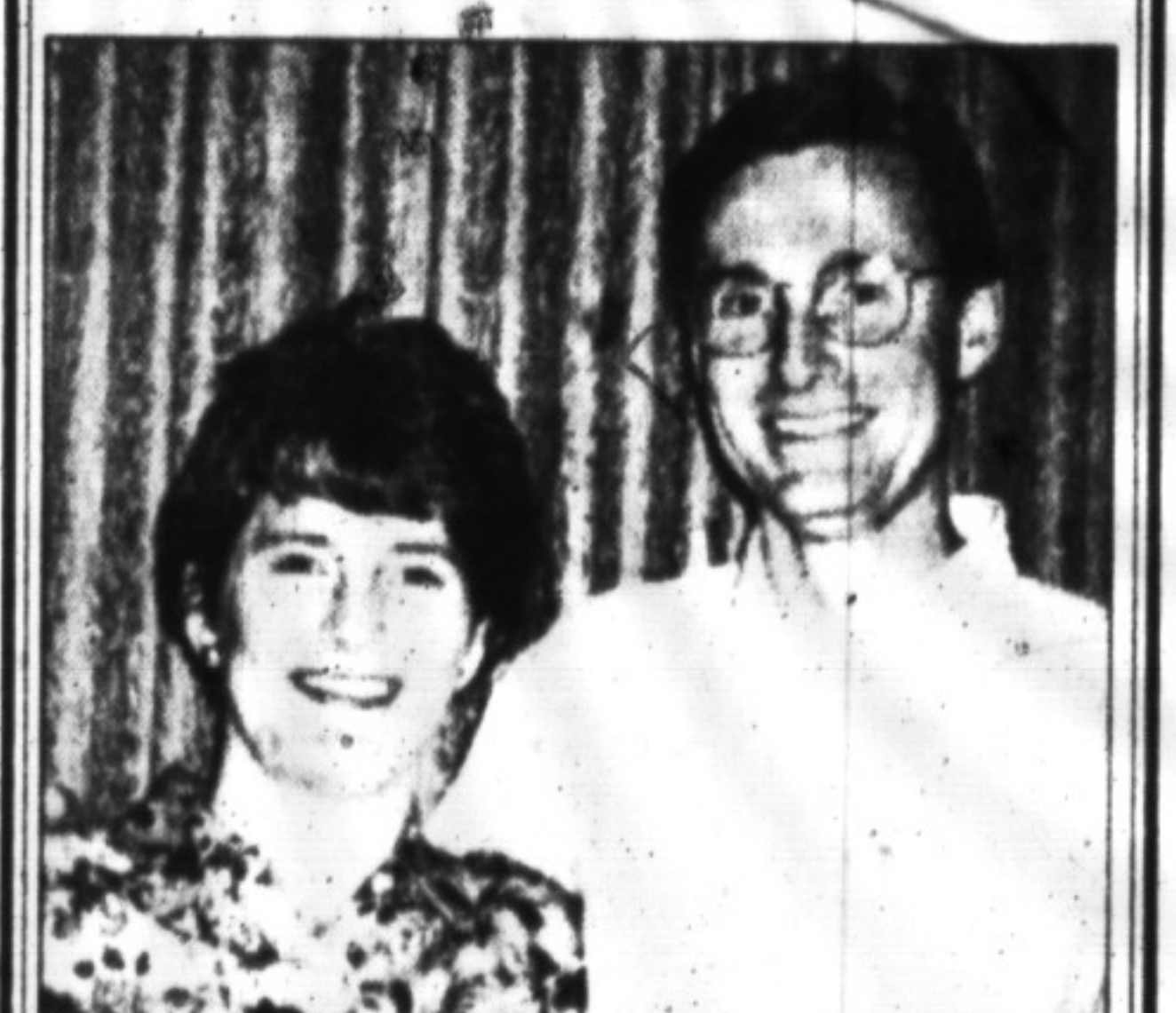
Wedding to take place on August 23, 1997 at St. Paul's United Church, Milton