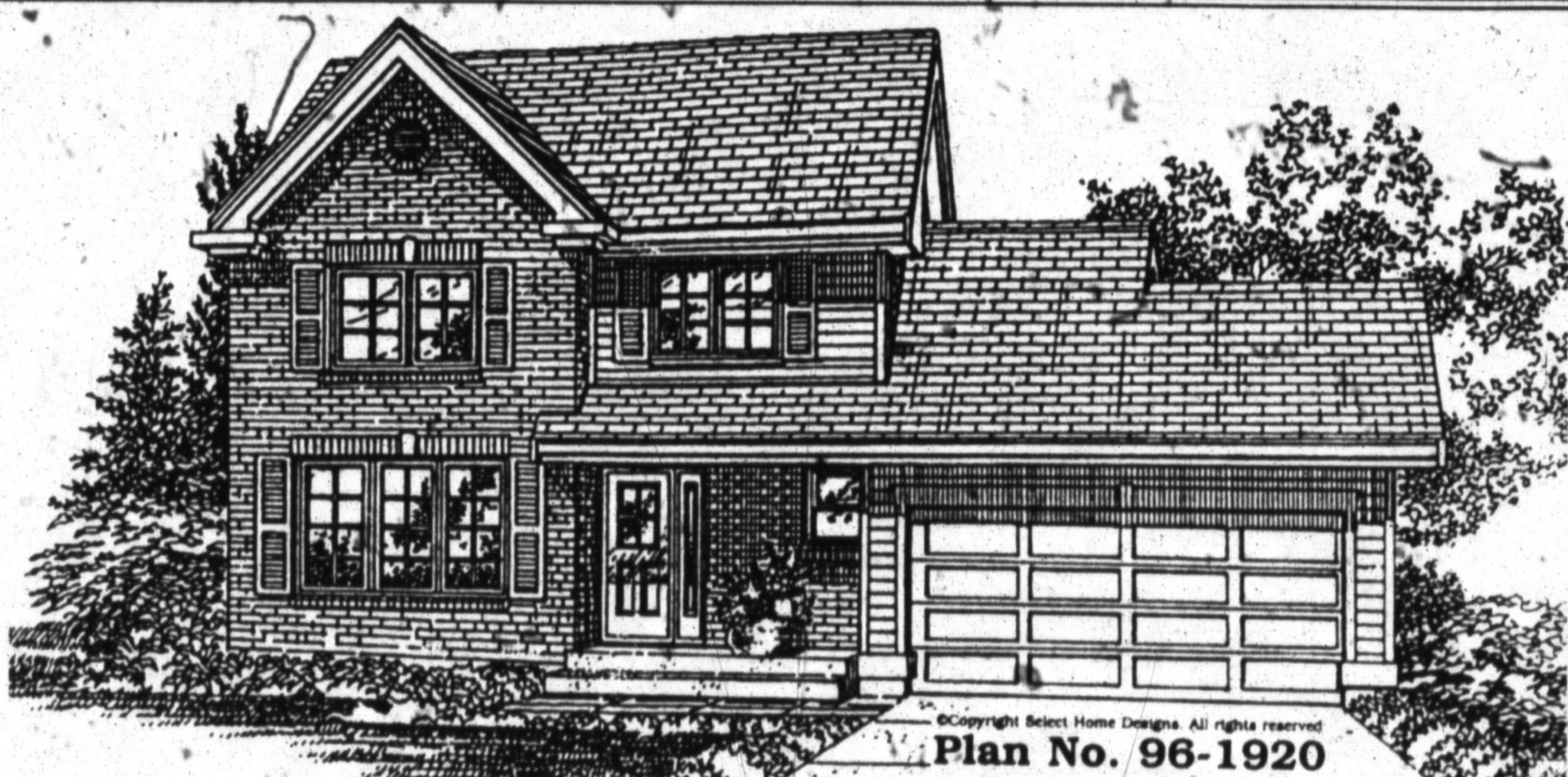
Plan No. 96-1920