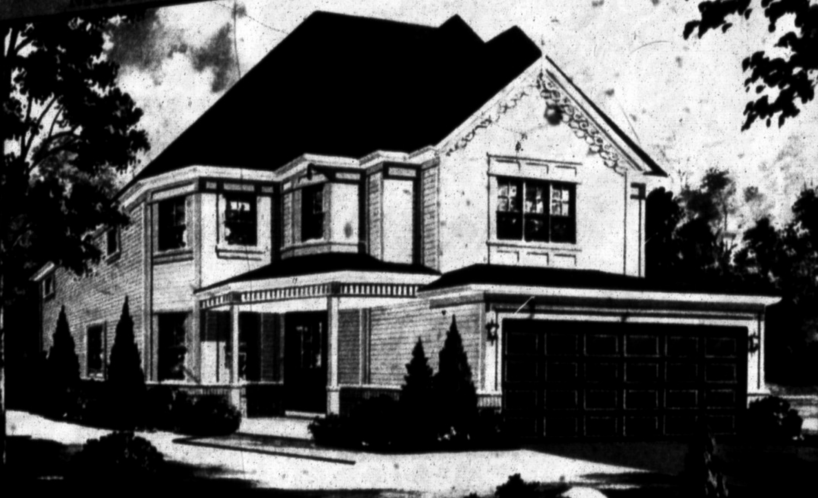
The Birchwood Elev. B 2,225 sq. ft.

Be first to feel the magic of three stunning new Kaneff Model Homes in a beautifully established Waterdown neighbourhood