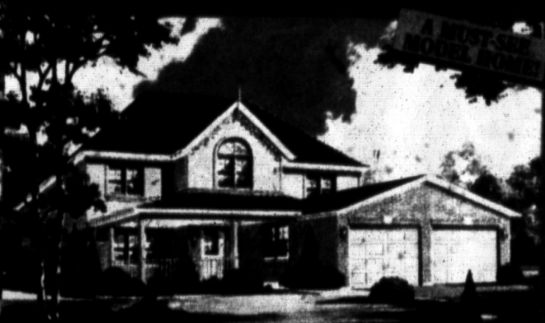
The Cypress Elev. A 1,815 sq. ft.

FULLY DETACHED HOMES FROM $184,900* GST INCLUDED