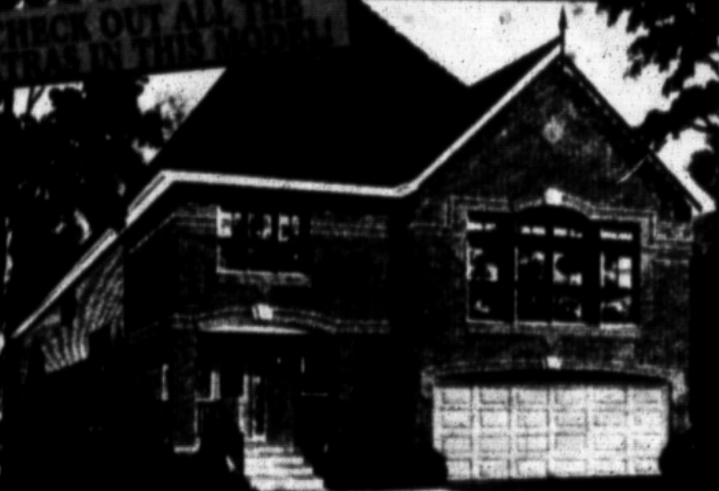
The Chestnut Elev. C 2,025 sq. ft.