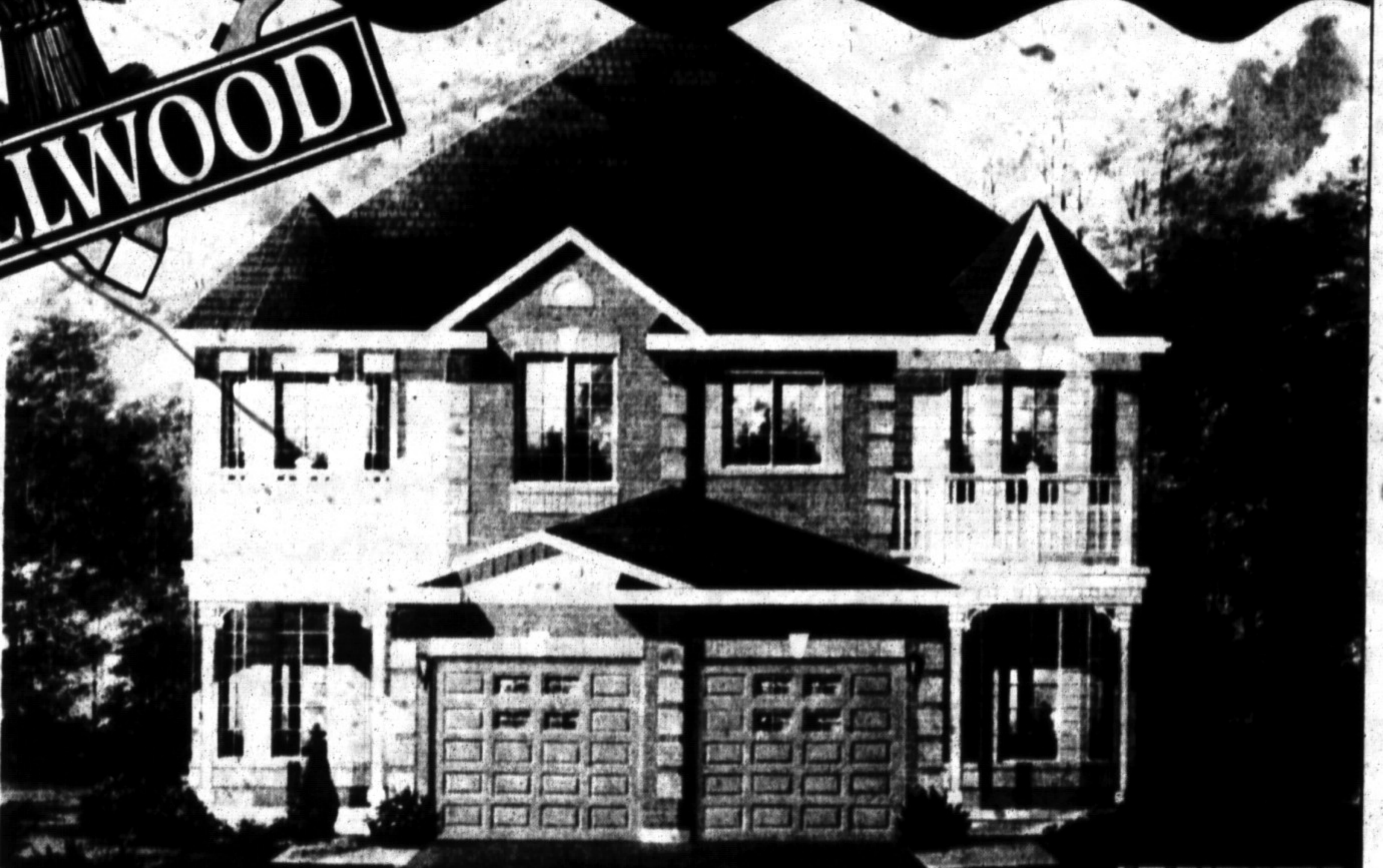
The Genlake 1512 sq. ft.

COME AND SEE BURLINGTON'S BEST NEW VALUE!