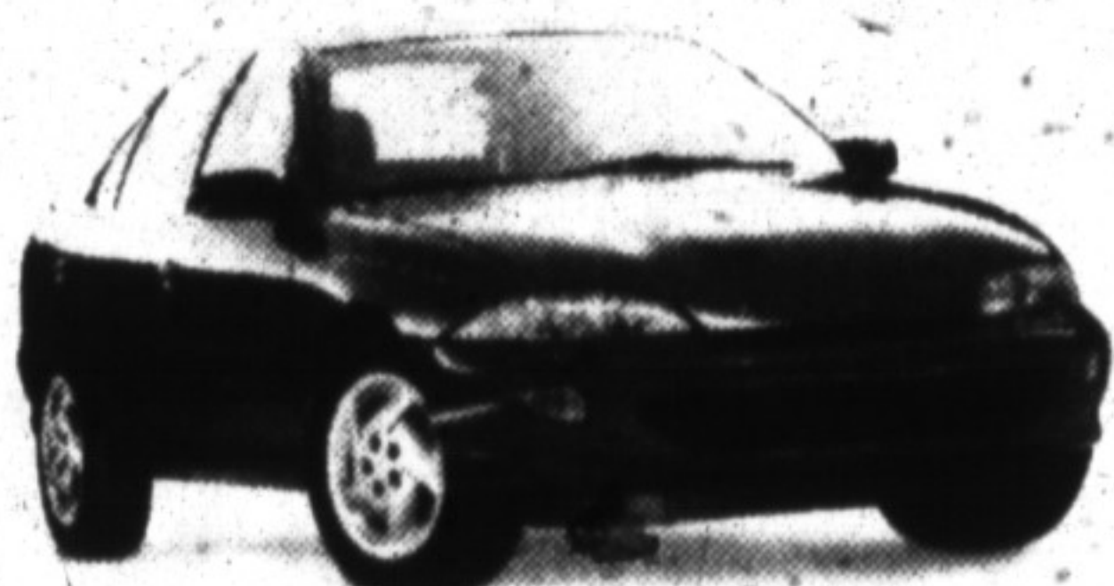
Chevrolet Cavalier Sedan (Canada's #1 Selling Car)