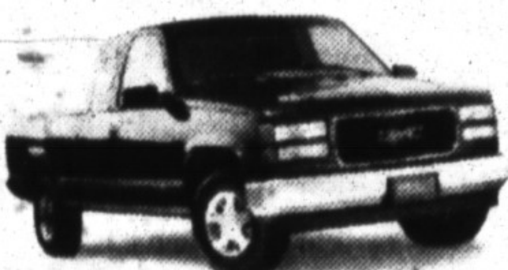
GMC Extended Cab