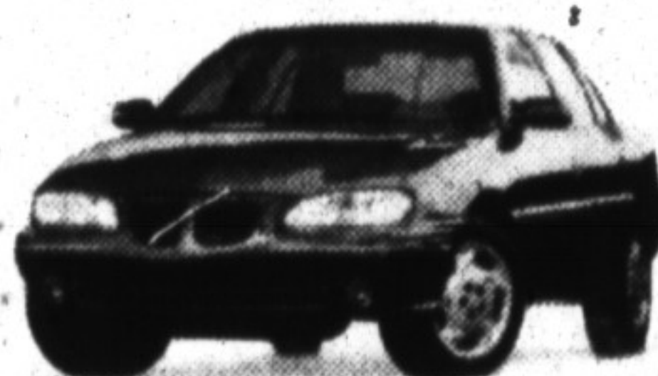
Pontiac Grand Am Sedan