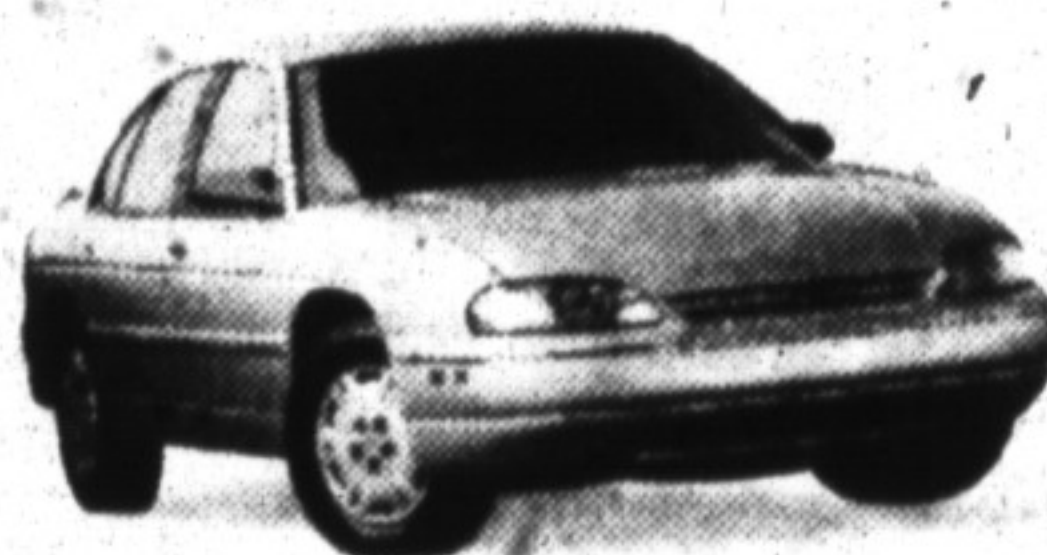
Chevy Lumina Sedan