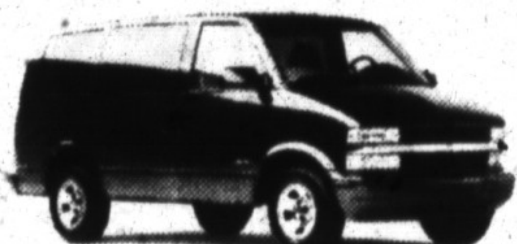
Chevy Astro Van

Get 3.9% Value Financing on ALL '96 and '97 GM vehicles in stock.