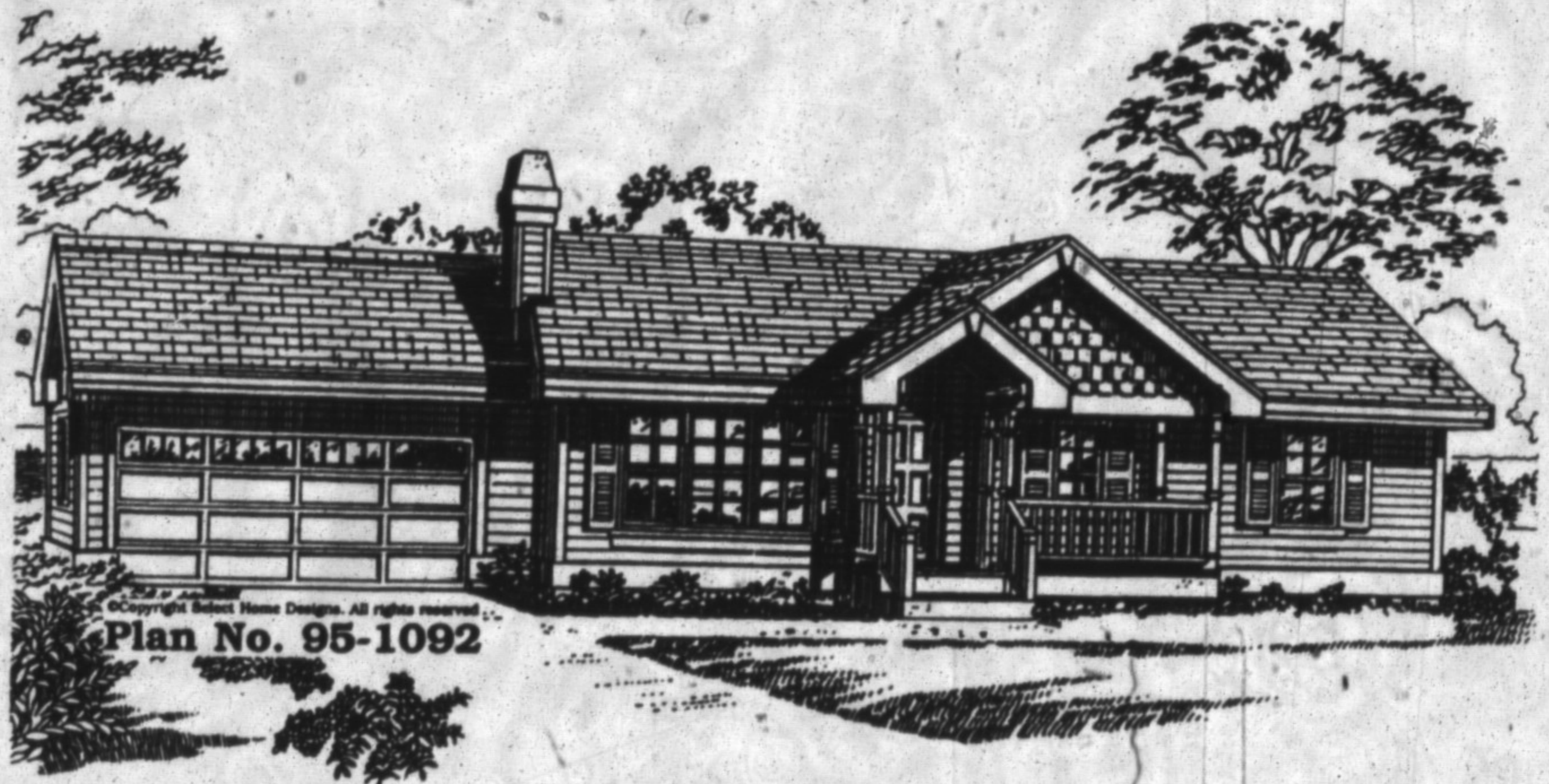
Plan No. 95-1092

To receive a 300-page plan book for only $9.95 (including shipping and GST) featuring this design and more than 400 other beautifully illustrated home and cottage designs, call toll-free 1-800-663-6739, fax (604) 251-3212, or e-mail to: selecthomedesigns@msc.com. (specify The Canadian Champion). We accept VISA / MasterCard / AMEX. For payment via cheque or money order, make payable to Design for Living, c/o The Canadian Champion, send to #301, 611 Alexander Street, Vancouver, B.C., V6A 1E1.