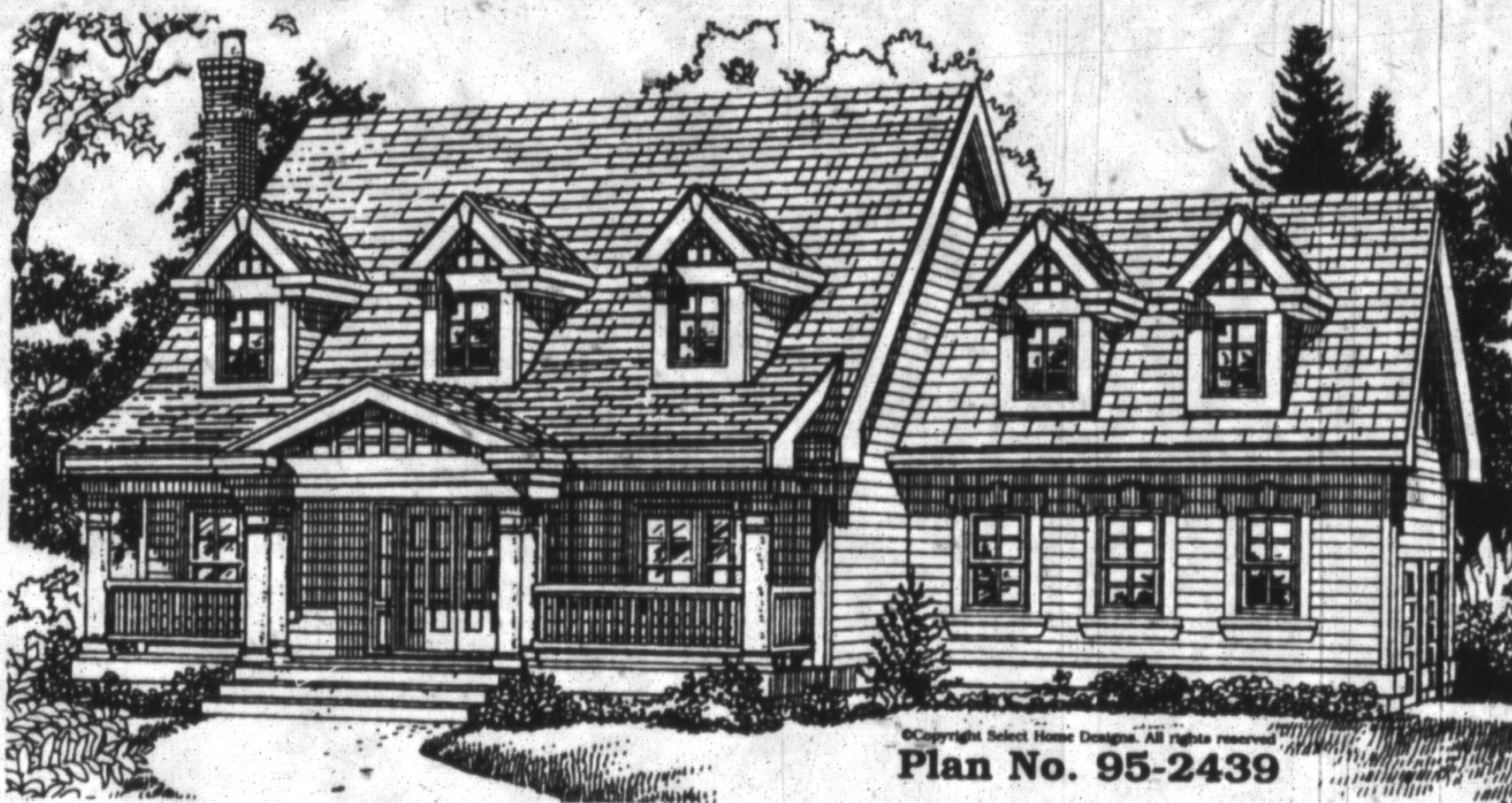
Plan No. 95-2439

To receive a 300-page plan book for only $9.95 (including shipping and GST) featuring this design and more than 400 other beautifully illustrated home and cottage designs, call toll-free 1-800-663-6739, fax (604) 251-3212, or e-mail to: selecthomedesigns@msc.com. (specify The Canadian Champion). We accept VISA / MasterCard / AMEX. For payment via cheque or money order, make payable to Design for Living, c/o The Canadian Champion, send to #301, 611 Alexander Street, Vancouver, B.C., V6A 1E1.