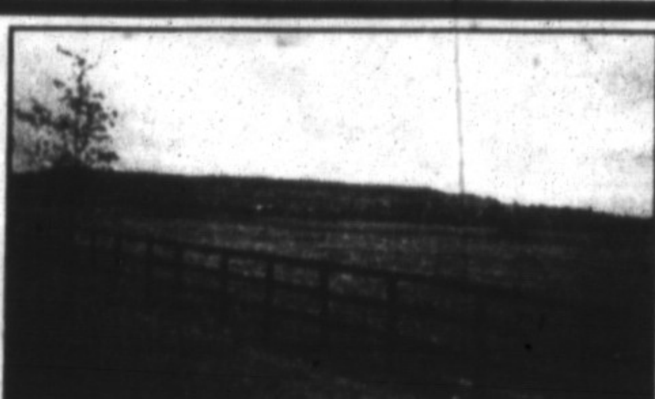
Country, near Milton $229,900

Close to Milton and 401, located opposite beautiful horse farm. 4 bedroom home. Immaculate condition, large eat-in kitchen, finished basement. Addition suitable for in-law suite or main floor family room. Large double car garage. Lot size 134' x 204'. Check it out! John Weide 844-5000