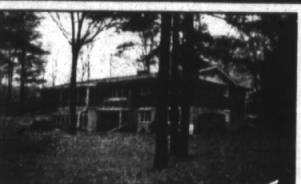
Campbellville Country ~ 10 Acres

Quality constructed ranch, close to Bruce Trail and Crawford Lake on scenic Escarpment property. 2 fireplaces, Beckermann kitchen, main floor privacy solarium, ground level family room, den. Parquet floors, many quality upgrades. Beautifully decorated, move right in! Nothing to do. Circle this new listing. $339,900. Call John Weide 844-5000