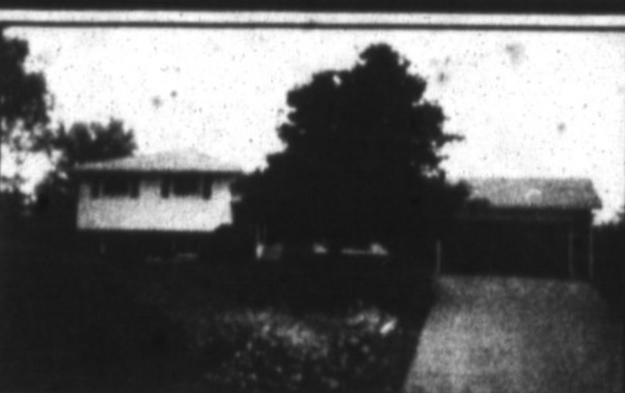
Country, Third Line $212,000

Large well-built, 3 bedroom sidesplit with sliding doors from family room, nicely treed and landscaped, enjoy the scenic views. Rural setting, exceptional value. Call John Weide 844-5000