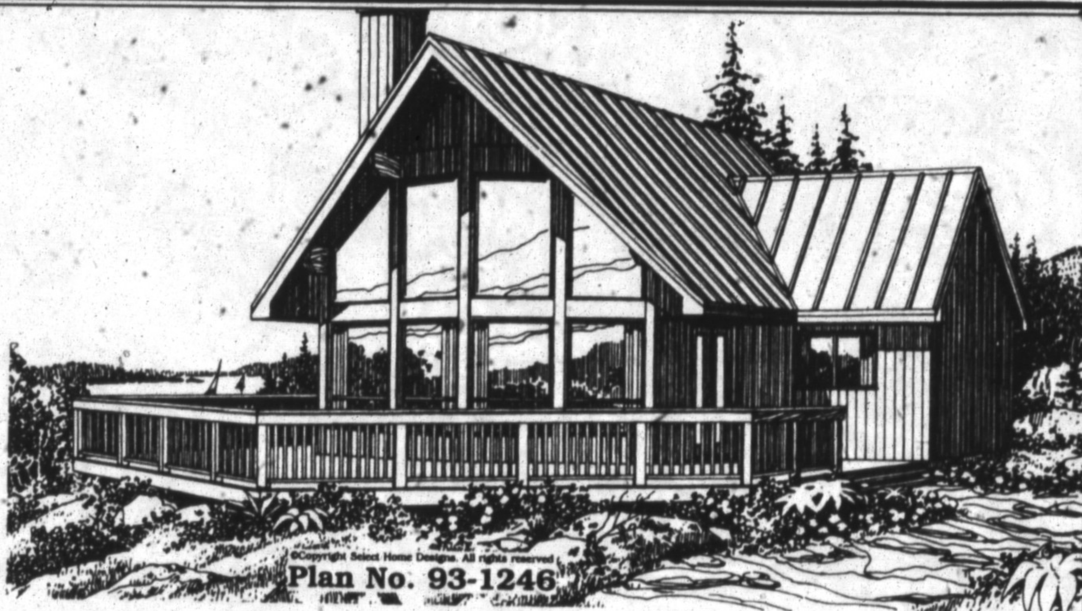
Plan No. 93-1246

To receive a 300-page plan book for only $9.95 (including shipping and GST) featuring this design and more than 400 other beautifully illustrated home and cottage designs, call toll-free 1-800-663-6739, fax (604) 251-3212, or e-mail to: selecthome-designs@msc.com. (specify The Canadian Champion). We accept VISA / MasterCard / AMEX. For payment via cheque or money order, make payable to Design for Living, c/o The Canadian Champion, send to #301, 611 Alexander Street, Vancouver, B.C., V6A 1E1.