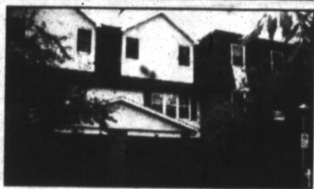
Townhome Milton Only $118,900

Future industrial land. Just north of 401 on Third Line in Milton. 2.08 acres of valuable land together with solid built brick bungalow, well maintained, separate barn, excellent potential, many uses. Call John Weide 844-5000