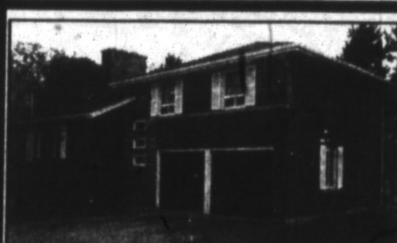
Country Home $256,960

Large well-built, 3 bedroom sidesplit with sliding doors from family room, nicely treed and landscaped, enjoy the scenic views. Rural setting, exceptional value. Call John Weide 844-5000