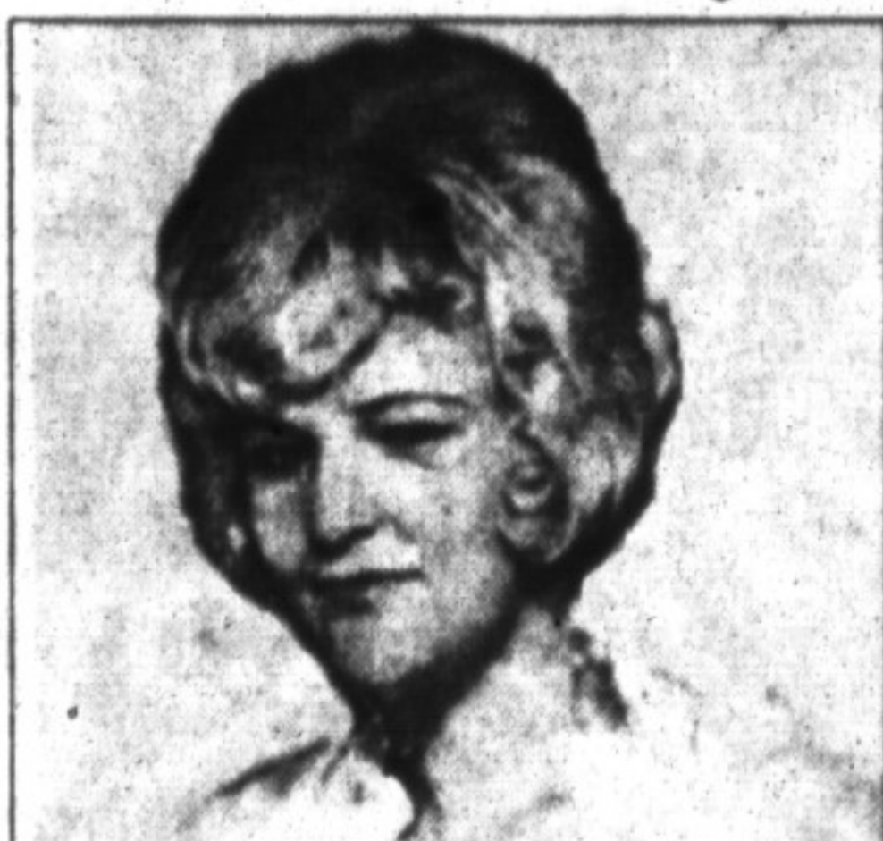
With Lots of Love Always The Demus Family