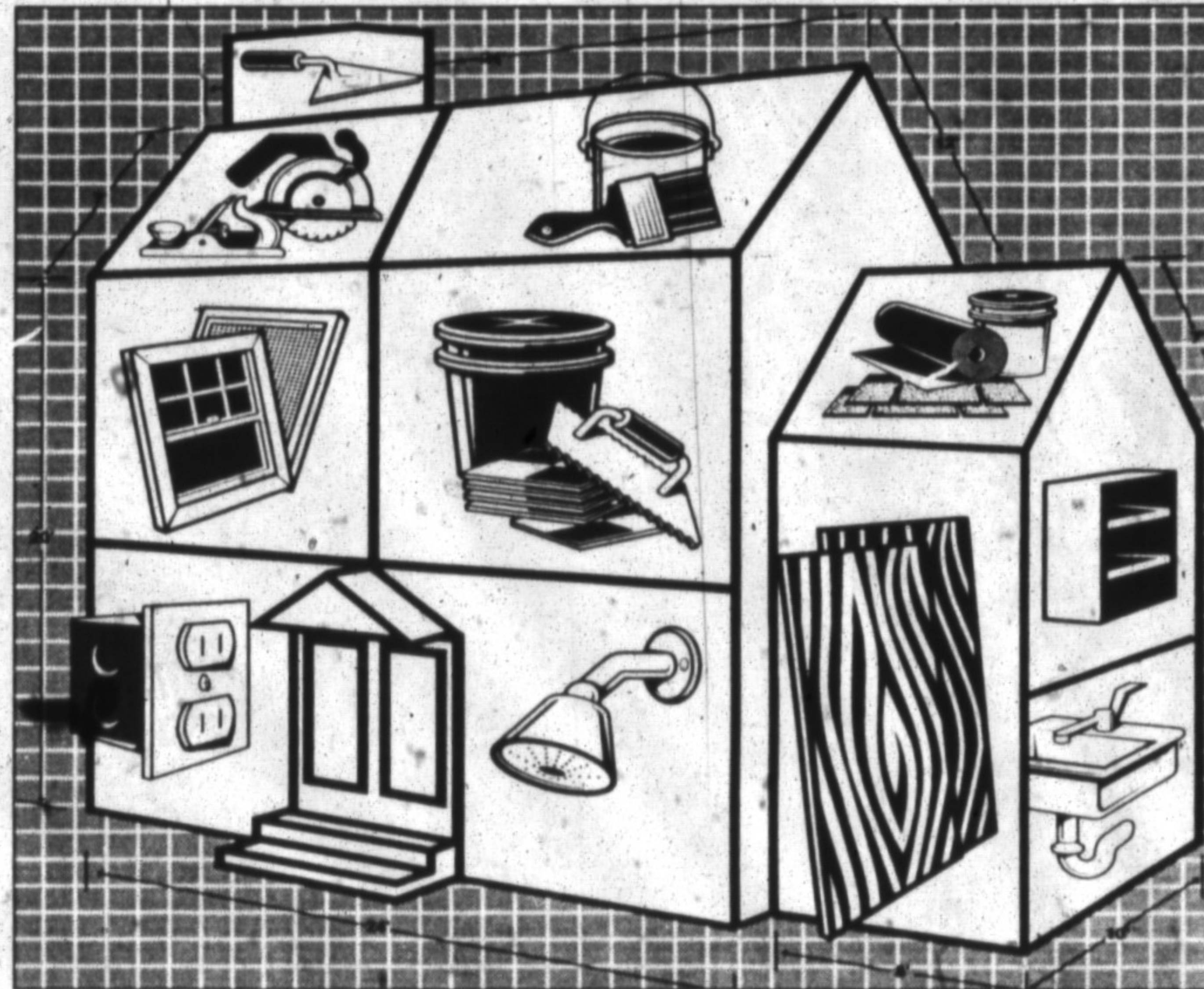
RE3—The Canadian Champion, Wednesday, November 6, 1996

The same logic applies to windows — but you