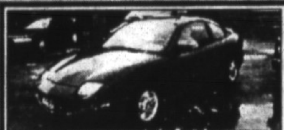
1996 PONTIAC SUNFIRE

All original, economical & sporty! 4 cyl auto with air! Only 19,000 km!! #9662.