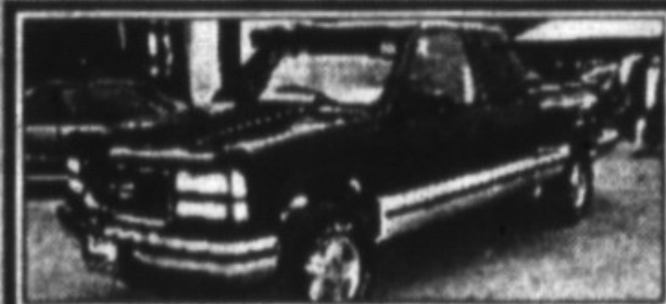
1995 GMC SLT X-CAB 4X4 Z-71

Top of the line! Fully loaded with 350 engine, leather, keyless entry! Really sharp truck!! #3434.