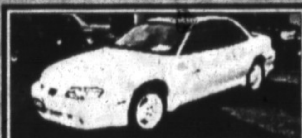
1996 PONTIAC GRAND AM GT

Not your ordinary Grand Am! Absolutely loaded "GT" model. Power sunroof, keyless entry! Only 10,000km!! GM warr. #9497.