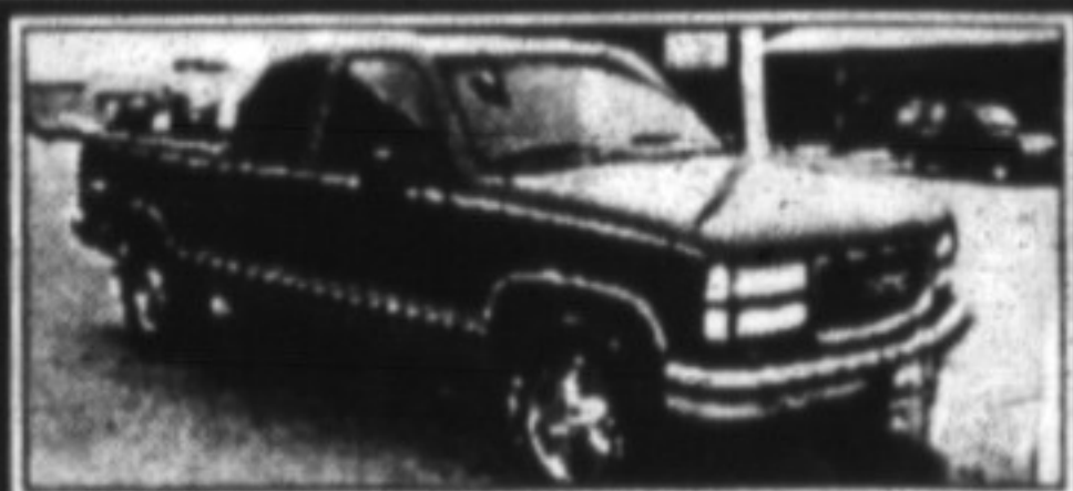
1995 GMC SLE X-CAB 4X4 STEPSIDE

This one has it all! 350 engine, power lumbar, big wheels & tires, 2-71 pkg!! Only 37,000 km!! #4015.