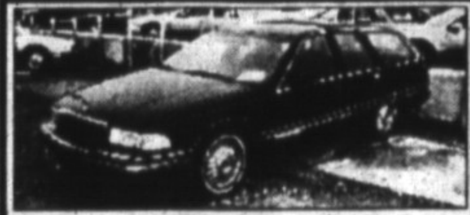
1992 BUICK ROADMASTER WAGON

Hard to find fullsize wagon! V8 (350), fully loaded! Leather, dual power seats, sunroof! Immaculate!! #7565.