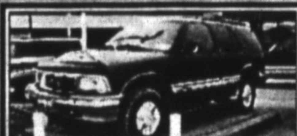
1996 GMC JIMMY SLT 4X4

Top of the line with every possible option! Leather, CD player, keyless entry! Only 29,000 km!! #9662.