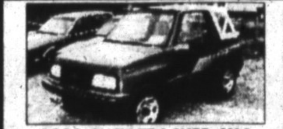
1990 CHEV TRACKER 4X4

All original, 4 cyl., 5 speed, four wheel drive! Excellent condition! Only 104,000 km!! Warranty #3283.