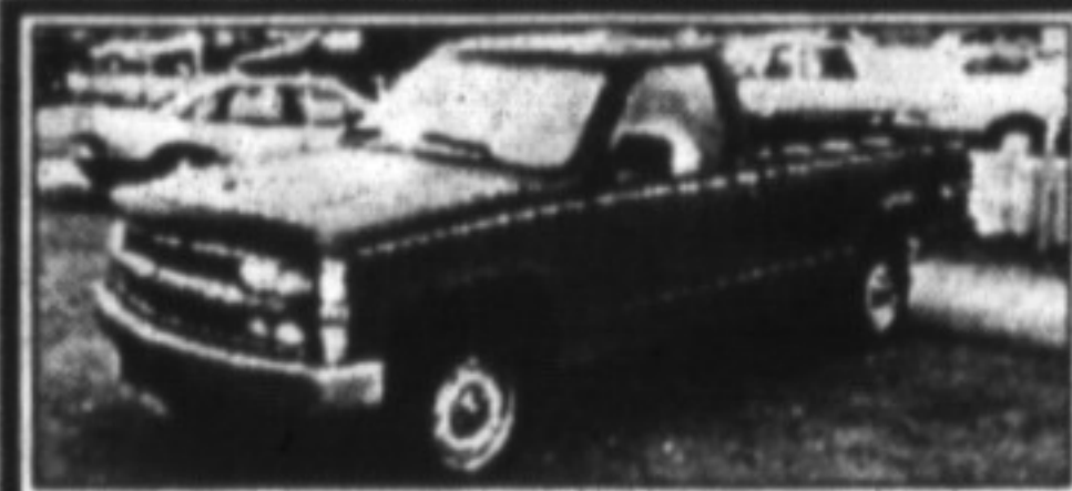
1994 CHEV CHEYENNE 4X4

One owner all original! V8 (5.0 ltr), auto, air conditioning, box liner, rear step bumper, trailer hitch! #1801.