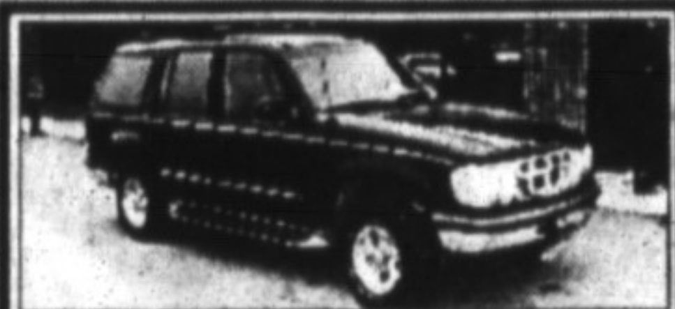
1995 FORD EXPLORER XLT

One owner, fully equipped! Power sunroof, leather, power seats, plus! Must be seen!! #2242.