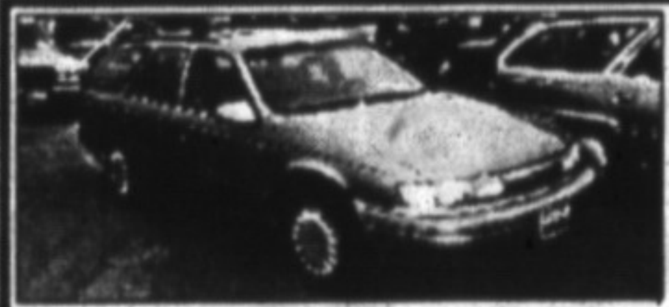
1992 FORD TAURUS GL WAGON

Affordable family vehicle! V6 (3.8 ltr), well equipped, has four brand new tires!! Warranty #7361.